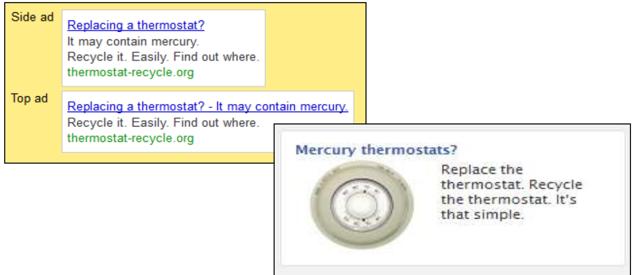
Exhibit 5: Examples of Google and Facebook Advertisements

Tradeshows —TRC attended and exhibited at the following trade shows relevant to Iowa: