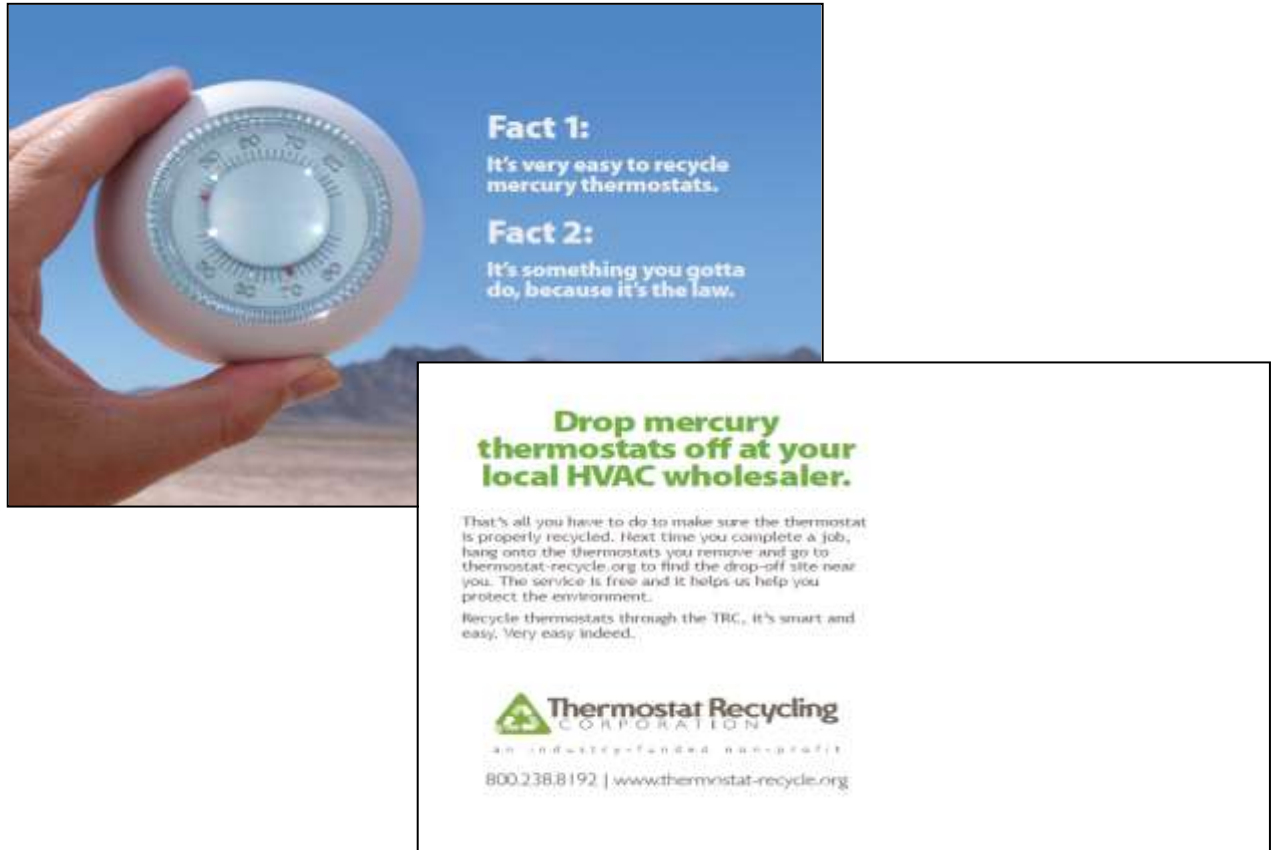
Exhibit 8: Stakeholder Outreach