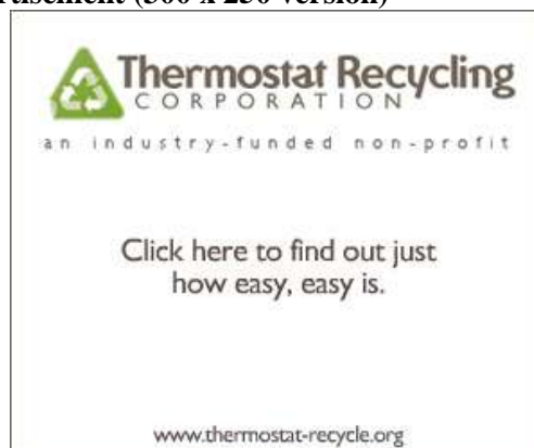
Exhibit 4: Web Banner Advertisement (300 x 250 version)

TRC strategically placed ads to coincide with the spring and fall HVAC business cycles. While the ads were featured, 701,528 impressions were delivered and 522 clicks on the advertisements were recorded.