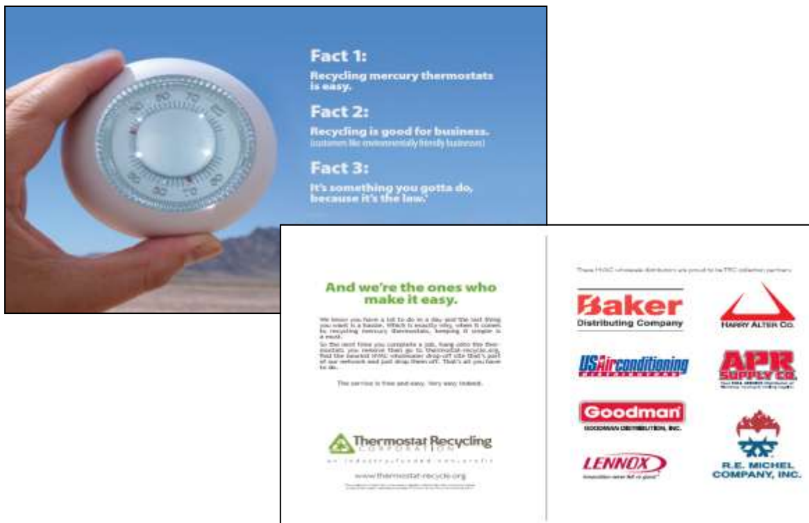
Exhibit 6: Tip-in Insert HVACR Business

Direct Mail— TRC implemented a direct-mail campaign in Iowa in 2011. TRC mailed a postcard (see Exhibit 7) to approximately 1,200 Iowa based HVAC contractors in March and October . TRC sourced the list of HVAC contractors from a commercial list supplier.