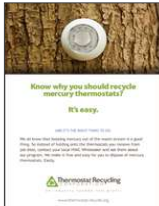
Exhibit 2: Examples of Print Collateral