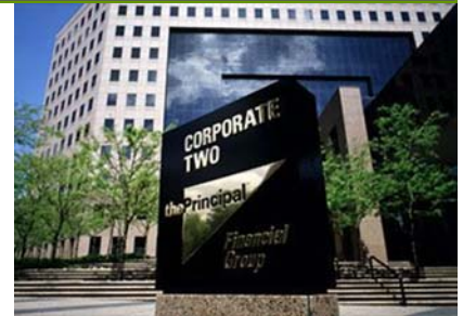
PFG'S 655 9th Street location

Through onsite waste sorts, IWE has assisted Principal Financial Group (PFG) in obtaining LEED certification for three buildings at their downtown Des Moines campus. Locations that have obtained certification include 711 High Street (Corp 1), 750 Park (Corp 4) and 655 9th Street (Corp 2). In February 2020, IWE performed a waste sort at PFG's onsite Child Development Center located at 801 Park. Audit reports have been submitted and LEED certification is currently pending for this location.