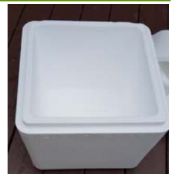
Coolers diverted from the landfill from a livestock pharmaceutical company

Iowa State University and Food Bank of Iowa at: https://www.facebook.com/iowadnr/videos/618292755723514