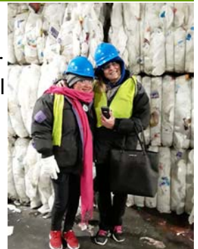
Youth Ambassadors posing by bales of recyclables at Scott County's Recycling Facility

Ambassadors toured the Waste Commission of Scott County's Recycling Center, Davenport Water Pollution Control Plant and Compost Facility and Nahant Marsh - the largest Urban wetland on the upper Mississippi River. Ambassadors also participated in a hands-on sculpture building activity. The sculpture was built from recycled materials and is now on display at Scott Community College.