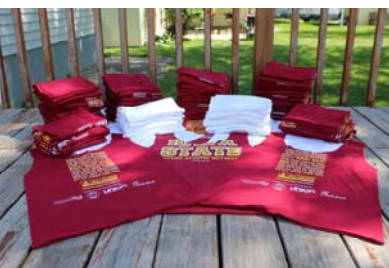
Bags made from upcycled teeshirts

Since the onset of the Covid 19 Pandemic in March 2020 and the Derecho on August 10, 2020, Area Resource Specialists have and will continue to assist healthcare organizations, non profits, businesses, municipalities, governmental agencies and private individuals in securing recycled materials to facilitate the production of personal protective equipment. Materials matched to date include but are not limited to; textiles to produce face masks and gowns and transparencies and plastic materials to produce face shields