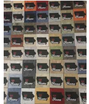
Magnets made from recycled floor tiles and repurposed advertising magnets.

Area Resource Specialists assisted students onsite in making Thank You magnets utilizing upcycled floor tiles and advertising magnets diverted from the landfill by IWE and acquired from Iowa State University. The magnets along with notes created by the students using recycled greeting cards were collected and later included in individual snack packs that were distributed to area farmers during the 2019 harvest by staff members of MaxYield Cooperative.