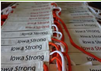
Masks made from upcycled canvas bags