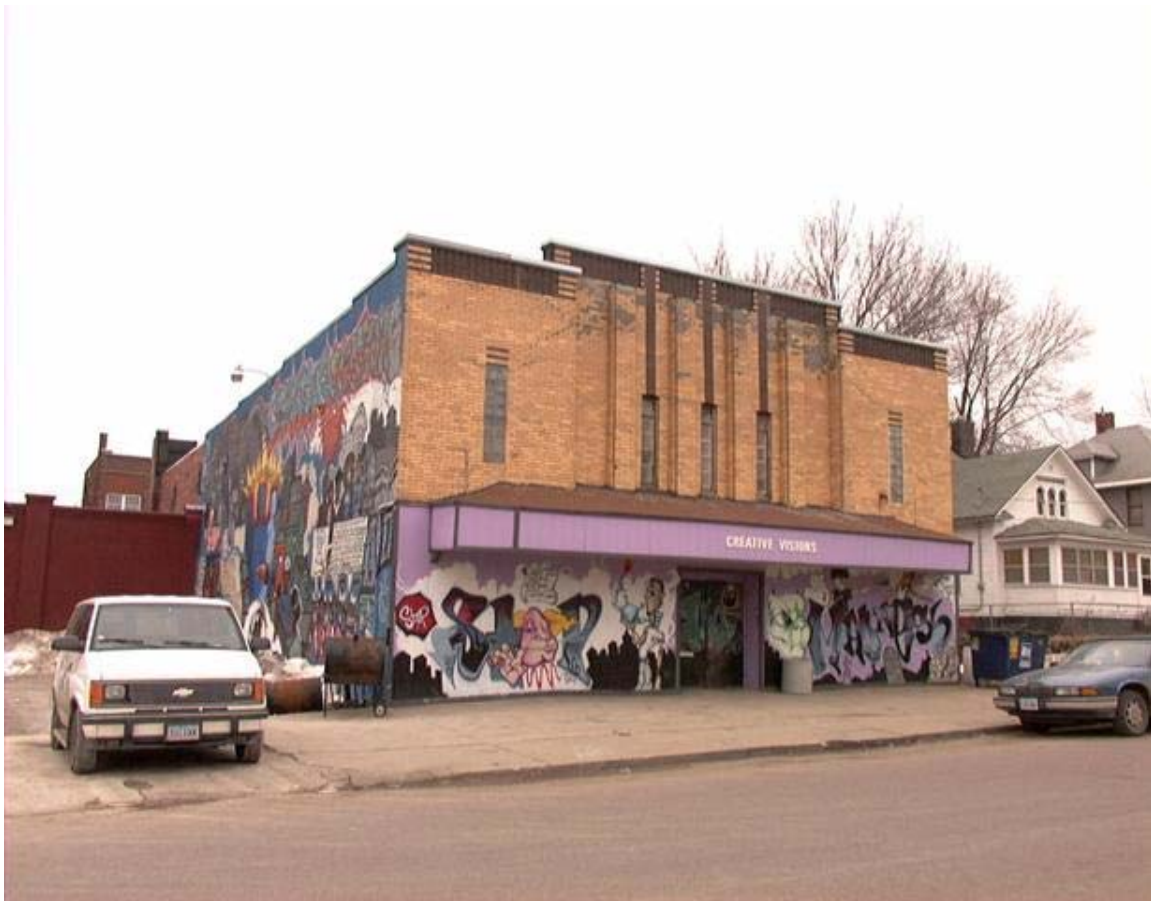
Creative Visions Property, 1343 13 th Street, Des Moines, Iowa. Registration Number 197910167, LUST Number 9LTA13.