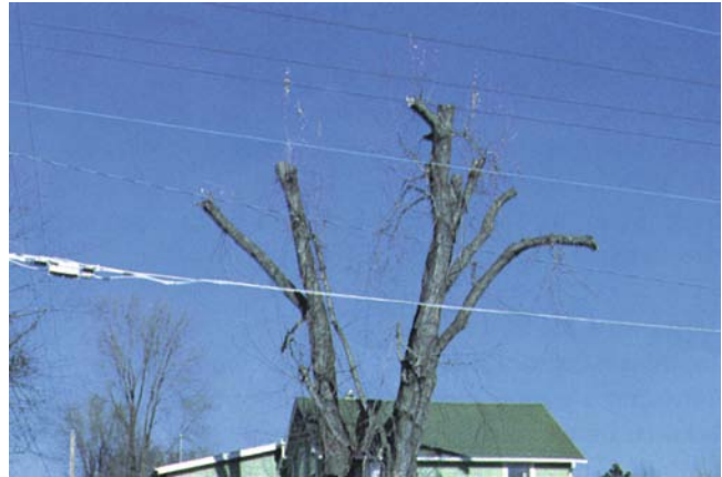
Figure 1. Large branch stubs invite insect and disease problems.

Large branch stubs that result from topping are open invitations to insects and wood-rotting pathogens (figure 1). In particular, opportunistic pathogens find the living, but virtually defenseless stub an inviting and plentiful source of food. Unable to receive substantial amounts of energy from other parts of the tree, stubs lack the capacity to wall-off or compartmentalize the wound, allowing decay-causing organisms easy access. Once