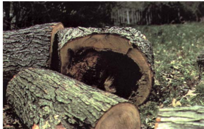
Figure 2. Decay beginning in branch stubs may spread into the main trunk.

decay has entered the branch stub, it may progress into the main trunk (figure 2), eventually killing the tree and creating a hazardous situation for people. Coating large branch stubs with a wound dressing is ineffective in stopping the entry and spread of decay-causing organisms.