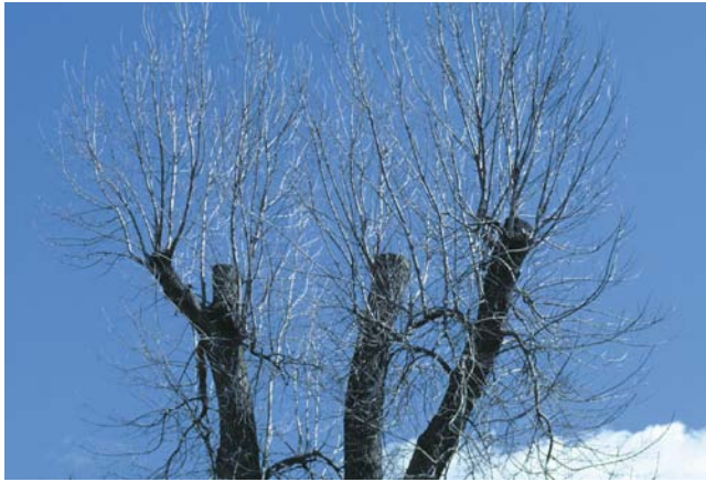
Figure 3. Weakly attached water sprouts form on topped trees.

Utility companies frequently practice topping to alleviate tree interference with overhead power and communication lines. However, a topped tree often will regrow to its original height faster and with greater density than a tree that has received proper pruning (figure 4). Because the results often are short-lived, topping actually is a more costly solution to the problem of interfering trees than crown reduction by thinning.