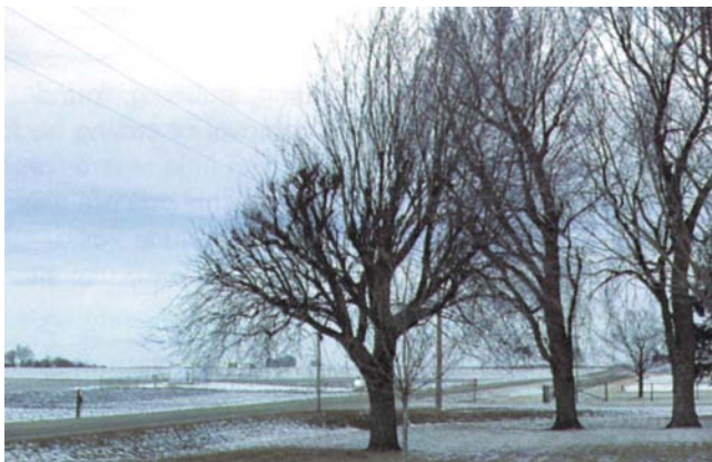
Figure 4. Topping is a costly and ineffective solution for this interfering tree.

Utility companies frequently practice topping to alleviate tree interference with overhead power and communication lines. However, a topped tree often will regrow to its original height faster and with greater density than a tree that has received proper pruning (figure 4). Because the results often are short-lived, topping actually is a more costly solution to the problem of interfering trees than crown reduction by thinning.