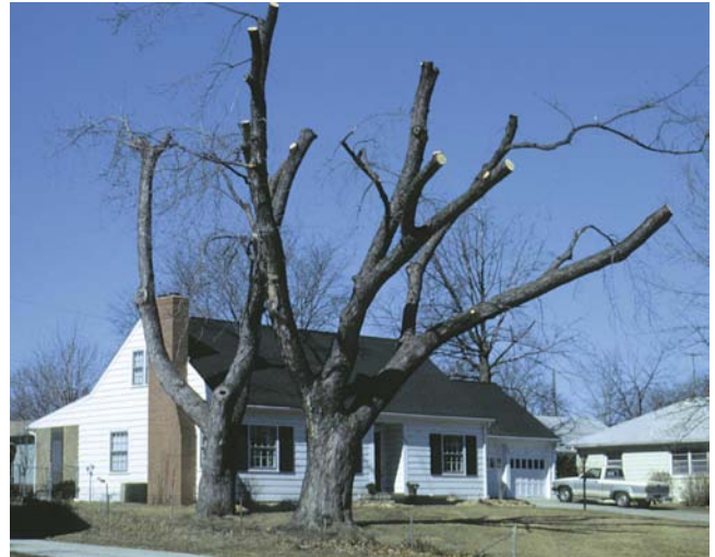
Figure 5. Topping disfigures trees and lowers their value.

(figure 6). Pruning properly-sited trees then becomes a matter of simply maintaining tree structure, form, health, and appearance (figure 7). In addition, there are many excellent smaller trees that work well in urban sites or anywhere potential obstructions exist.