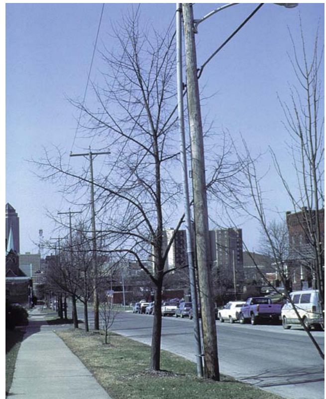
Figure 6. Do not plant large growing trees beneath power and communication lines.