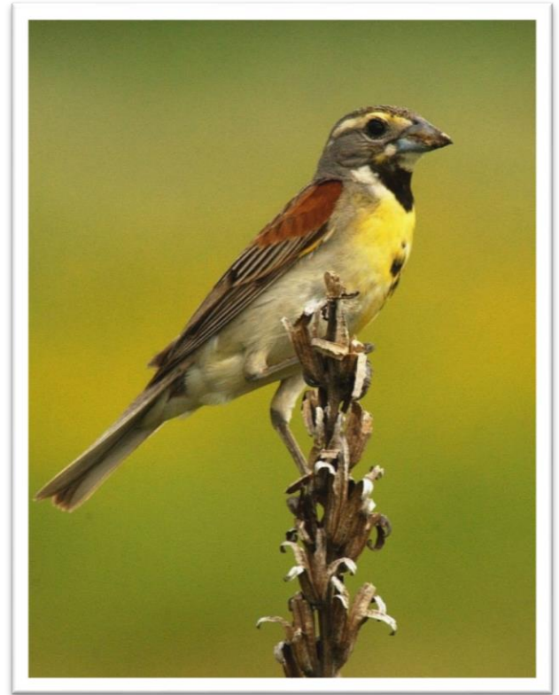
Male Dickcissel on old stalk of Evening Primrose.

The practice is available most counties near existing protected wildlife habitats. These areas are eligible and have a high priority, because wildlife species benefit most when there are large expanses of grasslands or wetlands. Eligible producers can sign up at their local USDA Farm Service Agency .