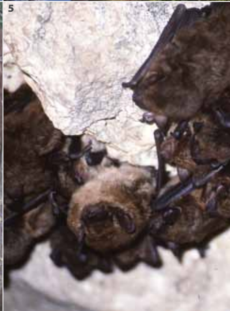
1) Mississippi River view atop 300-foot limestone bluffs on Overlook Trail at Bellevue State Park. 2) Potter's Mill, Iowa's oldest, built in 1843, just outside Bellevue S.P., offers its famed 10-ounce Iowa chop and bed and breakfast rooms with nature views adjacent Big Mill Creek. 3) New England-like view of Bellevue in autumn splendor. 4) Vertical levels of trails and rugged topography make Maquoketa Caves seem far larger than its size. Caves like Up-N-Down, Shinbone, Ice Cave with its chills, Hernando's Hideaway and others have long beckoned lovers of lush hills and meandering trails. Centuries ago, American Indians left tools and projectile points in the caves. More recently, early cavers stole milk-white stalactites and stalagmites, although other formations remain. Growing an inch per century, new formations slowly return. 5) Big Brown bats cluster to share heat in Dancehall Cave, where up to 750 bats overwinter. Cave is unlit and off limits to hikers during cold weather to protect slumbering bats, usually reopening around April 1, depending upon weather.

If they aren't biting, he says, they won't be changing their minds soon.