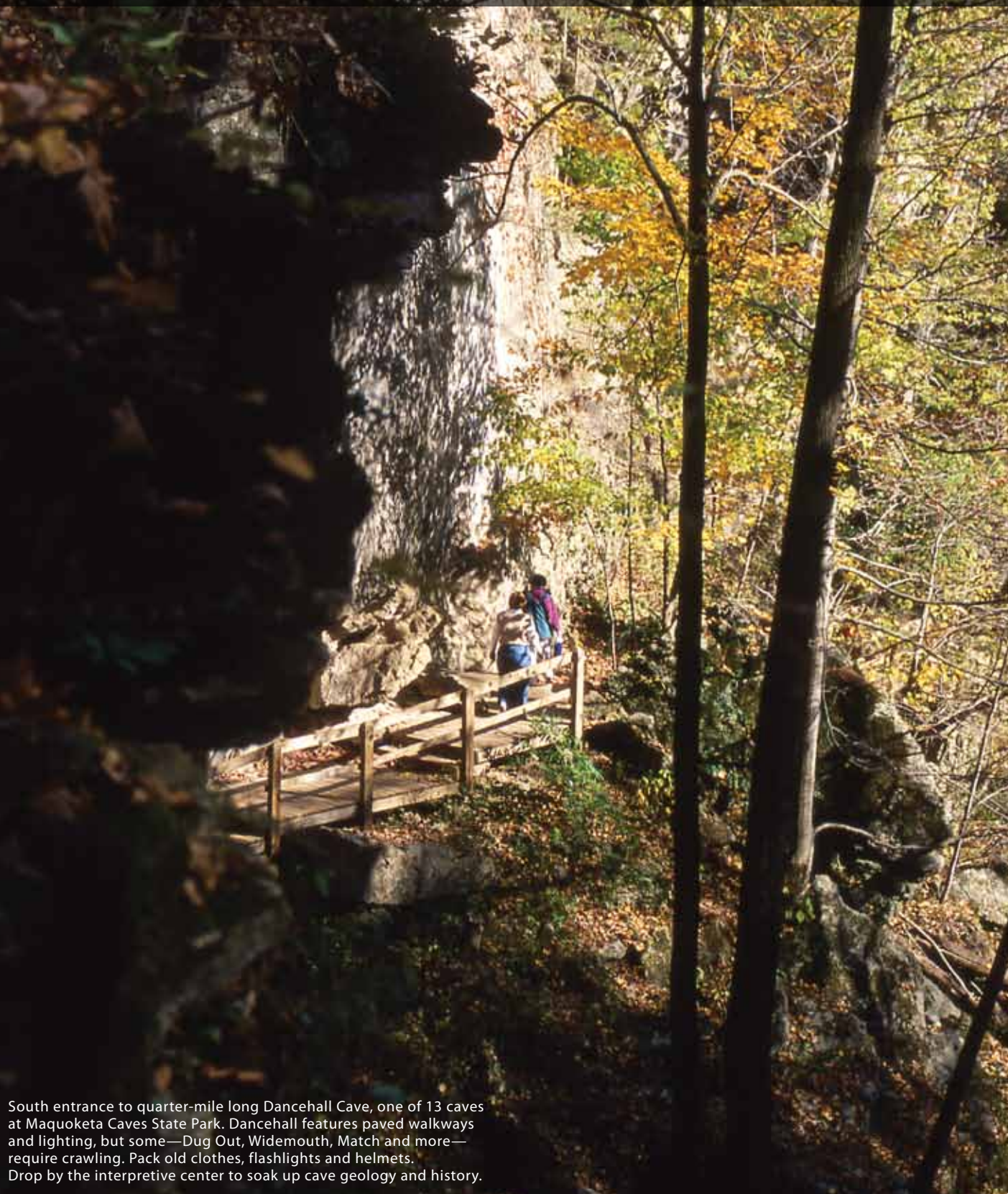
South entrance to quarter-mile long Dancehall Cave, one of 13 caves at Maquoketa Caves State Park. Dancehall features paved walkways and lighting, but some—Dug Out, Widemouth, Match and more—require crawling. Pack old clothes, flashlights and helmets. Drop by the interpretive center to soak up cave geology and history.

OUTDOOR FUNSPOTS ALONG JACKSON COUNTY'S GRANT WOOD SCENIC BYWAY IS A TRIP THROUGH IOWA'S LIFEBLOOD