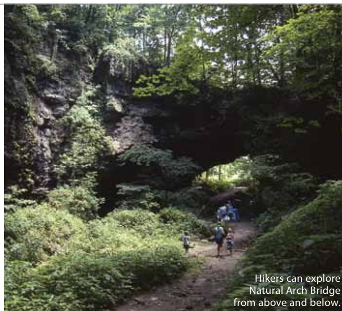
Hikers can explore Natural Arch Bridge from above and below.

The caves could easily swallow two days of rapt exploration. So it's a good thing that Bluff Lake Catfish Farm, a few miles west, serves all-you-can-eat dinners through the weekend. The hour-long wait is doable between the bar, the ducks and geese, and a catfish pond where the Friday night special lurks.