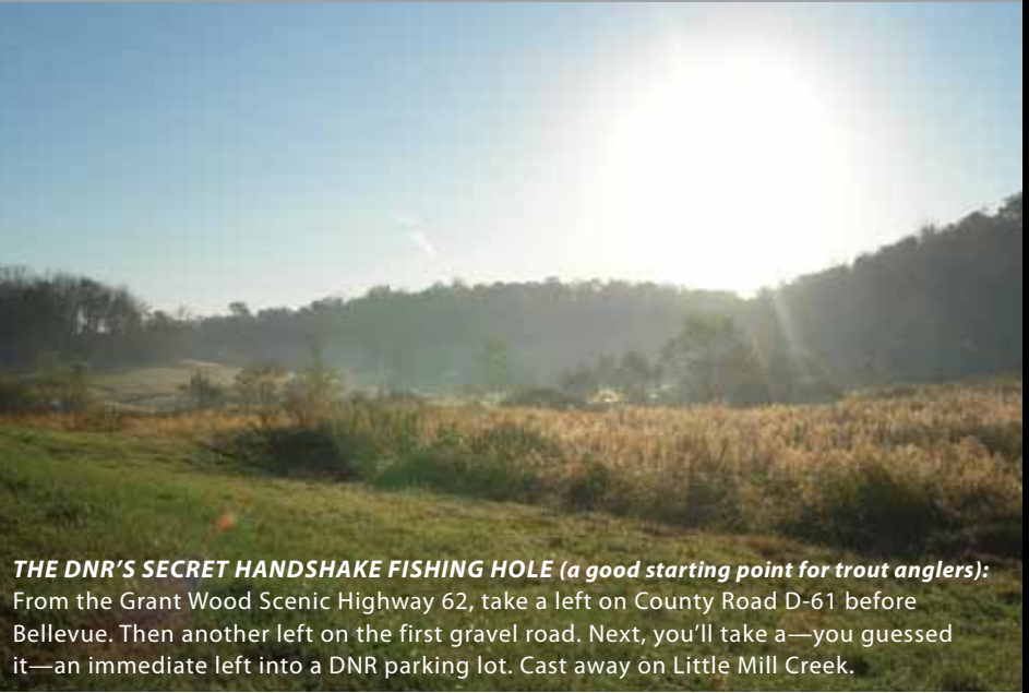
THE DNR'S SECRET HANDSHAKE FISHING HOLE (a good starting point for trout anglers): From the Grant Wood Scenic Highway 62, take a left on County Road D-61 before Bellevue. Then another left on the first gravel road. Next, you'll take a—you guessed it—an immediate left into a DNR parking lot. Cast away on Little Mill Creek.