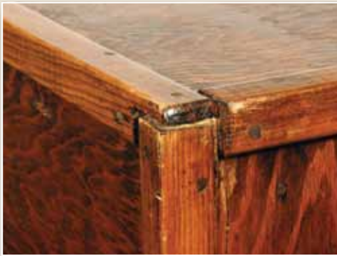
Use wood molding for top edges. Finish with wood stain.