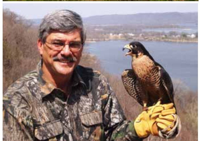
TOP: Learn more about peregrine history and review searchable databases of banded birds by locale online at http://midwestperegrine.org/ . SECOND FROM TOP: A peregrine falcon chick surveys its surroundings from atop a Mississippi River cliff ledge. As a direct result of efforts of the Iowa Peregrine Falcon Recovery Team, wild peregrines are currently returning to recolonize historic eyries up and down the Upper Mississippi. SECOND FROM BOTTOM: Falcons continue to recolonize historic cliff ledge eyries of the Upper Mississippi river. During 2007, expanding falcon populations established a new modern-day record. Twelve active breeding territories were inventoried with 10 successful nests producing 23 fledged young. A victim of DDT contamination, the species entirely disappeared from the Mississippi River during the 1960s. The falcons' successful restoration to natural cliff sites results from efforts of the Iowa Peregrine Falcon Recovery Team. From 1995 to 2000, the group's volunteers raised more than $100,000 needed to purchase and release 107 captive reared, young peregrines. BOTTOM: DNR staff writer, photographer and licensed falconer Lowell Washburn was instrumental in Iowa peregrine falcon recovery efforts.