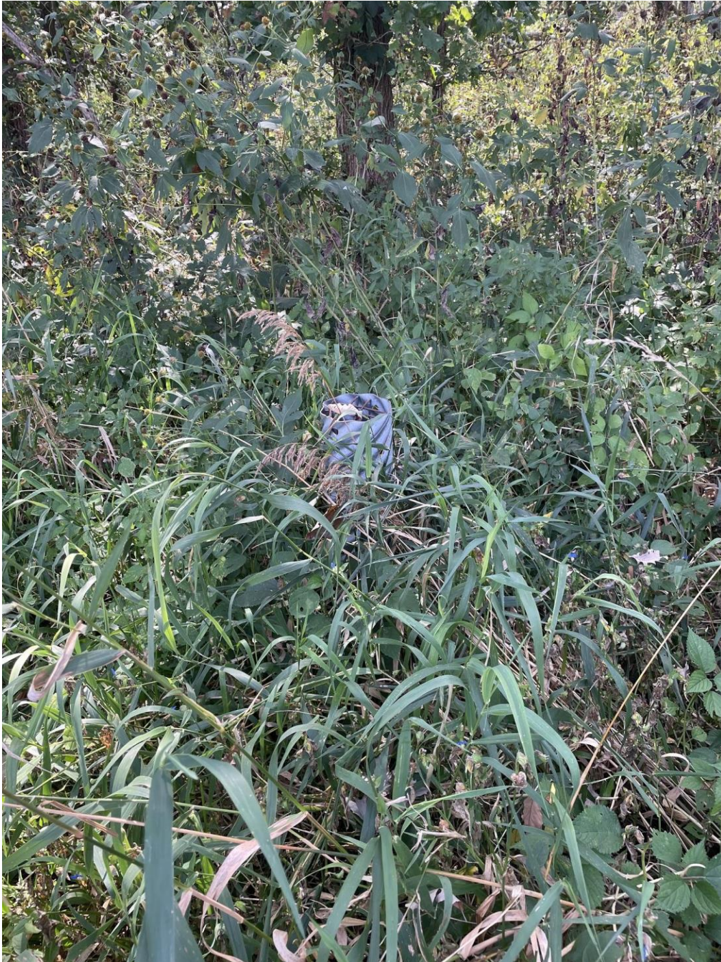
Figure 1. Site #1 photo of the tile intake.