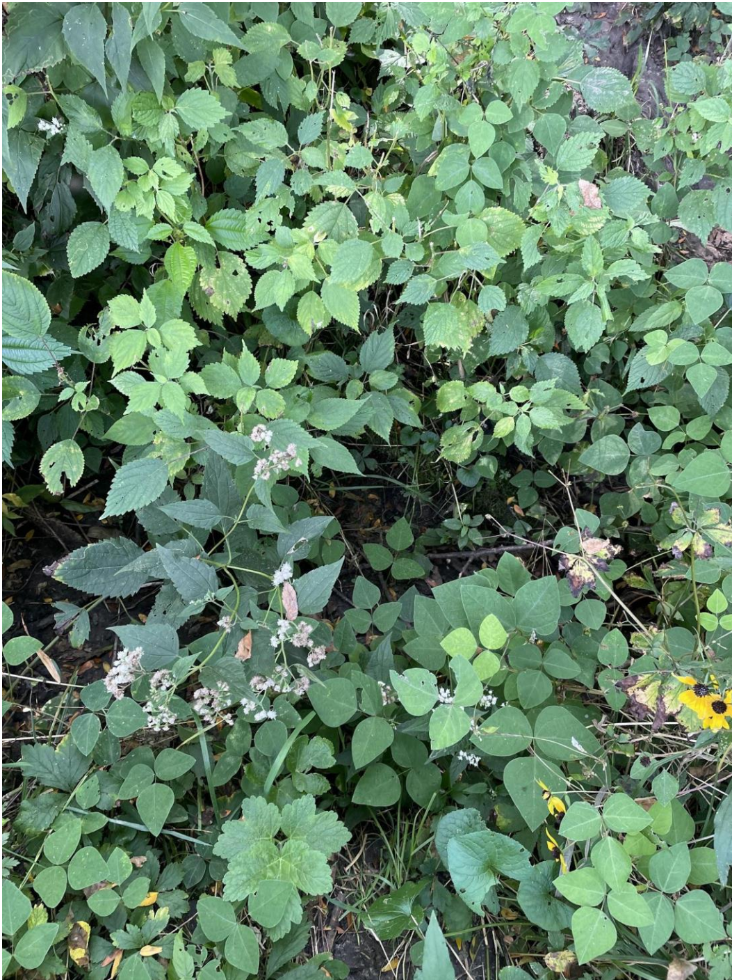
Figure 2. Site #2