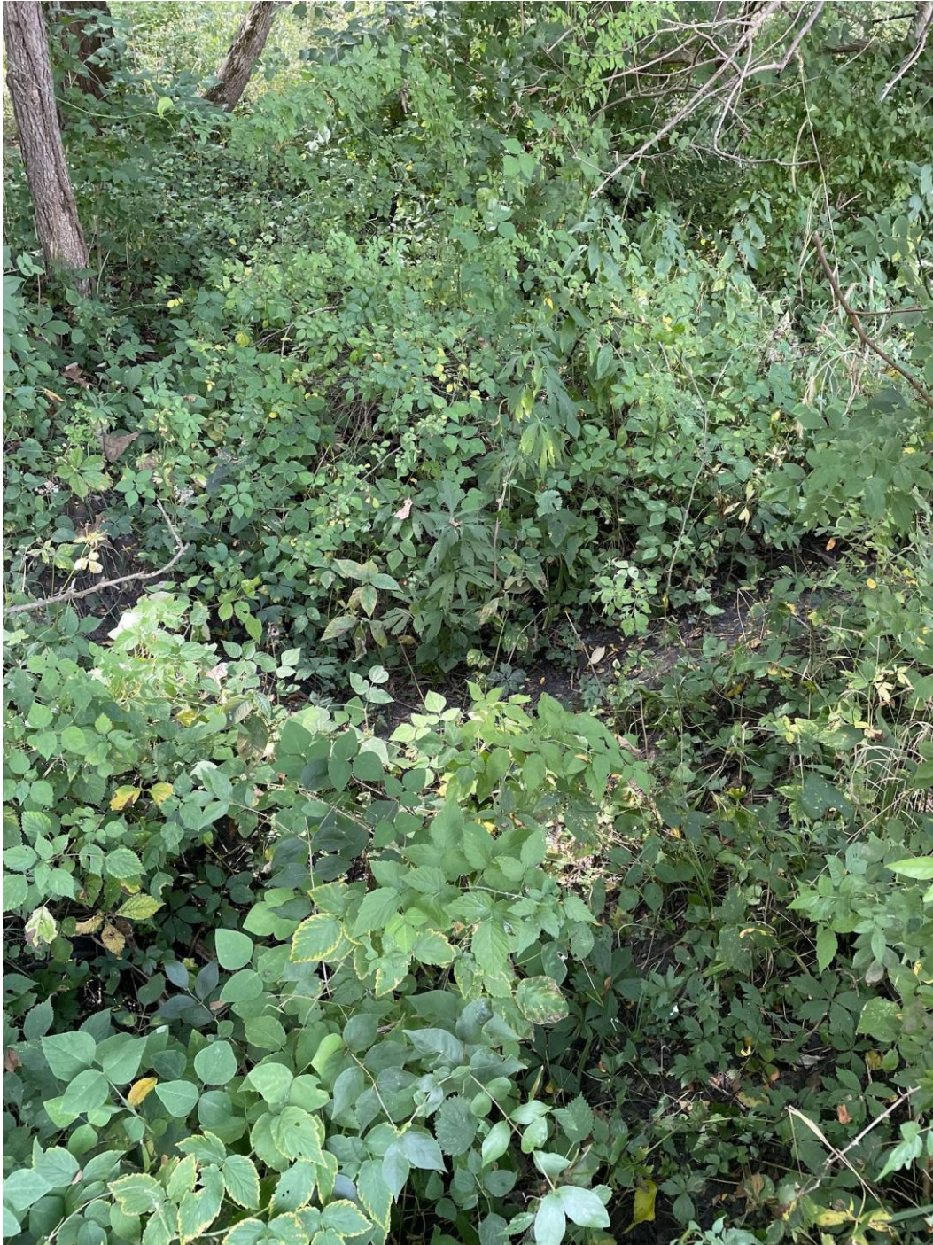
Figure 3. Area of the facility's outfall.