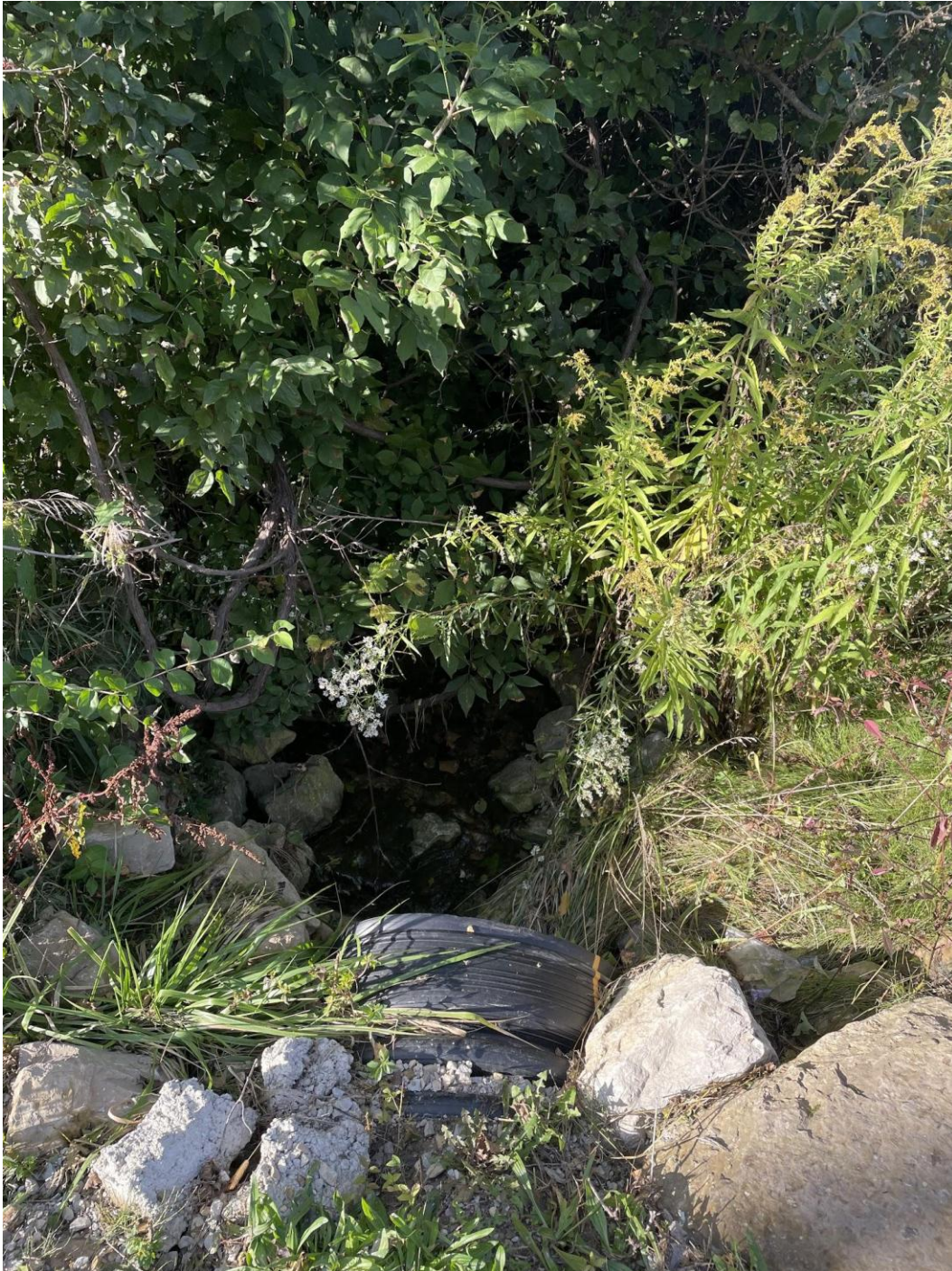
Figure 7. Site #4 looking upstream at outfall.