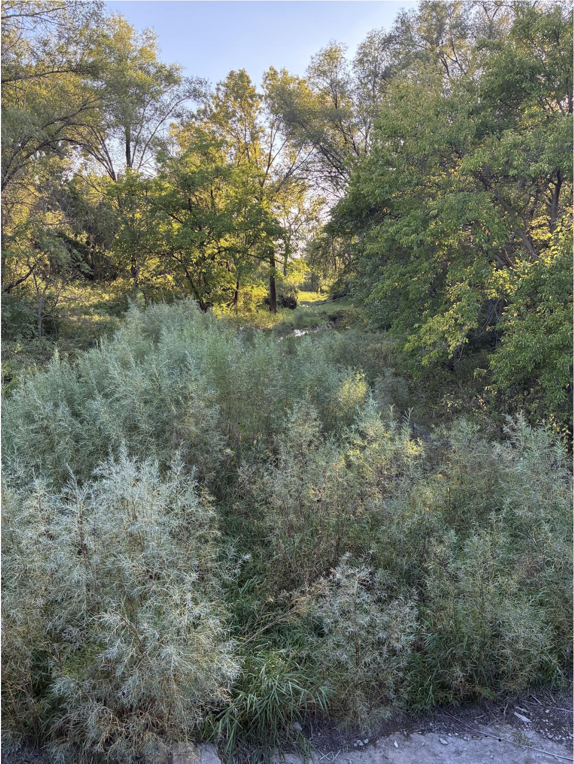
Figure 4. Site #2 looking downstream.