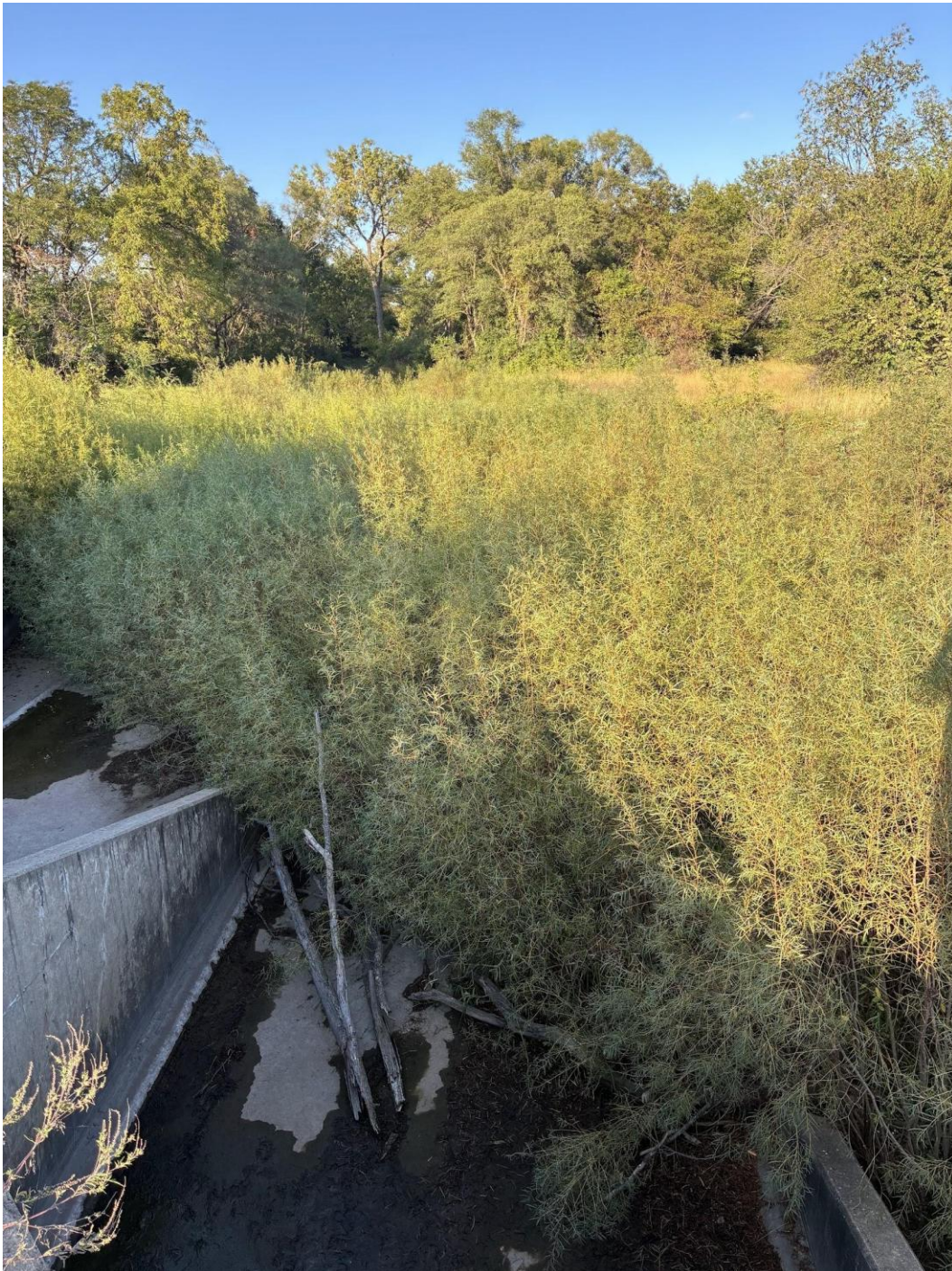
Figure 1. Site #1 looking upstream.