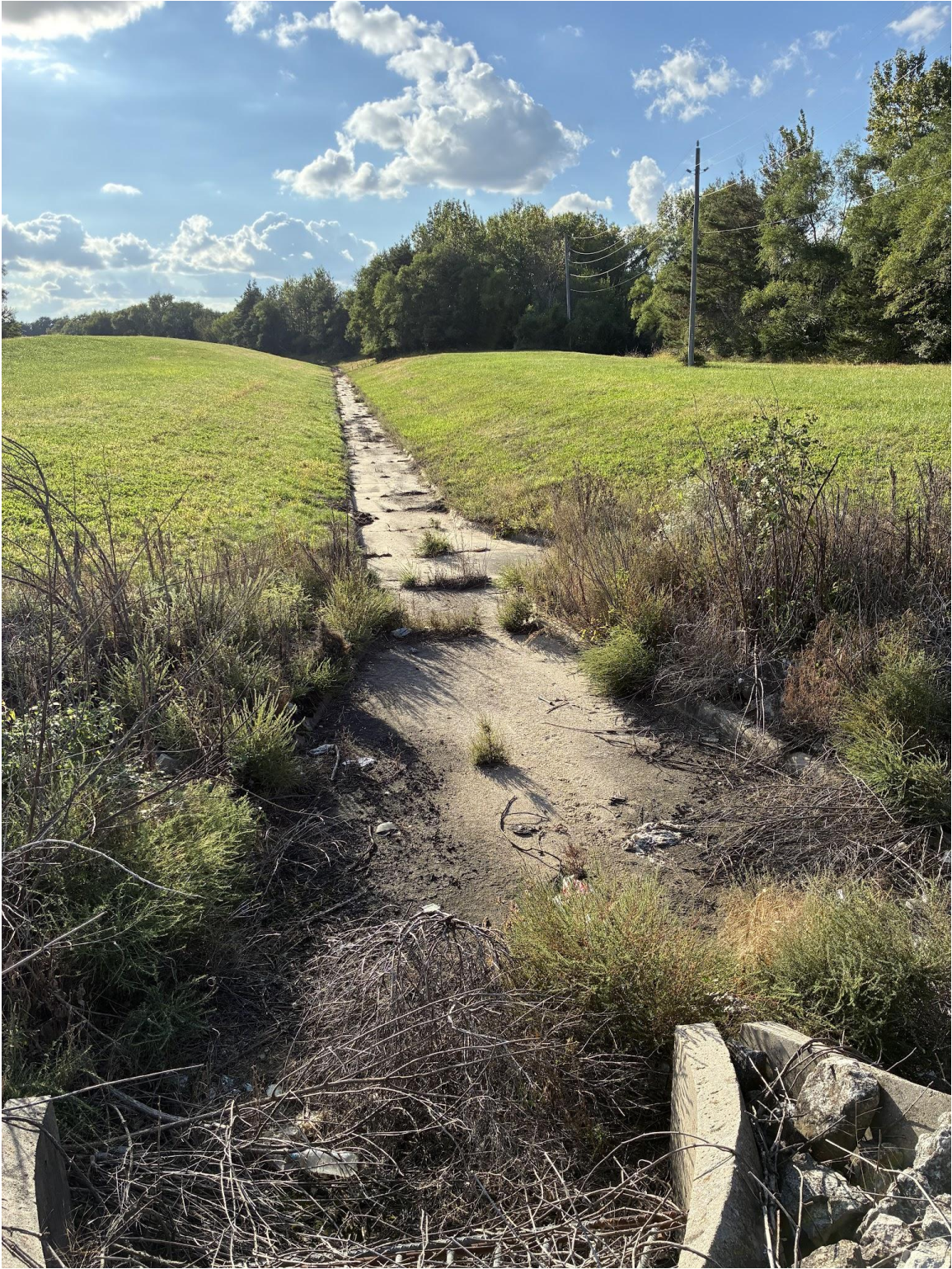
Figure 6. Site #3 looking downstream.