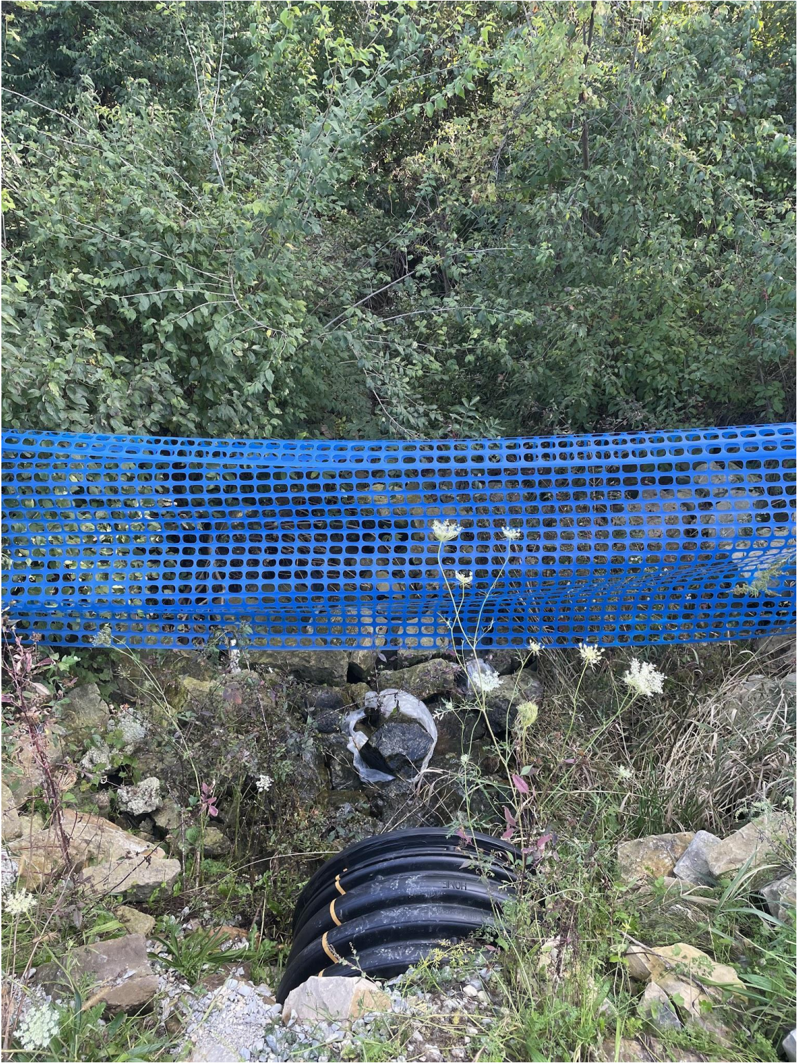
Figure 8. Site #4 looking downstream.