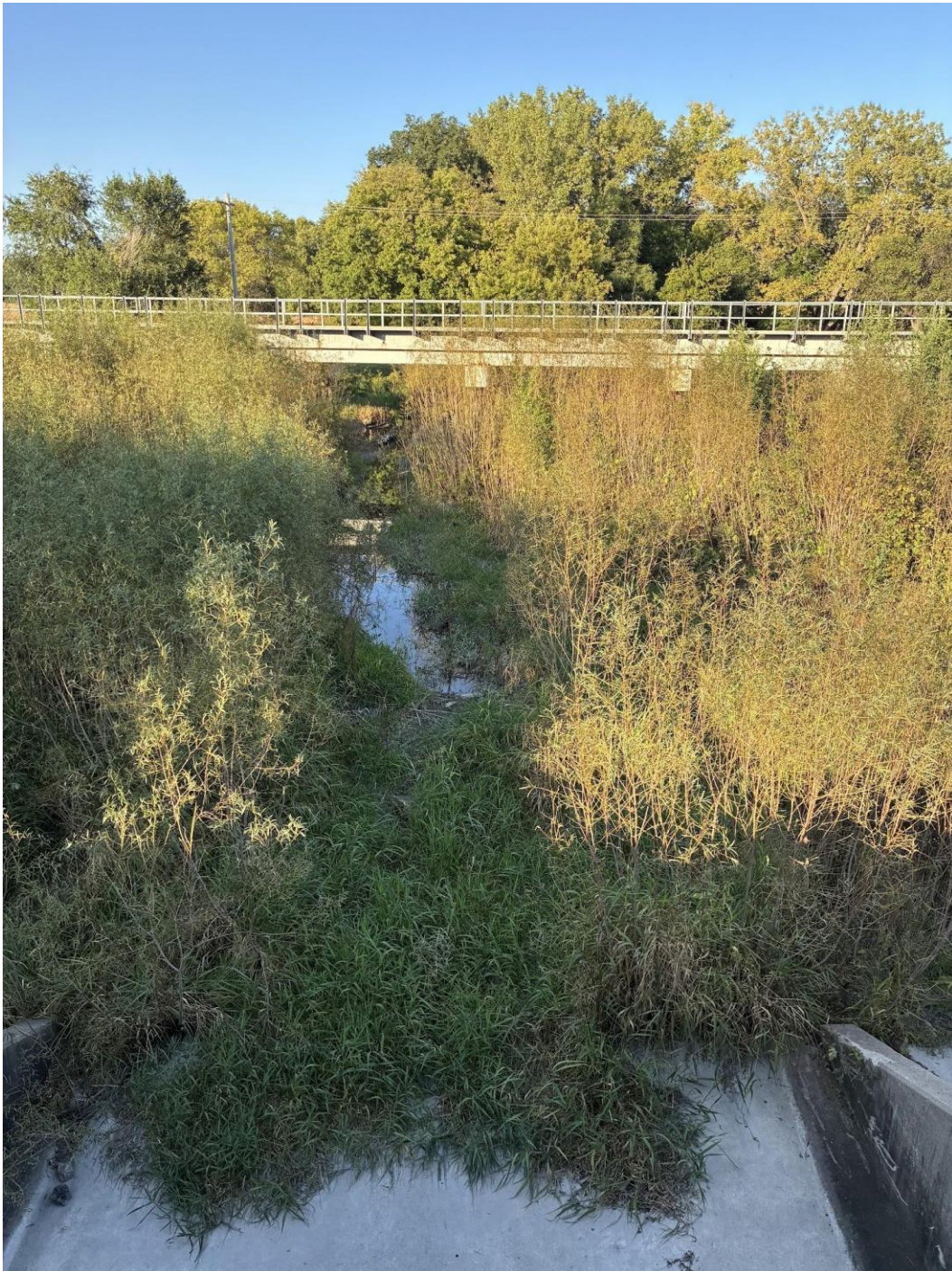
Figure 3. Site #2 looking upstream.