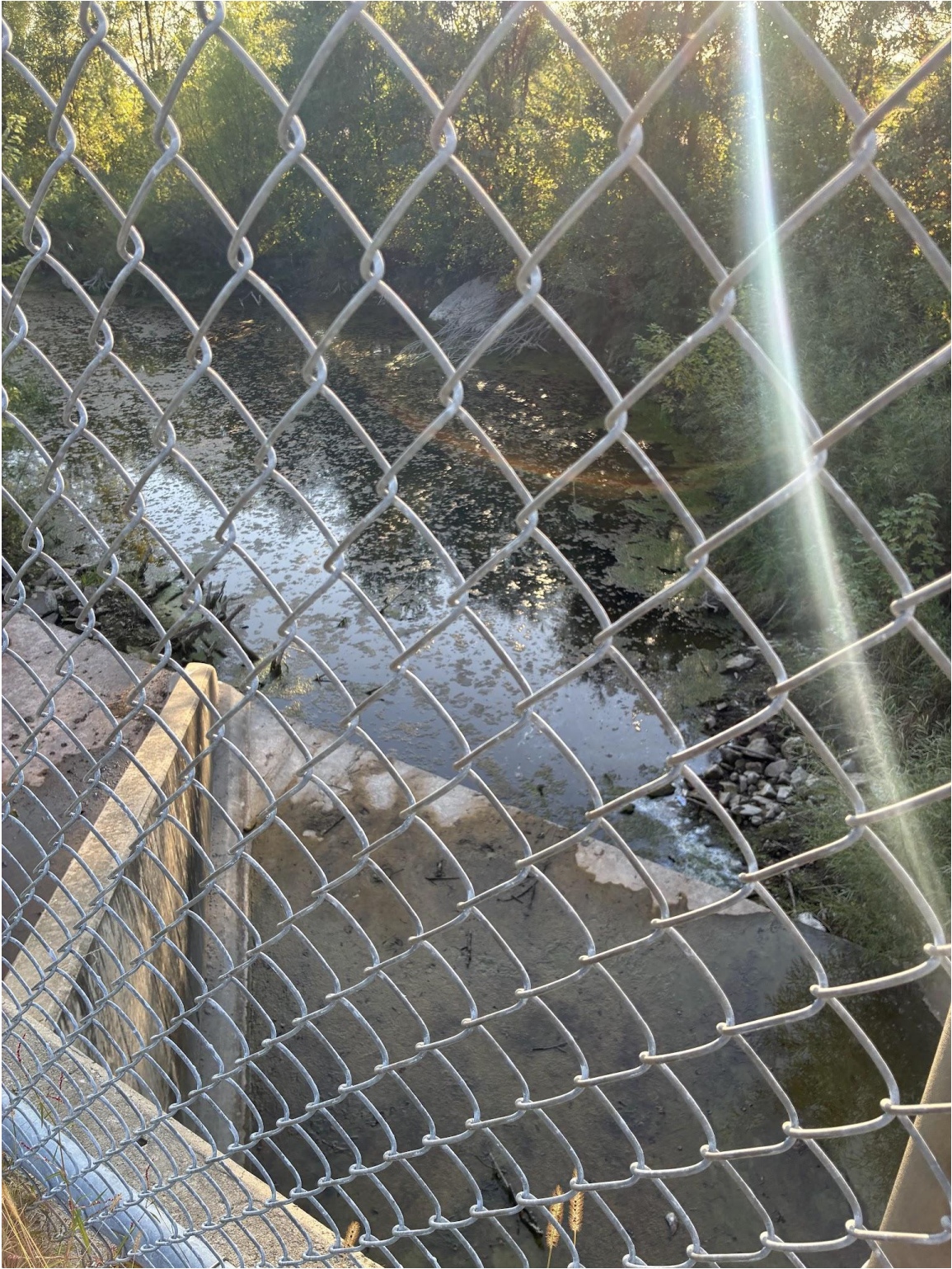
Figure 2. Site #1 looking downstream.