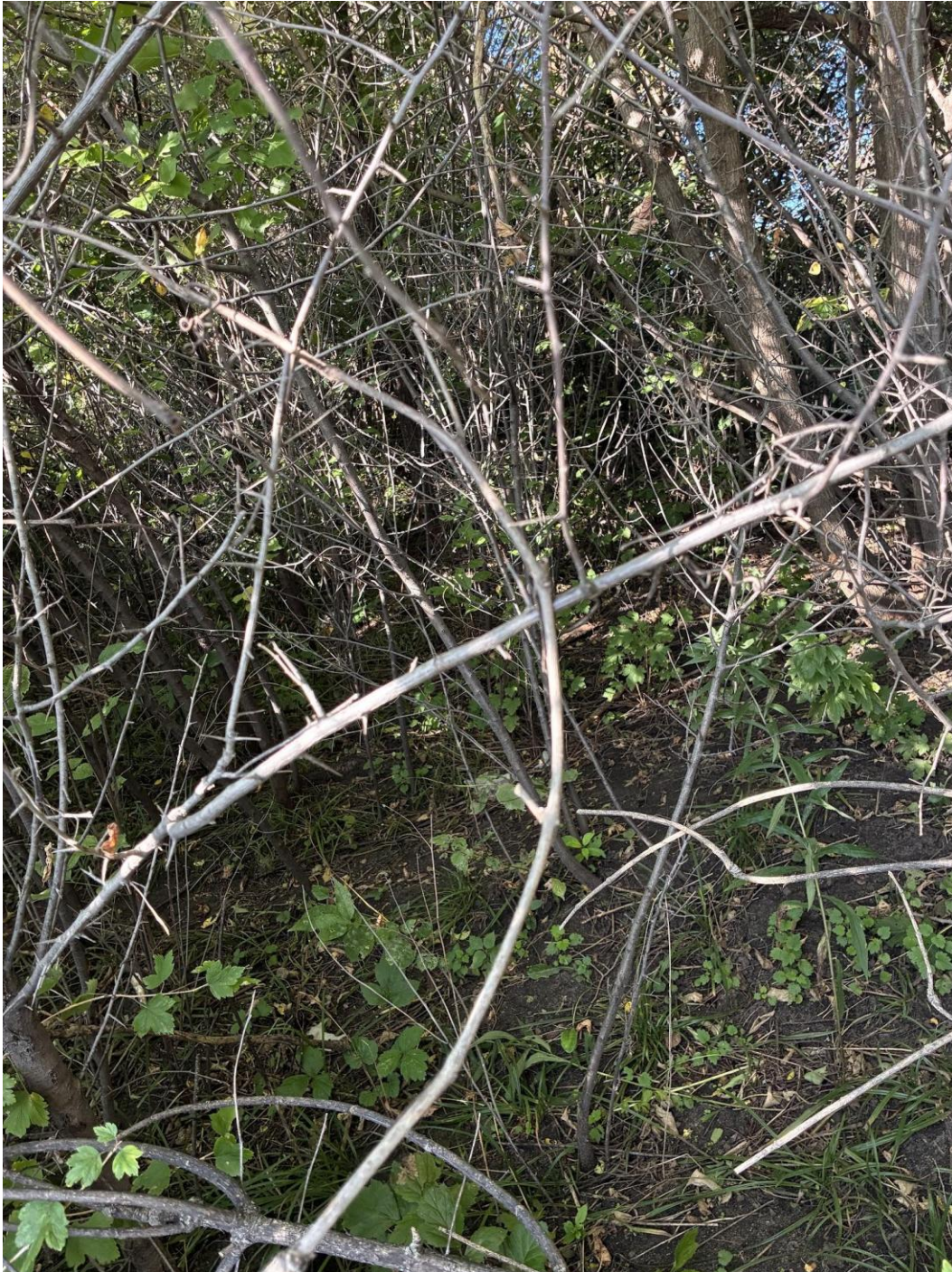
Figure 5. Site #3 looking upstream.