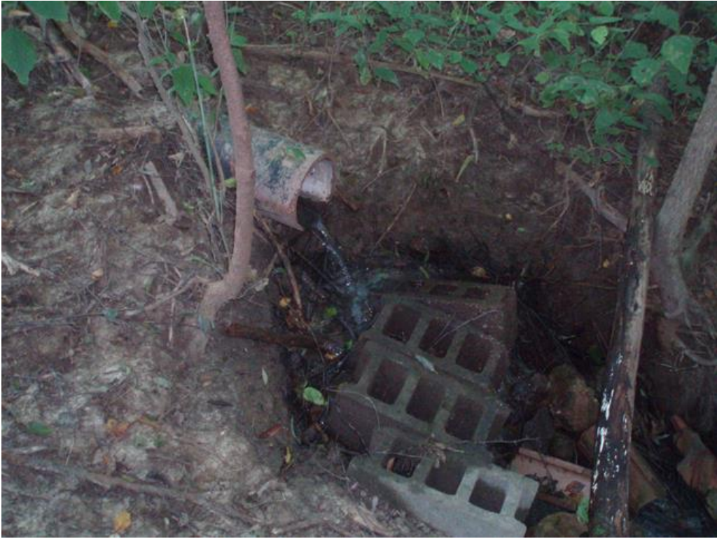
Figure 1. 36-1 Outfall.