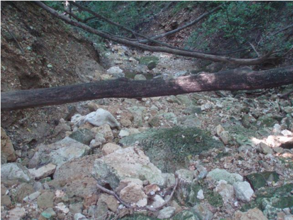
Figure 5. 36-1 Recreational use assessment downstream looking downstream.