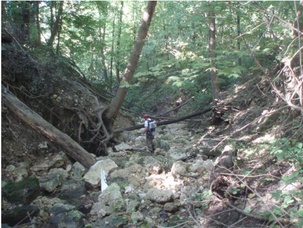
Figure 3. 36-1 Recreational use assessment upstream looking downstream.