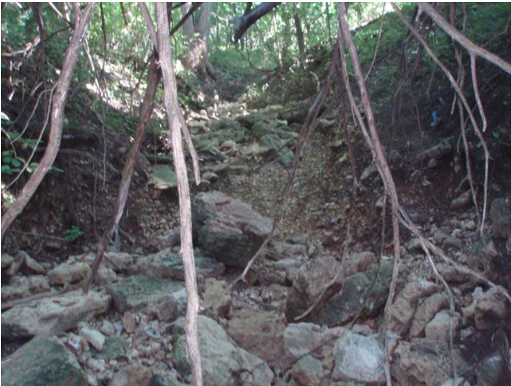
Figure 2. 36-1 Recreational use assessment upstream looking upstream.