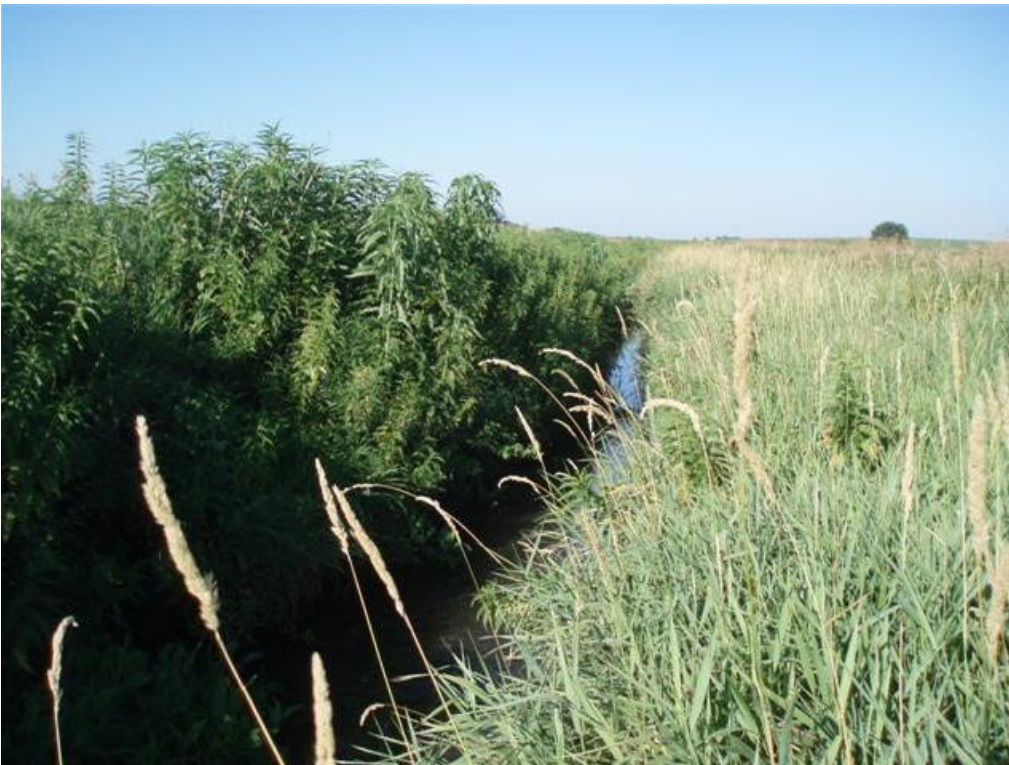
Figure 2. 510-3 Start of aquatics looking downstream.