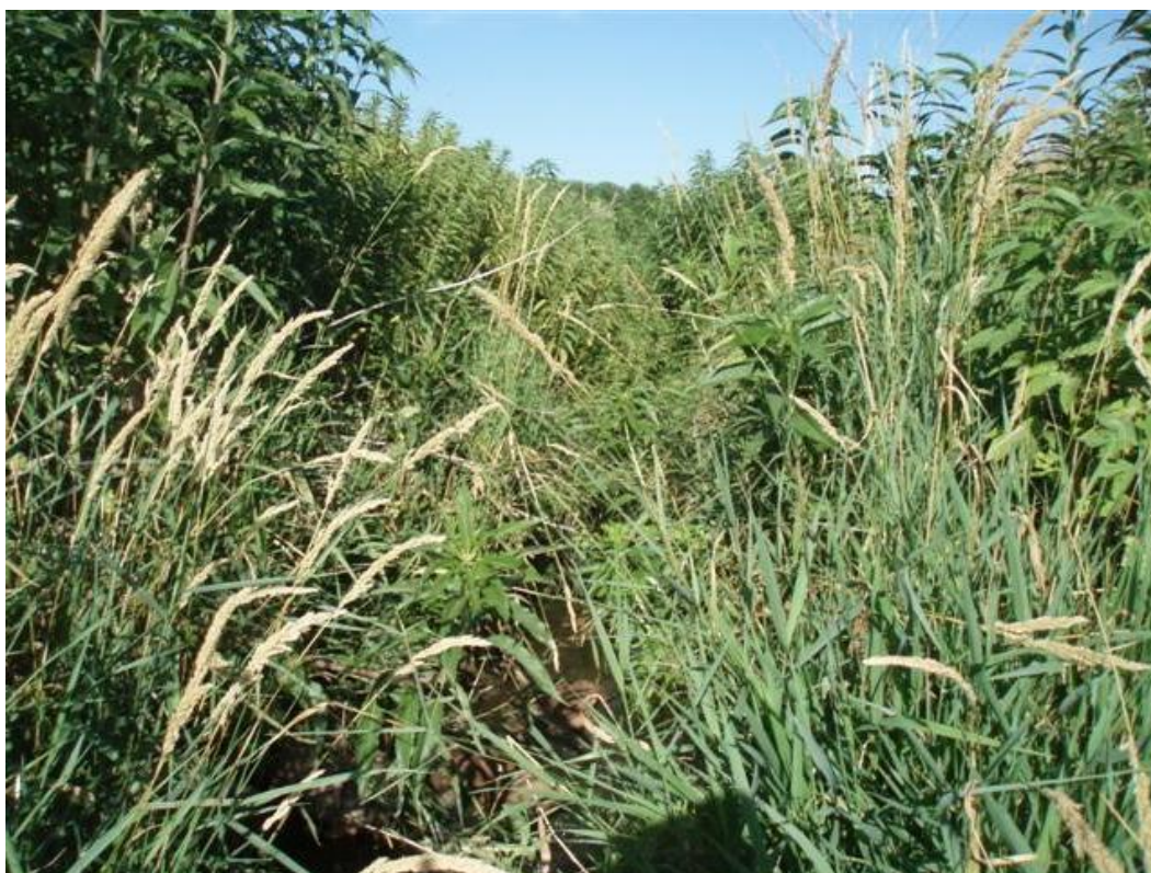
Figure 4. 510-3 End of aquatics looking downstream.