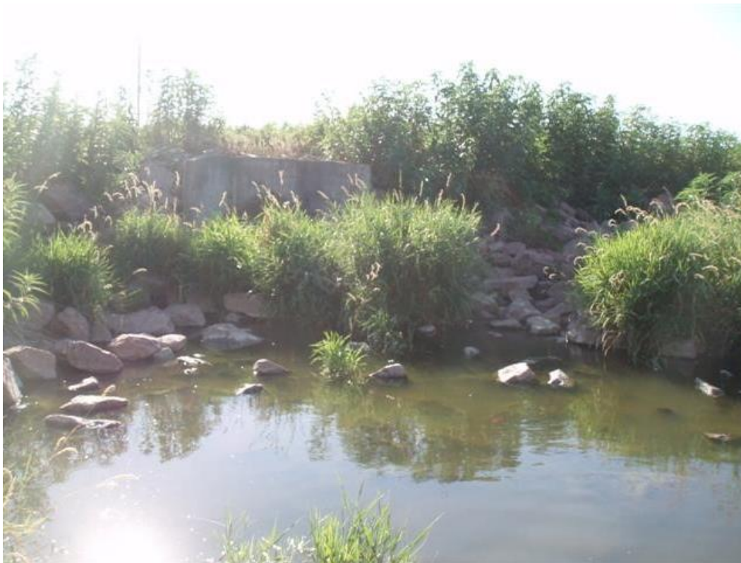
Figure 3. 510-3 End of aquatics looking upstream.