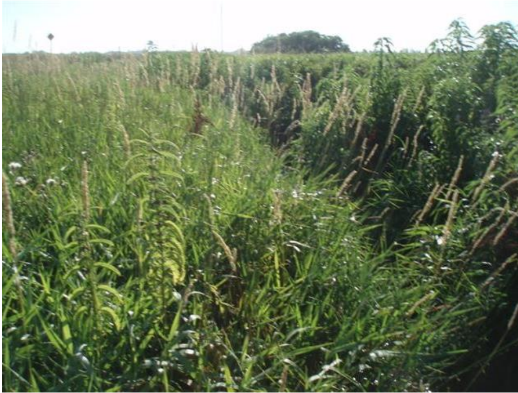
Figure 1. 510-3 Start of aquatics looking upstream.