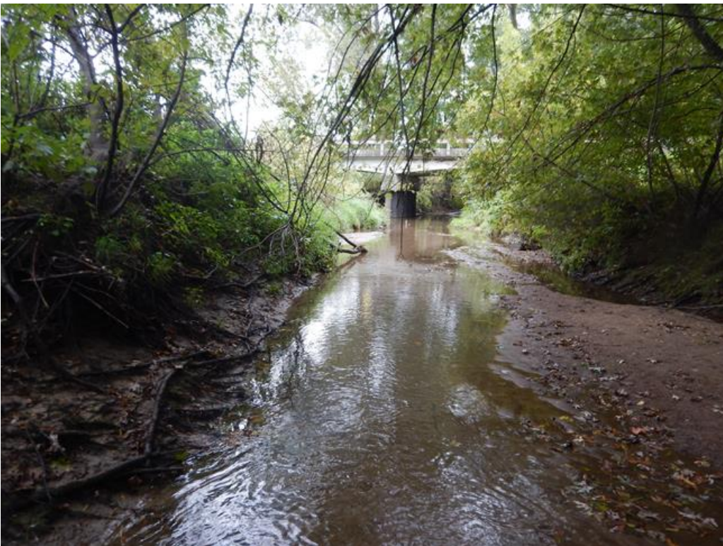
Figure 4. 1230-3 Recreational use assessment upstream looking downstream.