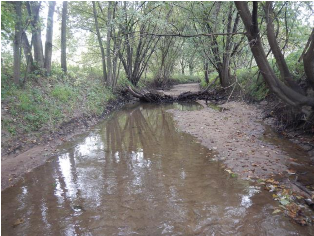
Figure 3. 1230-3 Recreational use assessment upstream looking upstream.