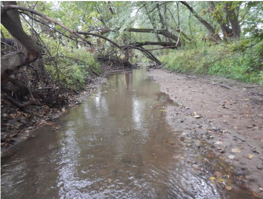
Figure 6. 1230-3 Recreational use assessment downstream looking downstream.