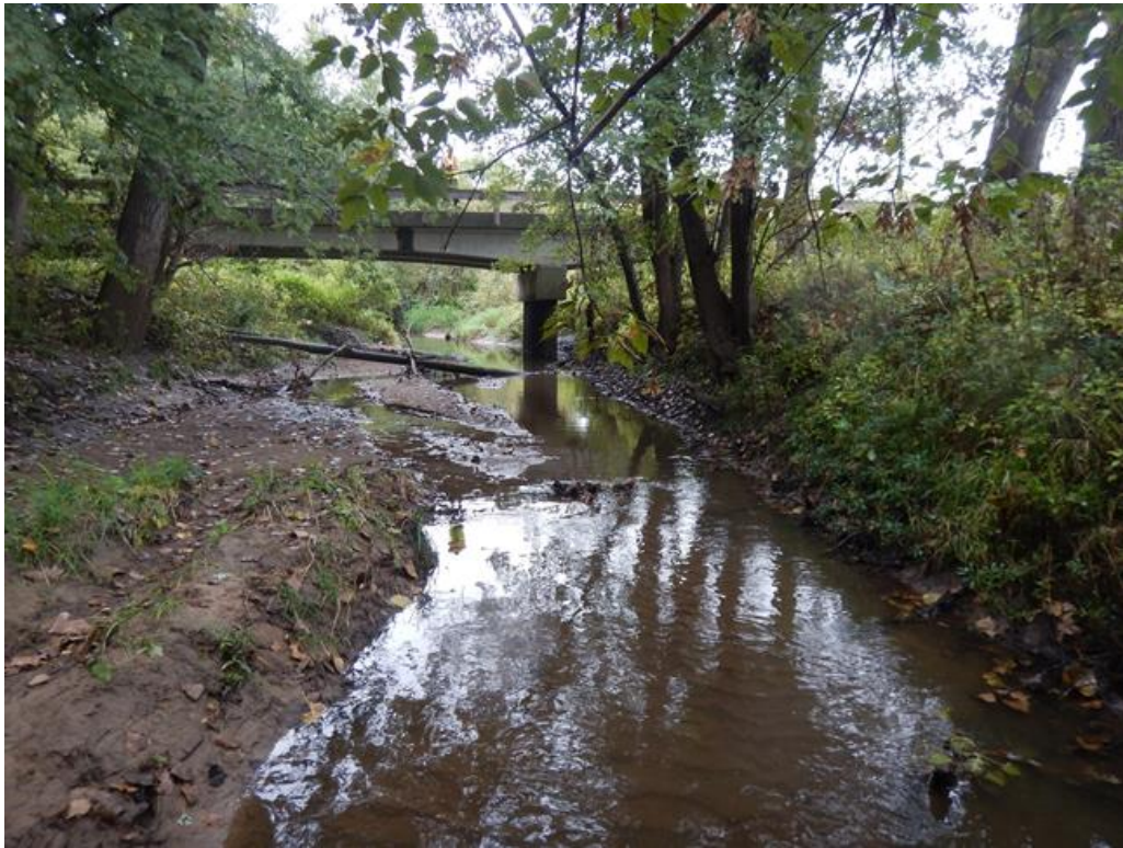
Figure 5. 1230-3 Recreational use assessment downstream looking upstream.