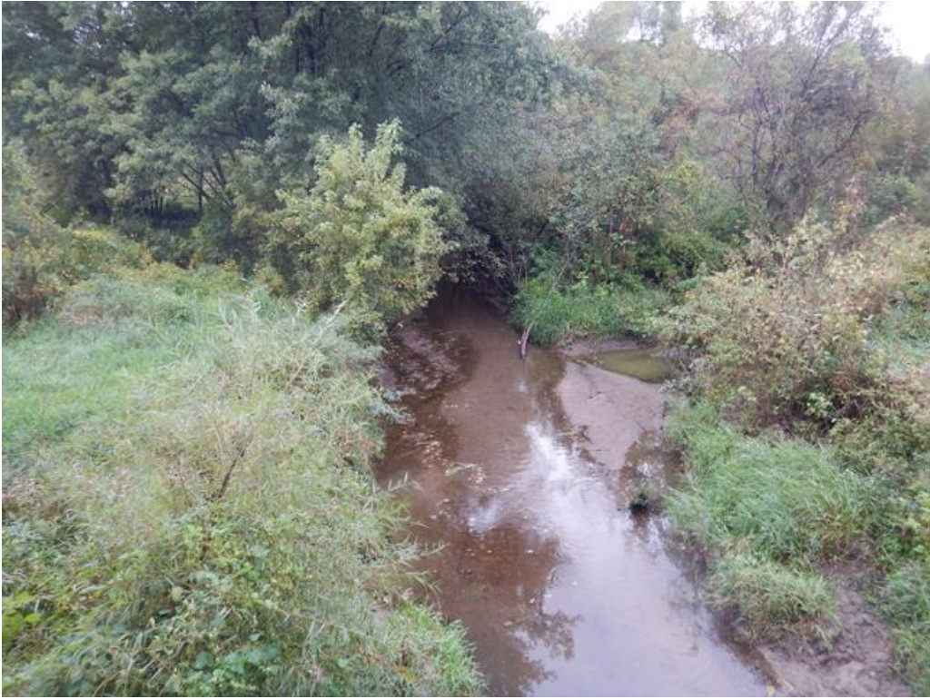
Figure 1. 1230-3 Recreational use assessment midpoint looking upstream.