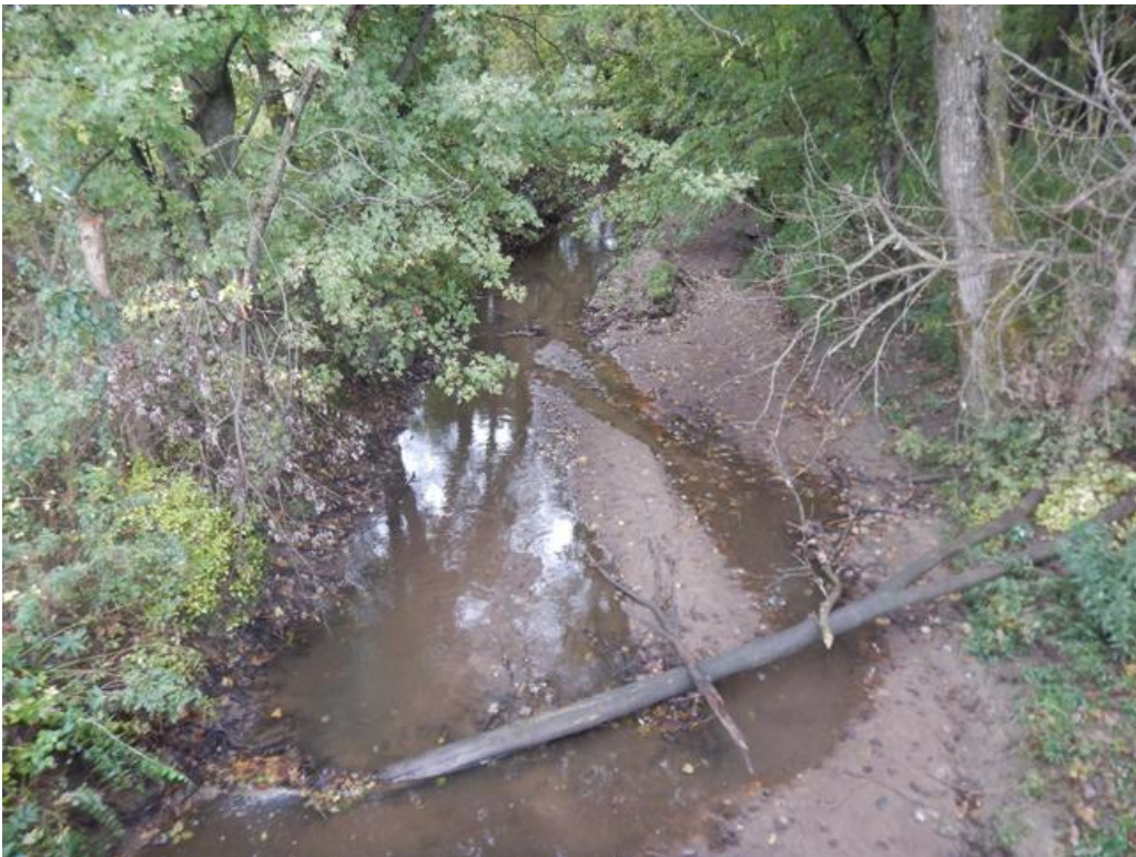
Figure 2. 1230-3 Recreational use assessment midpoint looking downstream.