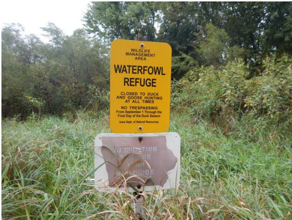
Figure 7. 1230-3 Sign.