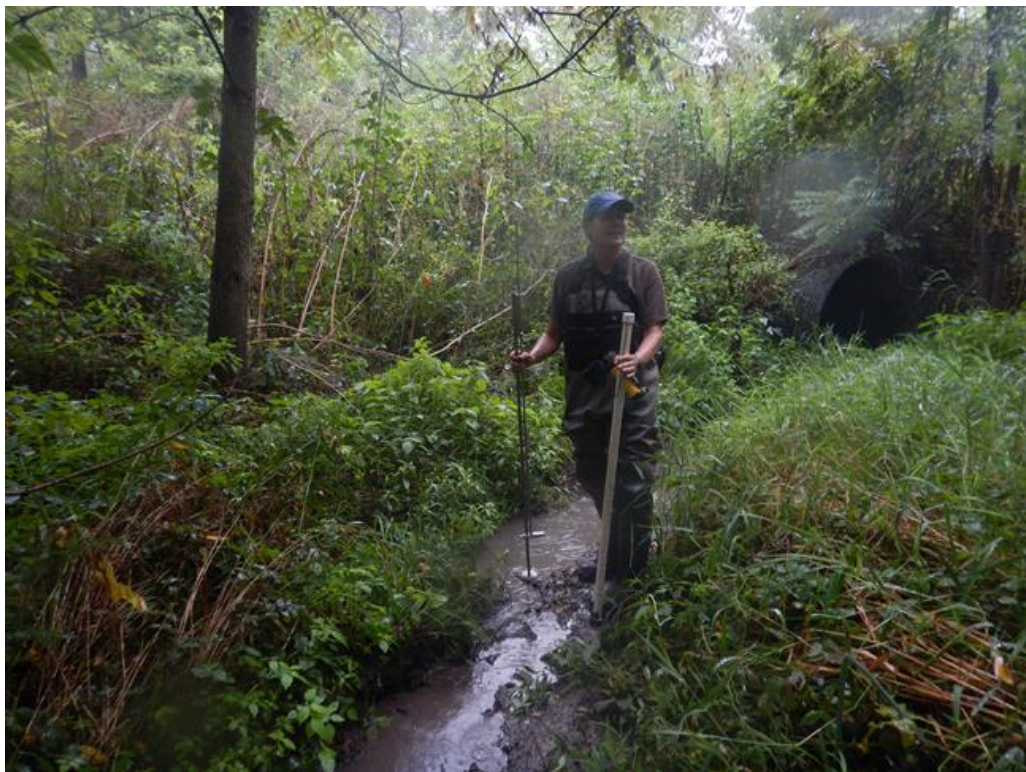
Figure 4. 1248-2 Recreational use assessment downstream looking downstream.