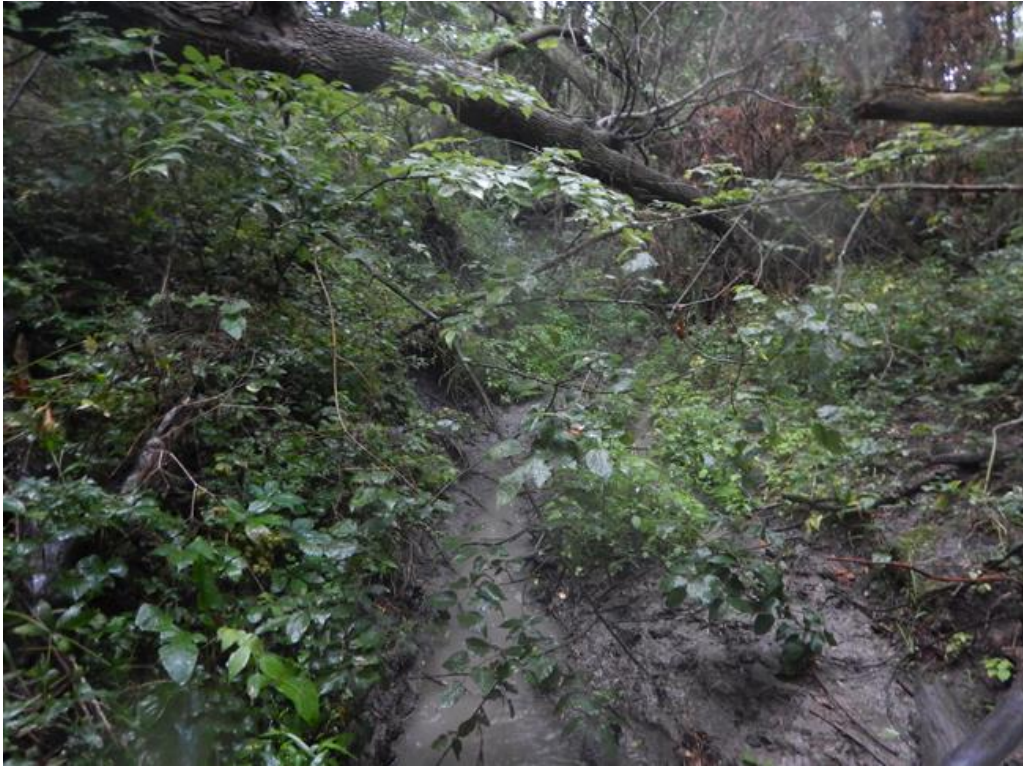
Figure 1. 1248-2 Recreational use assessment upstream looking upstream.