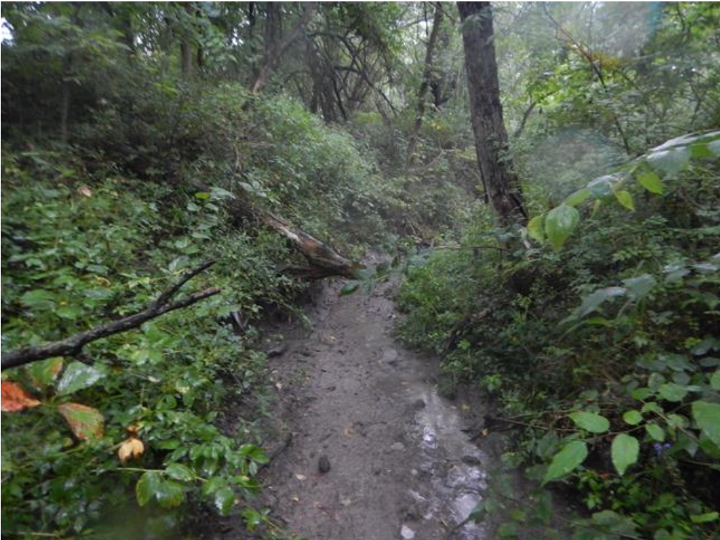
Figure 2. 1248-2 Recreational use assessment upstream looking downstream.