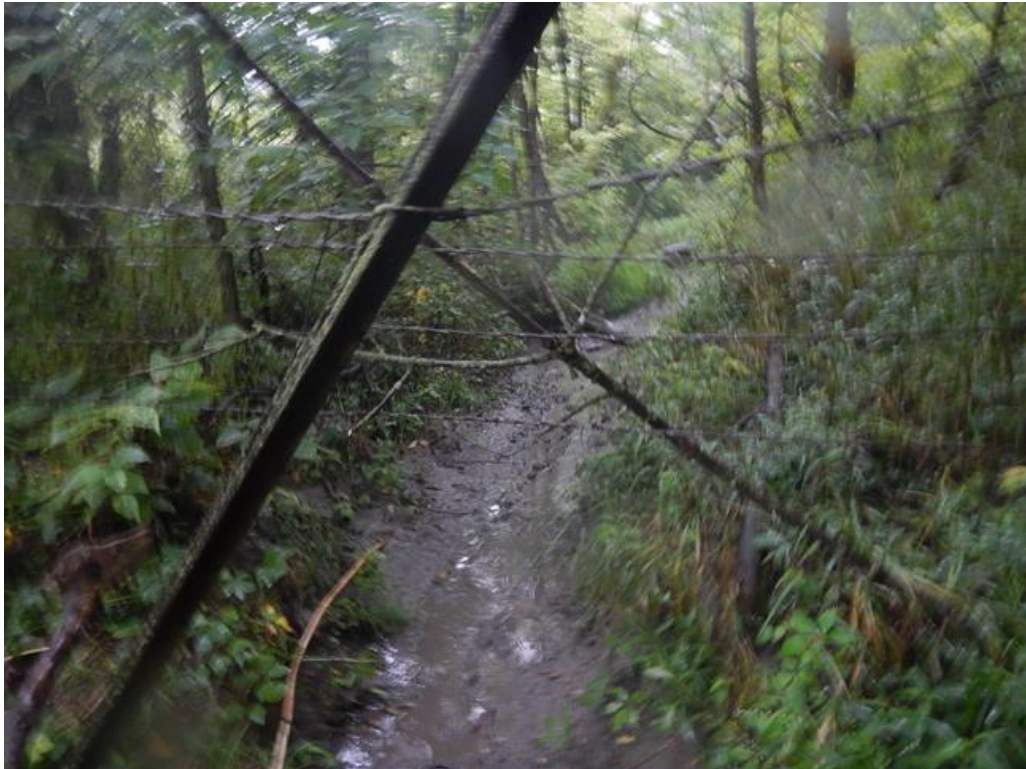
Figure 3. 1248-2 Recreational use assessment downstream looking upstream.