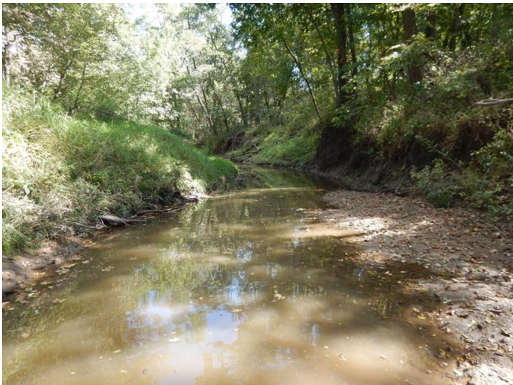
Figure 10. 1253-4 Recreational use assessment downstream looking downstream.