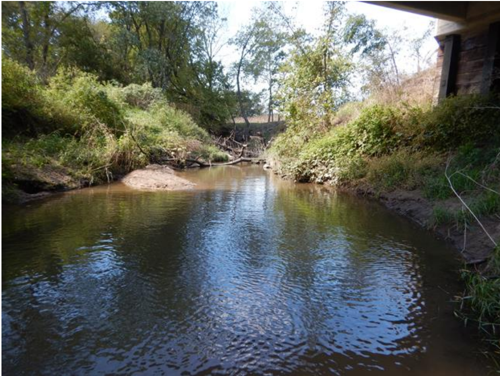
Figure 5. 1253-4 Recreational use assessment midpoint looking upstream.