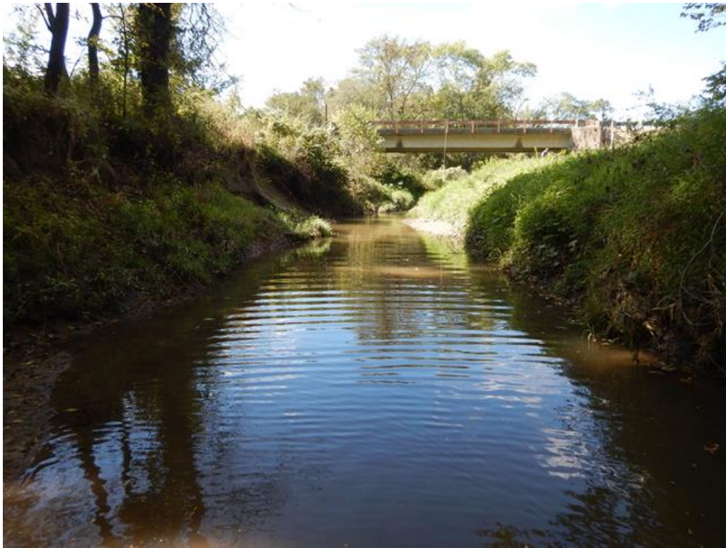
Figure 9. 1253-4 Recreational use assessment downstream looking upstream.