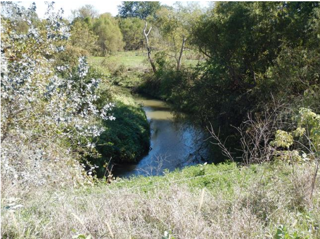
Figure 2. 1253-3 Recreational use assessment midpoint looking downstream.