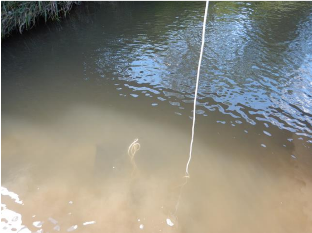
Figure 11. 1253-4 Minnow trap.