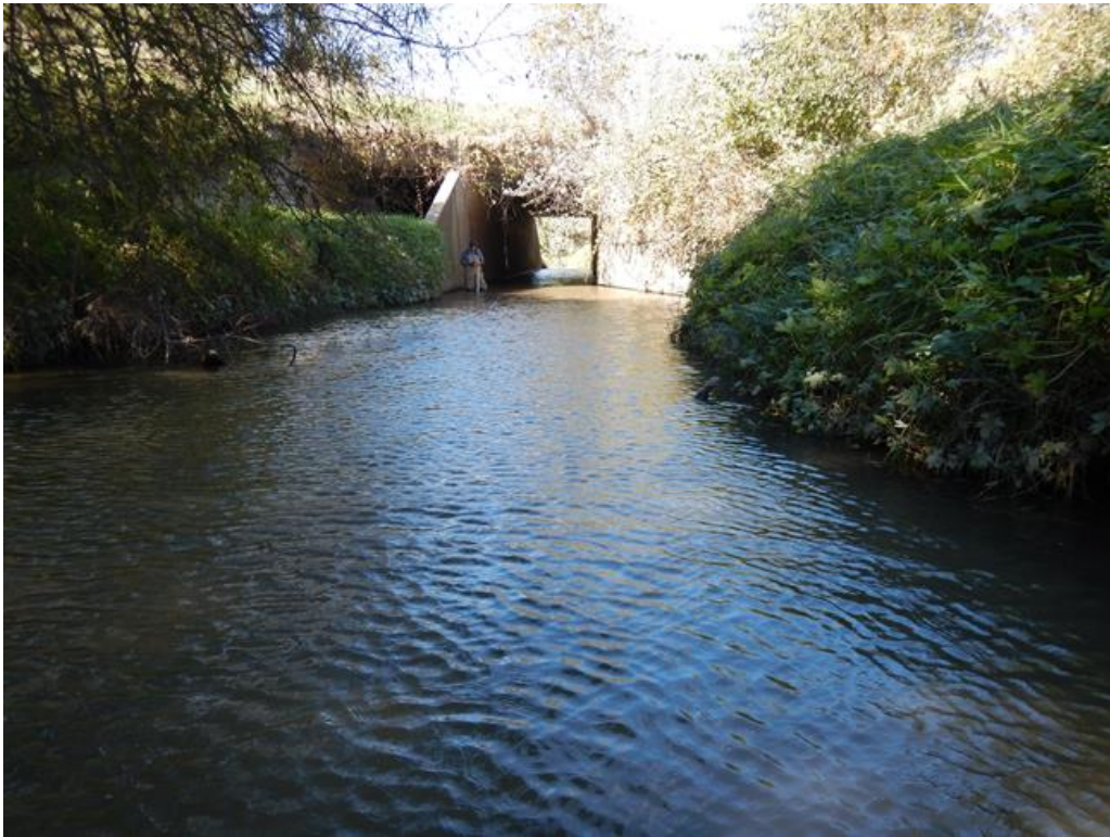
Figure 3. 1253-3 Recreational use assessment downstream looking upstream.