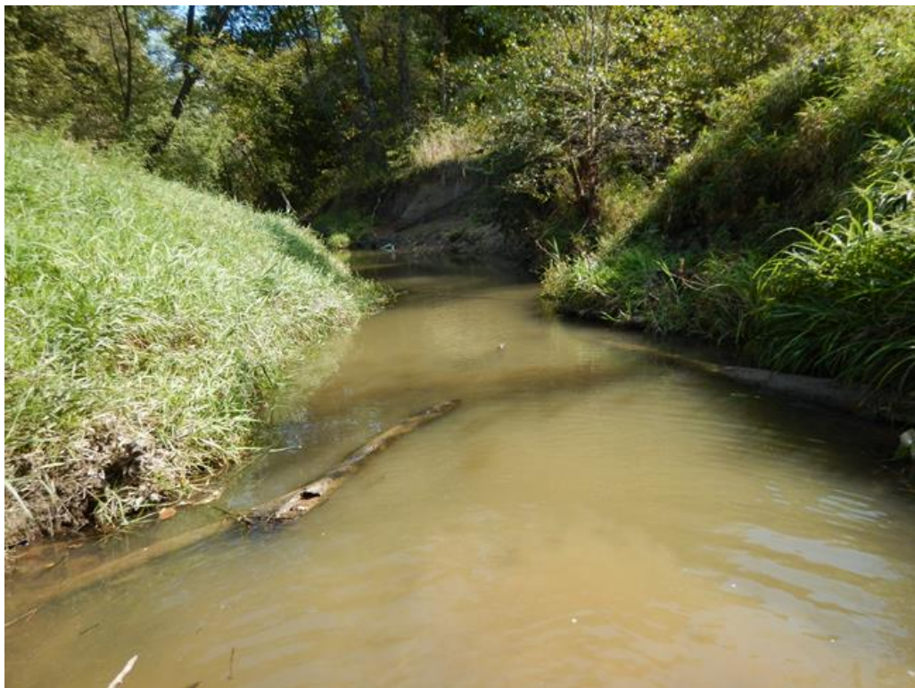
Figure 6. 1253-4 Recreational use assessment midpoint looking downstream.