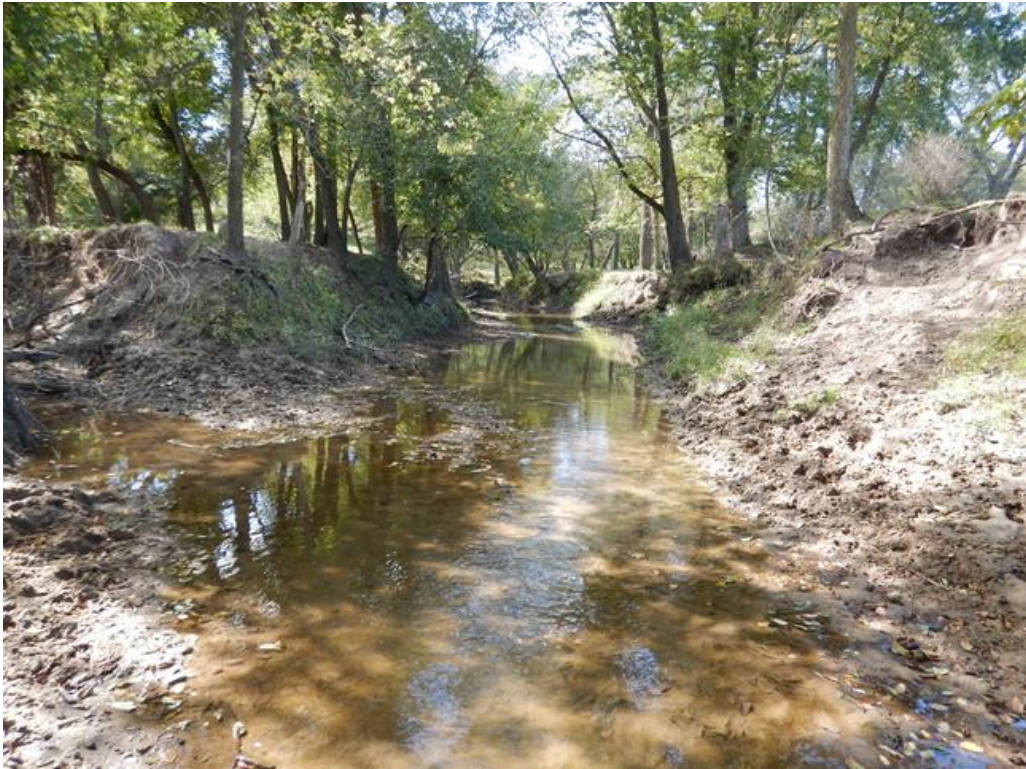
Figure 7. 1253-4 Recreational use assessment upstream looking upstream.