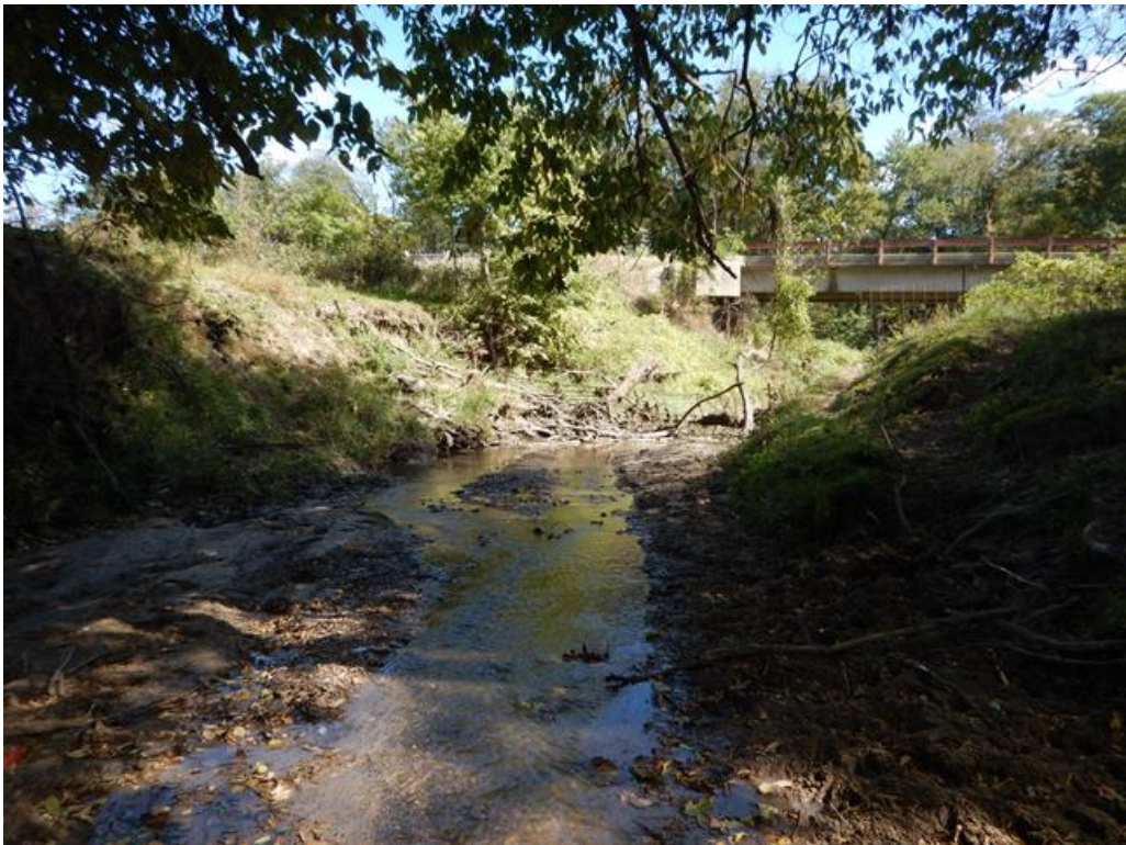
Figure 8. 1253-4 Recreational use assessment upstream looking downstream.