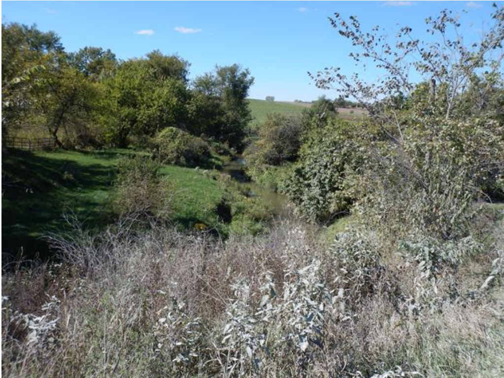
Figure 1. 1253-3 Recreational use assessment midpoint looking upstream.