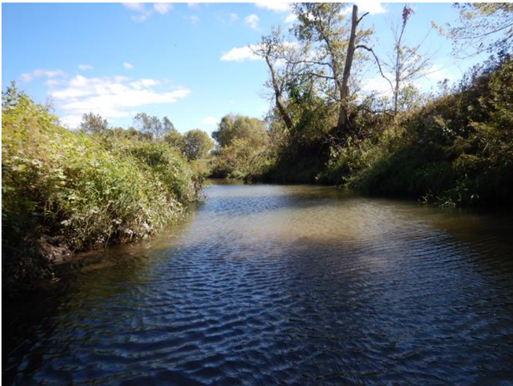
Figure 4. 1253-3 Recreational use assessment downstream looking downstream.