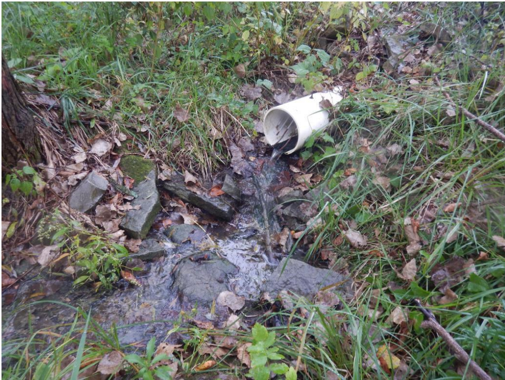
Figure 5. 1230-1 Outfall.