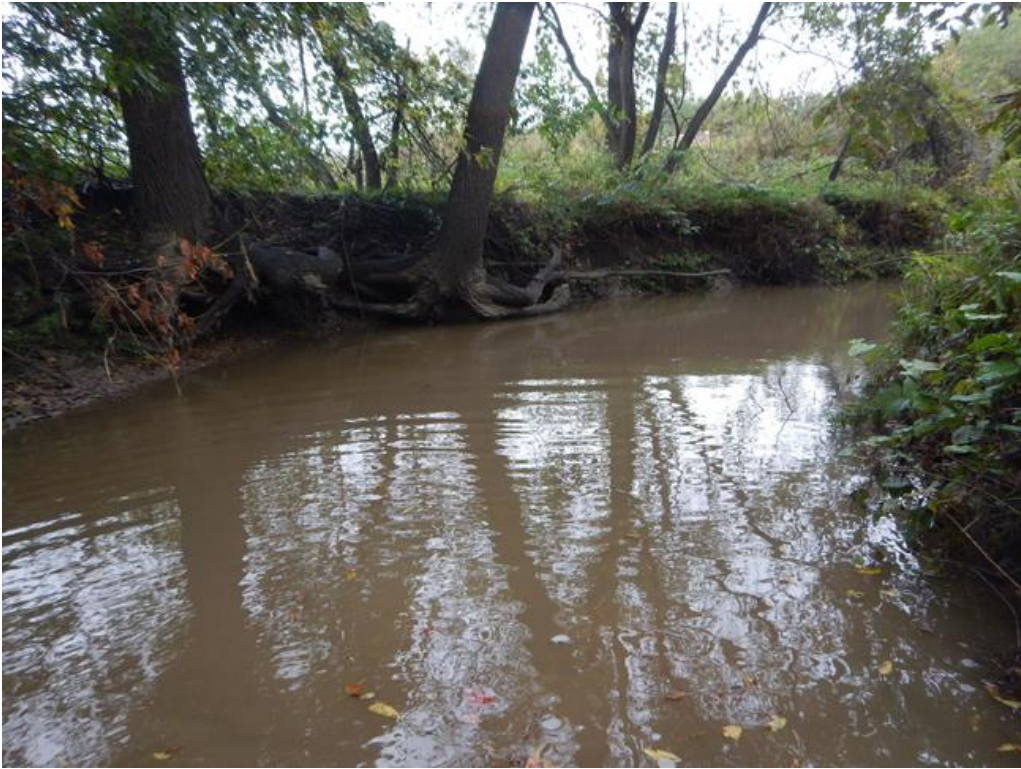
Figure 9. 1230-2 Recreational use assessment upstream looking downstream.