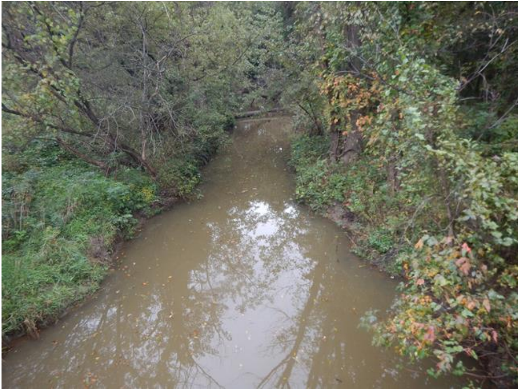
Figure 7. 1230-2 Recreational use assessment midpoint looking downstream.