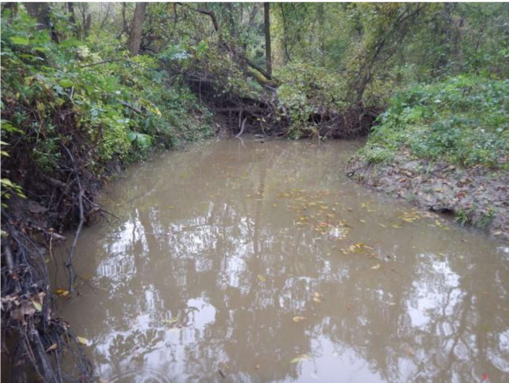
Figure 8. 1230-2 Recreational use assessment upstream looking upstream.