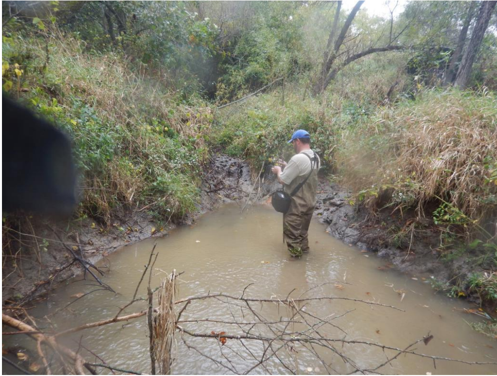
Figure 1. 1230-1 Recreational use assessment upstream looking upstream.