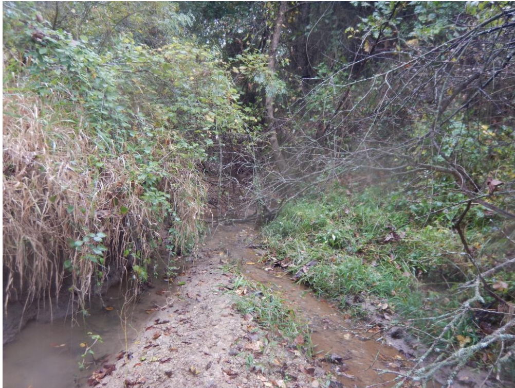
Figure 2. 1230-1 Recreational use assessment upstream looking downstream.