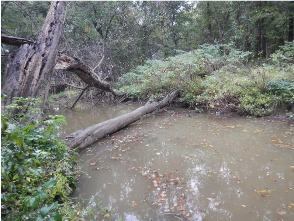
Figure 11. 1230-2 Recreational use assessment downstream looking downstream.