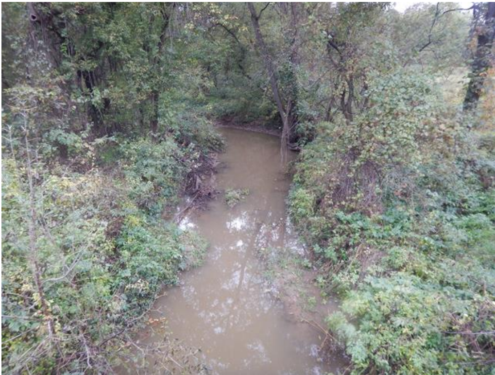
Figure 6. 1230-2 Recreational use assessment midpoint looking upstream.