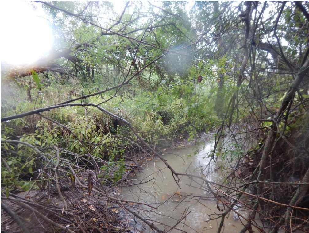
Figure 4. 1230-1 Recreational use assessment downstream looking downstream.