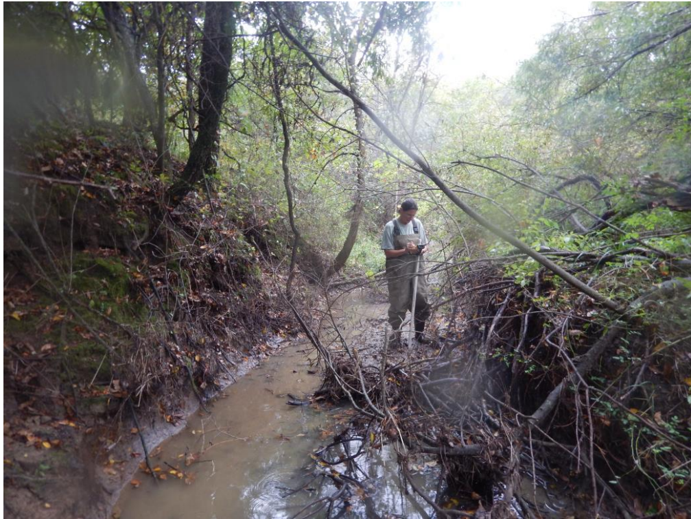
Figure 3. 1230-1 Recreational use assessment downstream looking upstream.