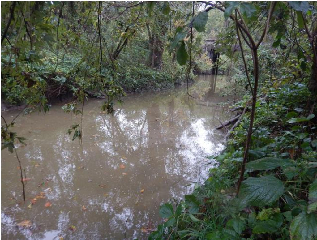
Figure 10. 1230-2 Recreational use assessment downstream looking upstream.