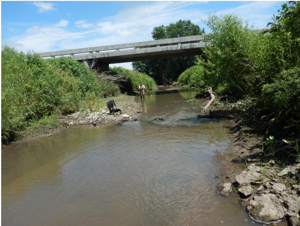
Figure 20. 1236-6 Recreational use assessment upstream looking downstream.