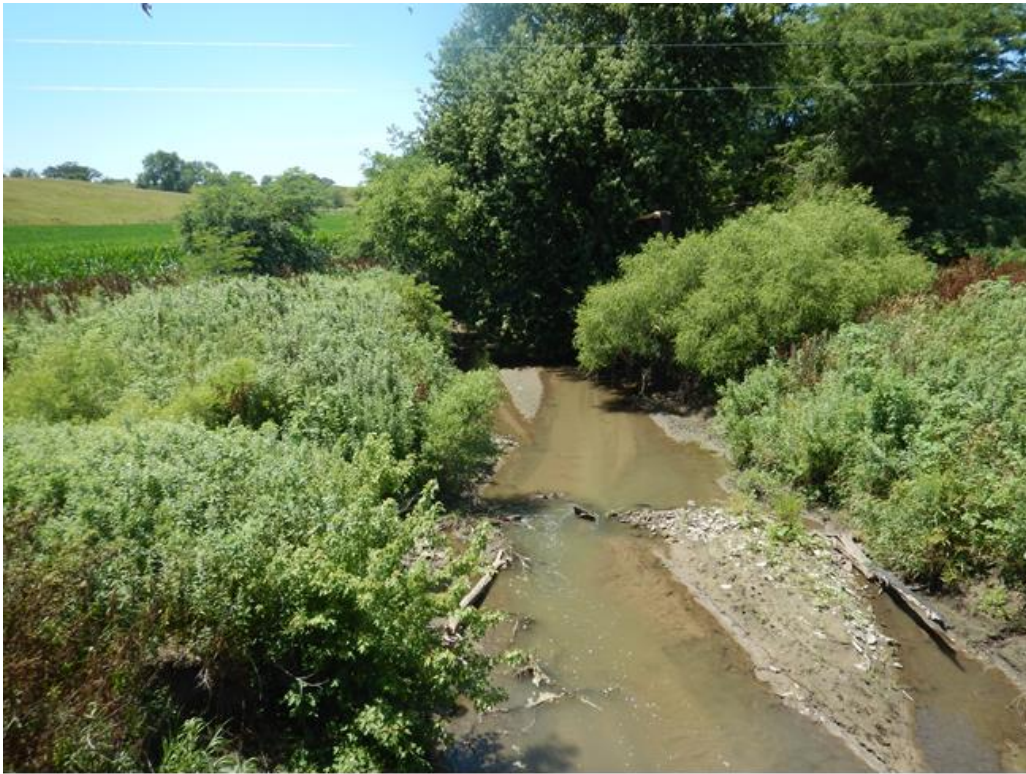
Figure 17. 1236-6 Recreational use assessment midpoint looking upstream.