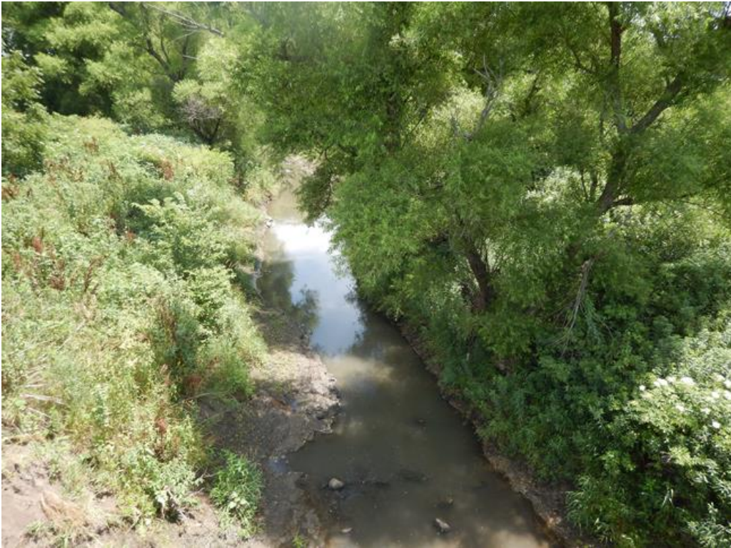
Figure 12. 1236-5 Recreational use assessment midpoint looking downstream.