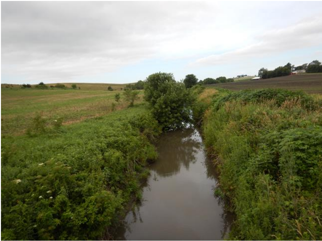
Figure 1. 1236-4 Recreational use assessment midpoint looking upstream.