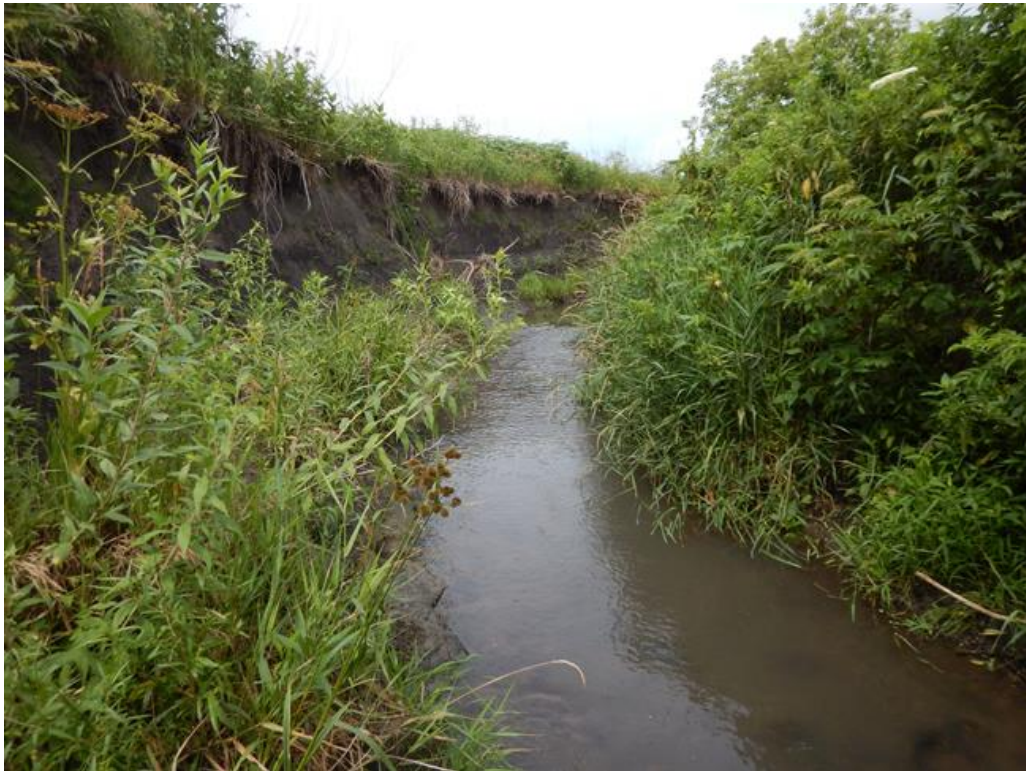
Figure 9. 1236-4 Start of aquatic assessment looking upstream.