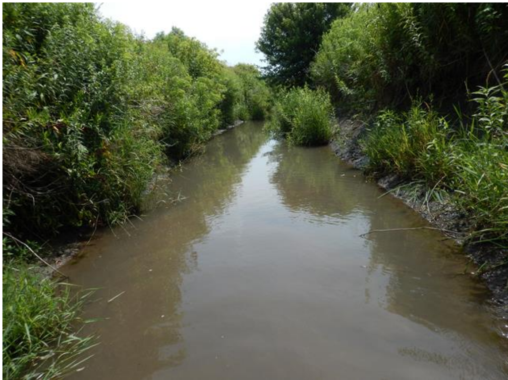
Figure 6. 1236-4 Recreational use assessment downstream looking downstream.