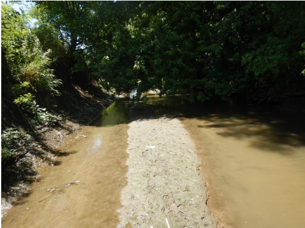
Figure 19. 1236-6 Recreational use assessment upstream looking upstream.