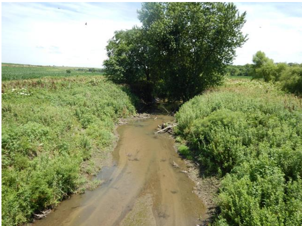
Figure 18. 1236-6 Recreational use assessment midpoint looking downstream.