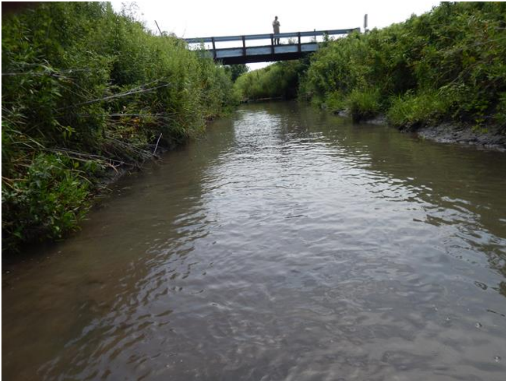
Figure 3. 1236-4 Recreational use assessment upstream looking upstream.