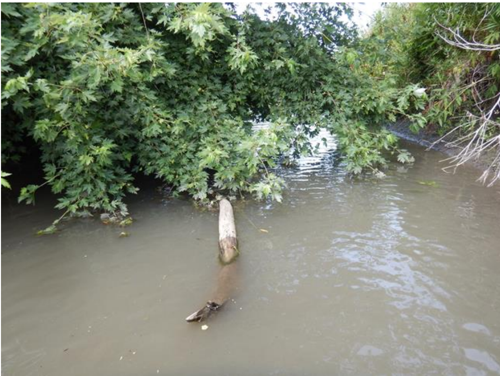
Figure 4. 1236-4 Recreational use assessment upstream looking downstream.