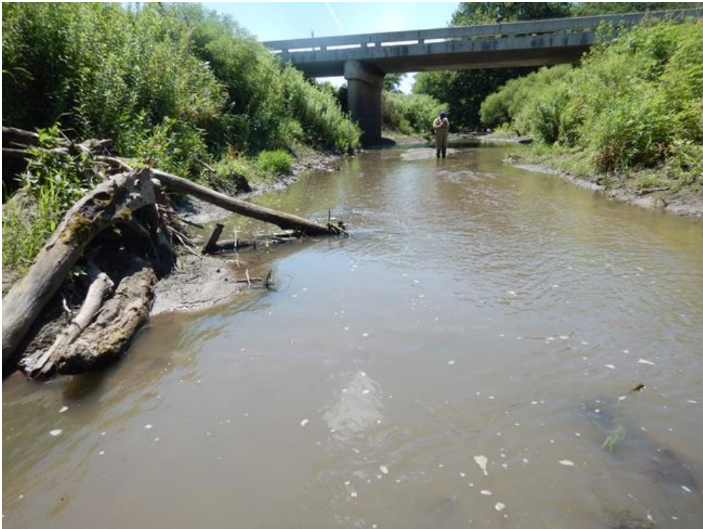
Figure 21. 1236-6 Recreational use assessment downstream looking upstream.