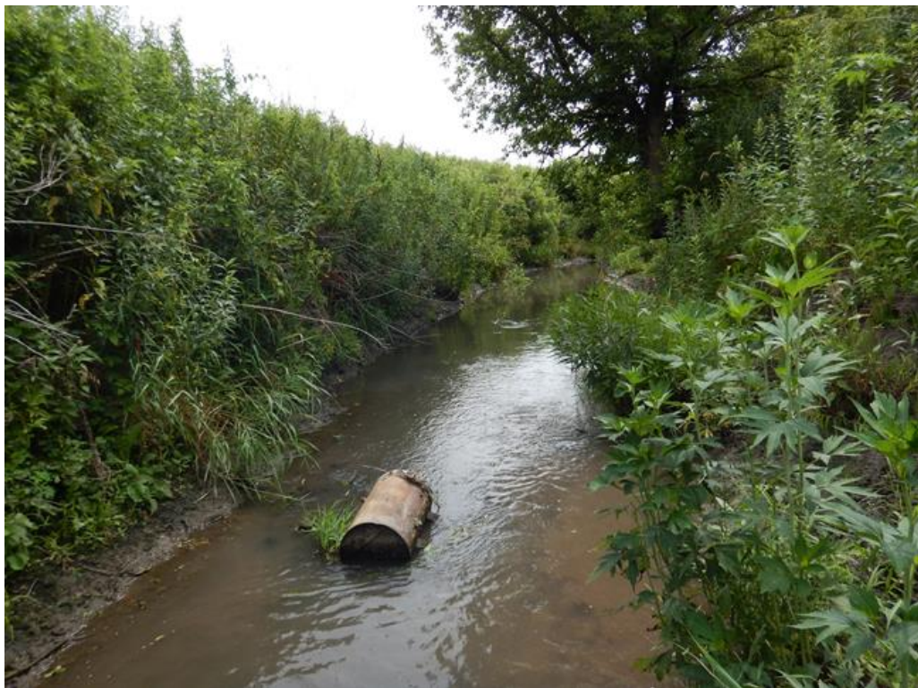
Figure 10. 1236-4 Start of aquatic assessment looking downstream.