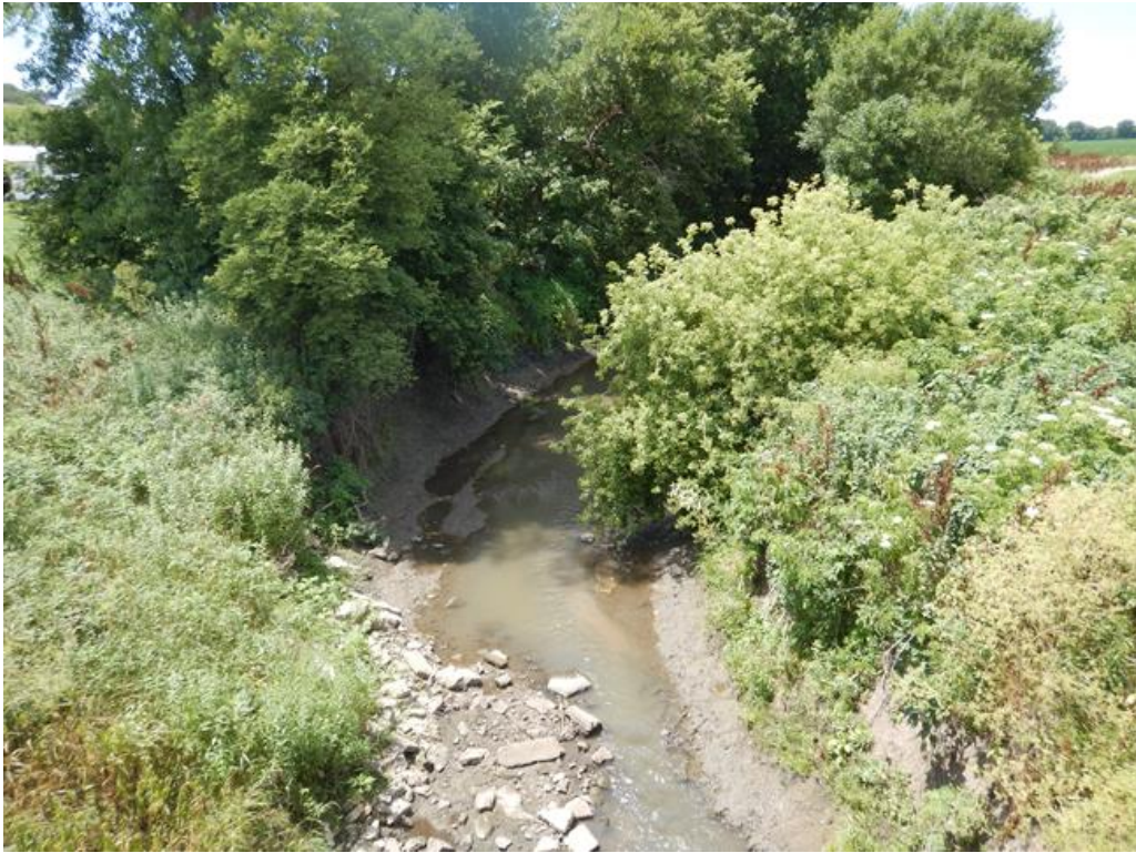
Figure 11. 1236-5 Recreational use assessment midpoint looking upstream.