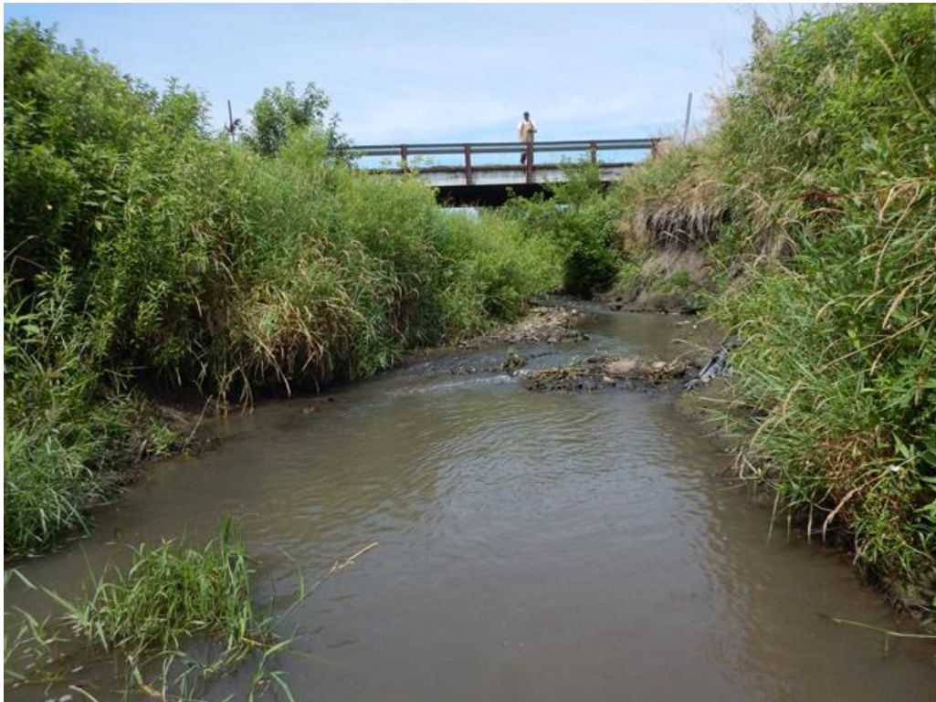
Figure 5. 1236-4 Recreational use assessment downstream looking upstream.