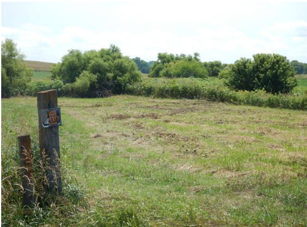
Figure 8. 1236-4 No trespassing sign.