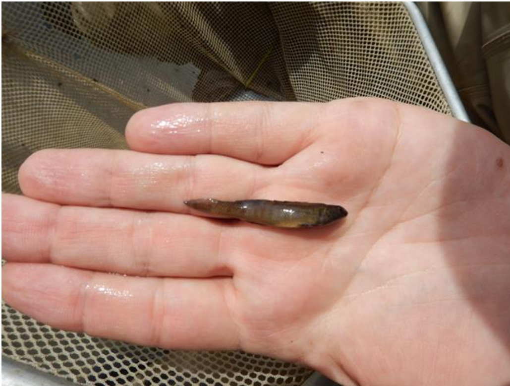
Figure 7. 1236-4 Fantail darter.