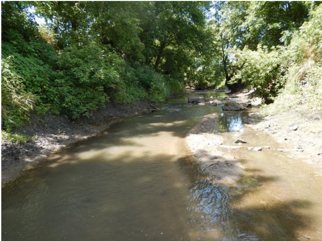
Figure 13. 1236-5 Recreational use assessment upstream looking upstream.