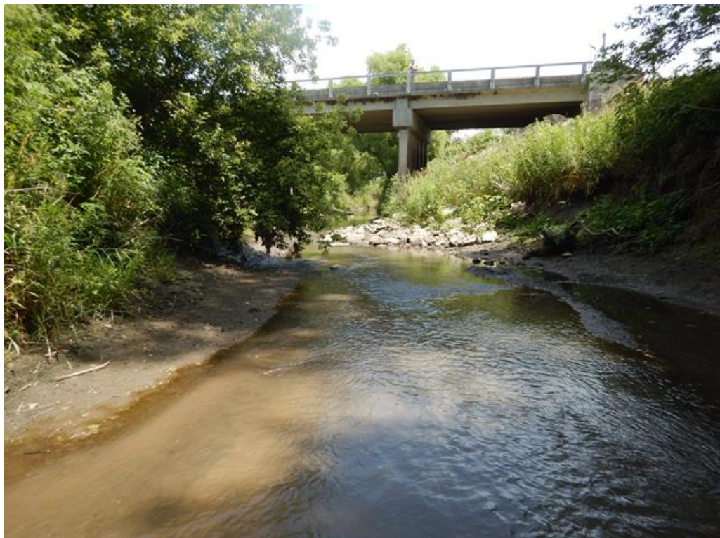
Figure 14. 1236-5 Recreational use assessment upstream looking downstream.