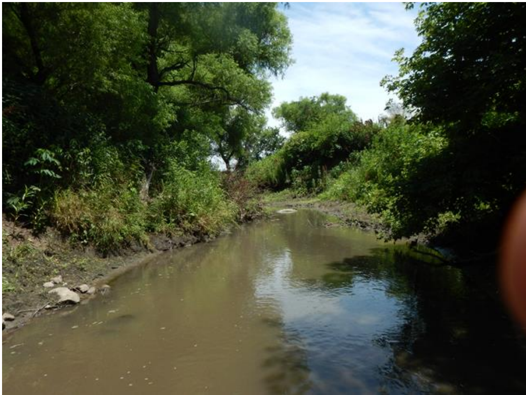
Figure 16. 1236-5 Recreational use assessment downstream looking downstream.