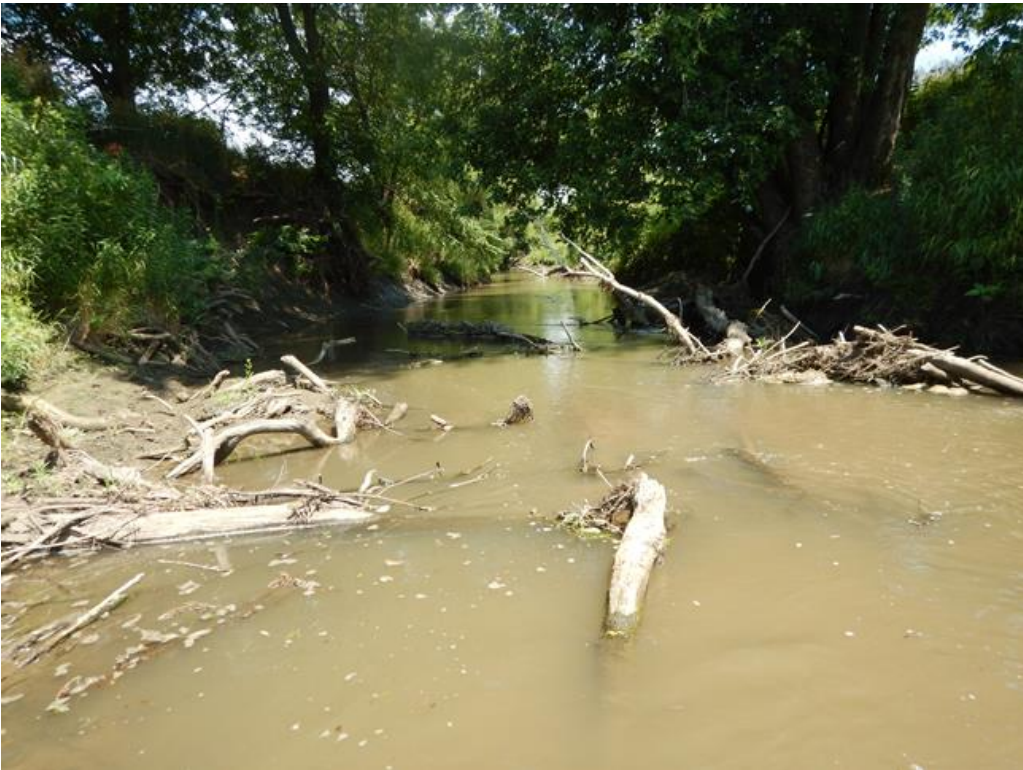
Figure 22. 1236-6 Recreational use assessment downstream looking downstream.