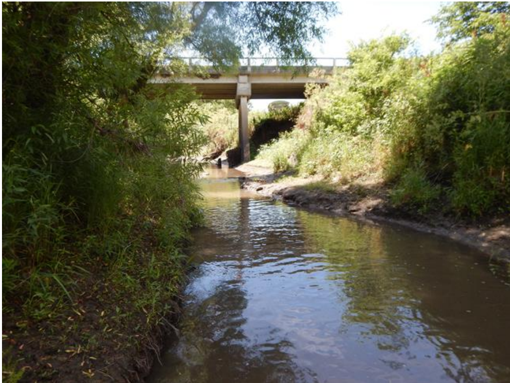
Figure 15. 1236-5 Recreational use assessment downstream looking upstream.