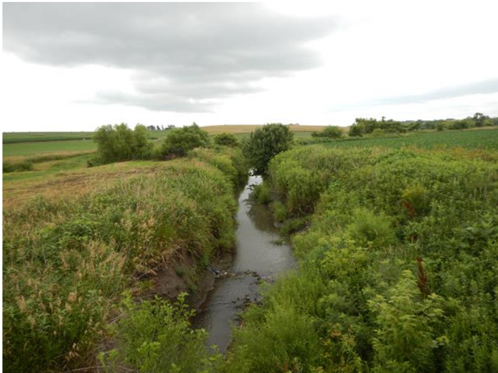
Figure 2. 1236-4 Recreational use assessment midpoint looking downstream.