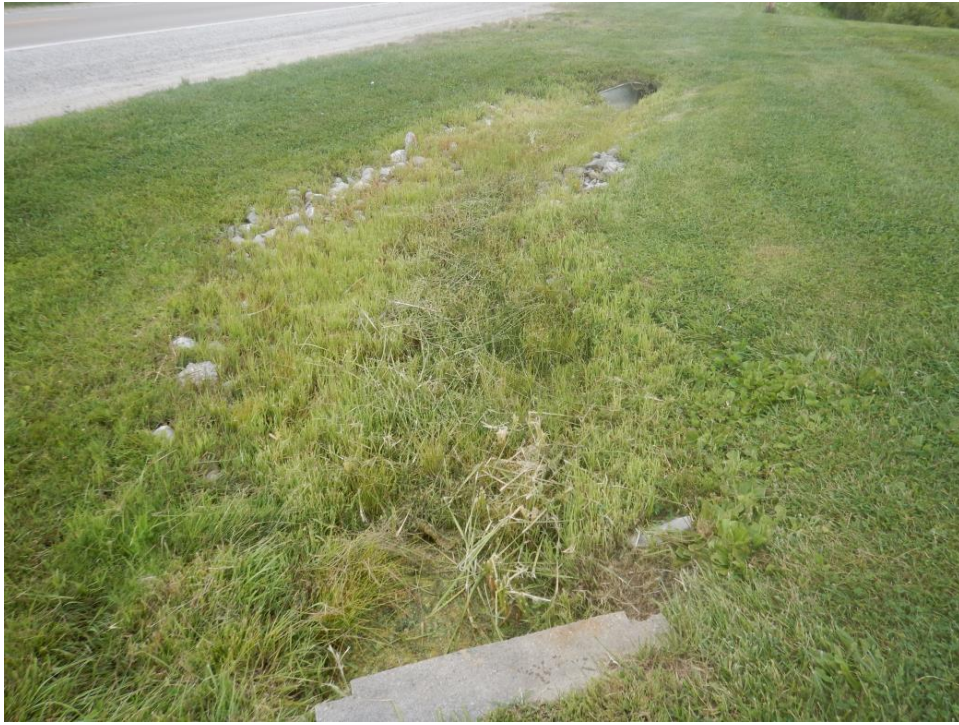
Figure 3. 1277-1 Downstream of outfall.