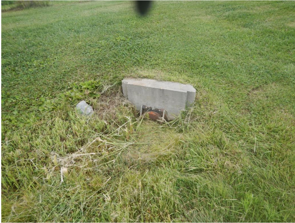
Figure 1. 1277-1 Outfall.