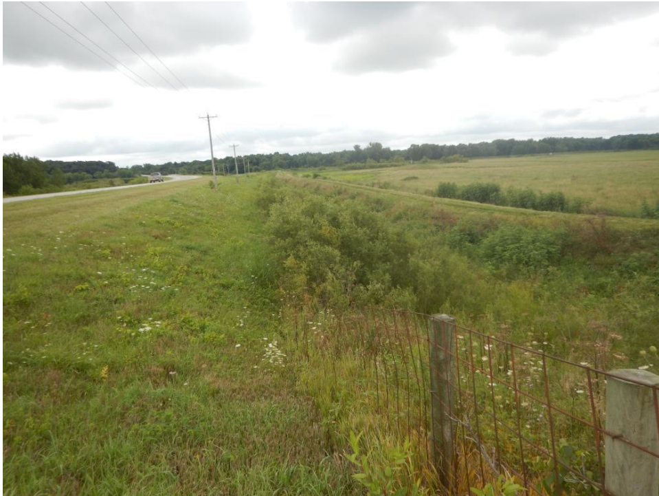
Figure 2. 1277-1 Receiving ditch flowing south.