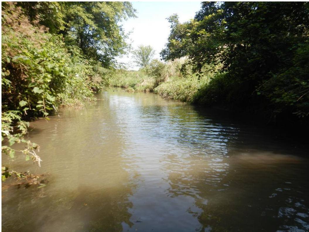
Figure 4. 1286-1 Recreational use assessment downstream looking downstream.