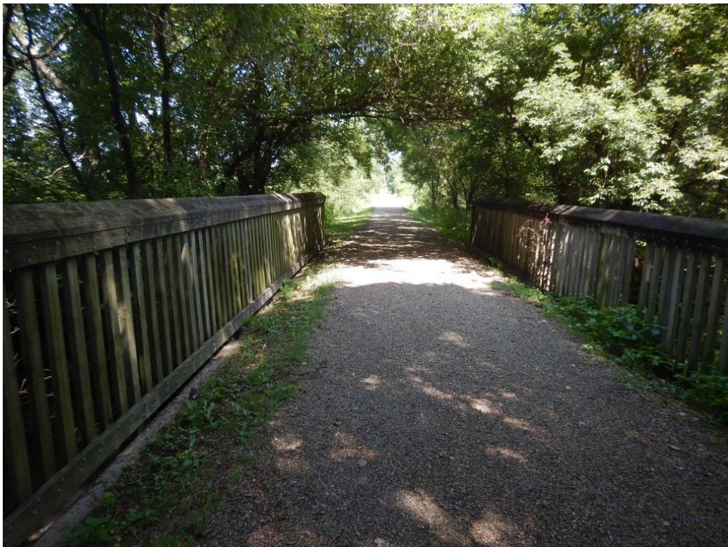
Figure 10. 1286-1 Hoover Nature Trail bridge crossing.