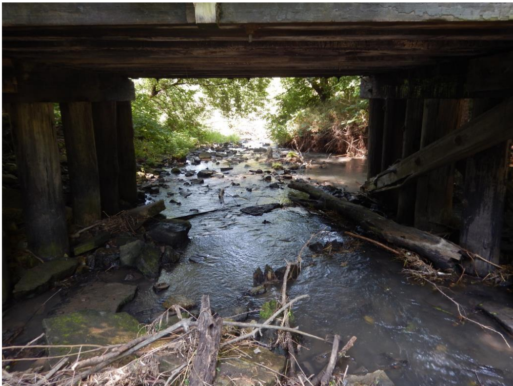
Figure 12. 1286-1 Start of aquatic assessment looking upstream.