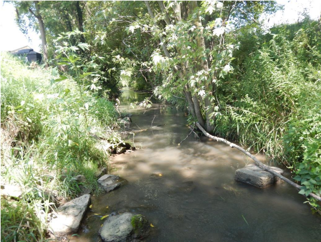
Figure 17. 1286-2 Recreational use assessment upstream looking downstream.