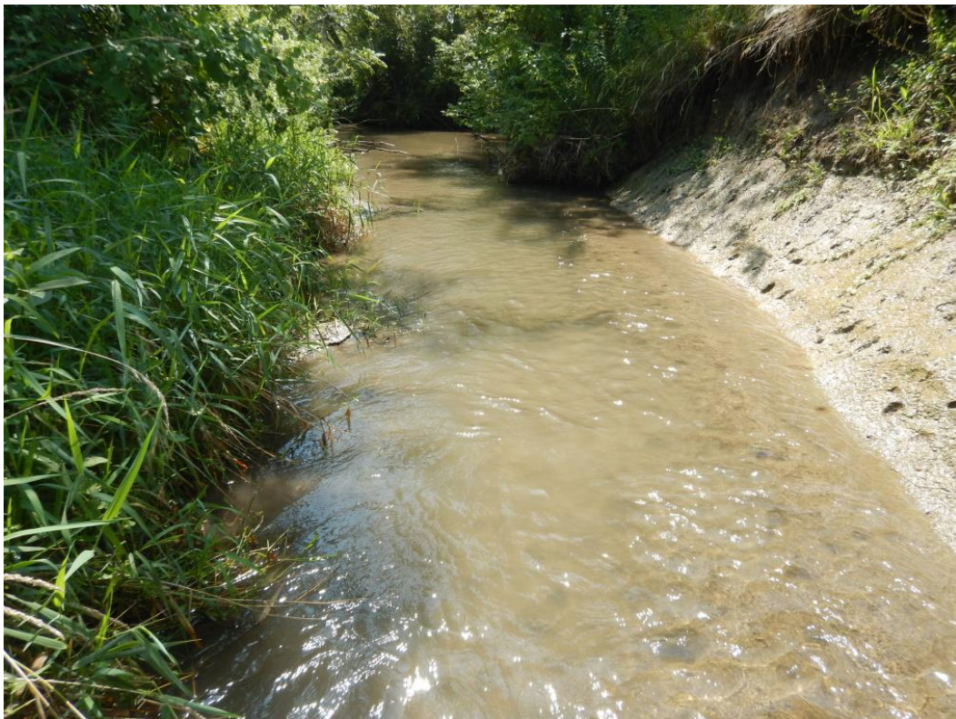
Figure 14. 1286-1 End of aquatic assessment looking upstream.