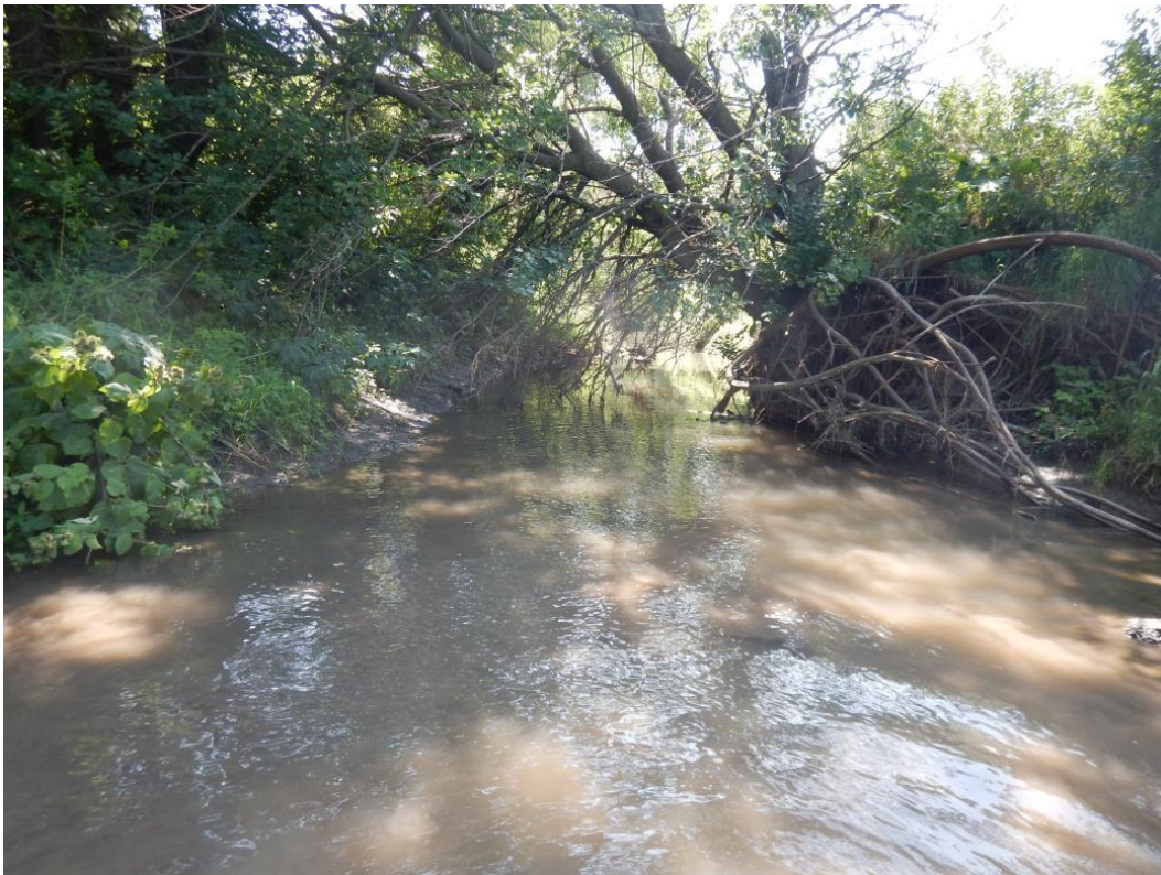
Figure 2. 1286-1 Recreational use assessment upstream looking downstream.