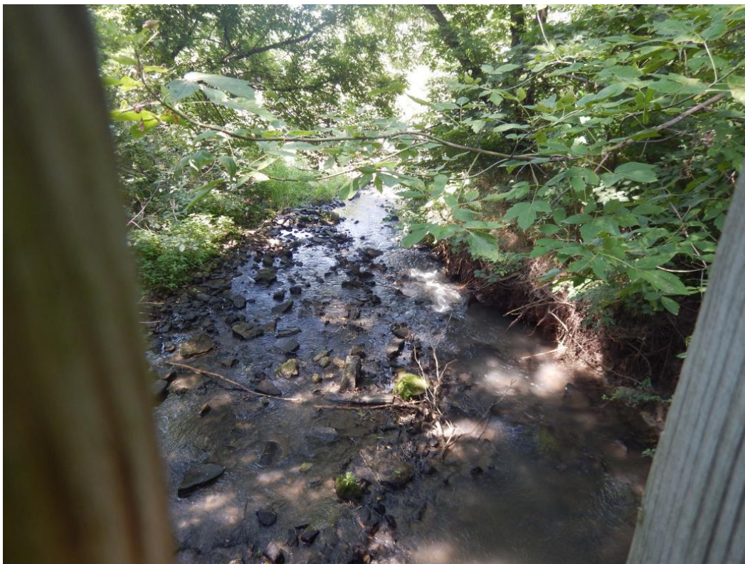
Figure 5. 1286-1 Recreational use assessment midpoint looking upstream.