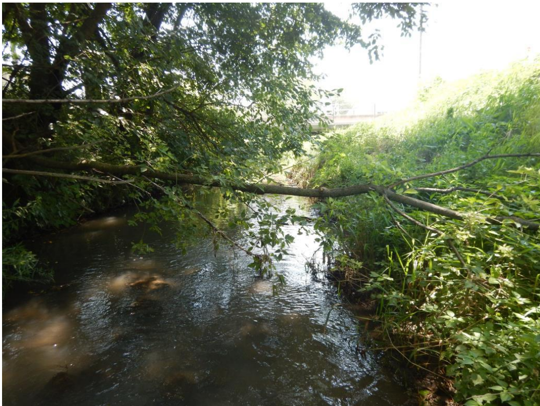
Figure 16. 1286-2 Recreational use assessment upstream looking upstream.