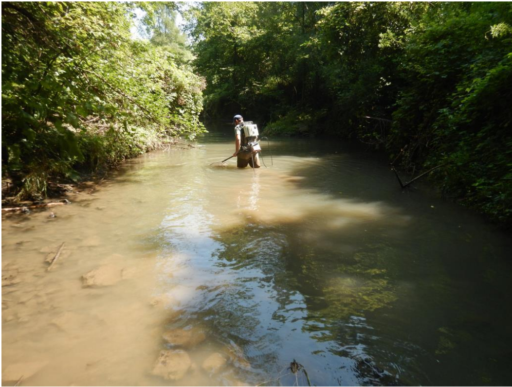
Figure 13. 1286-1 Start of aquatic assessment looking downstream.