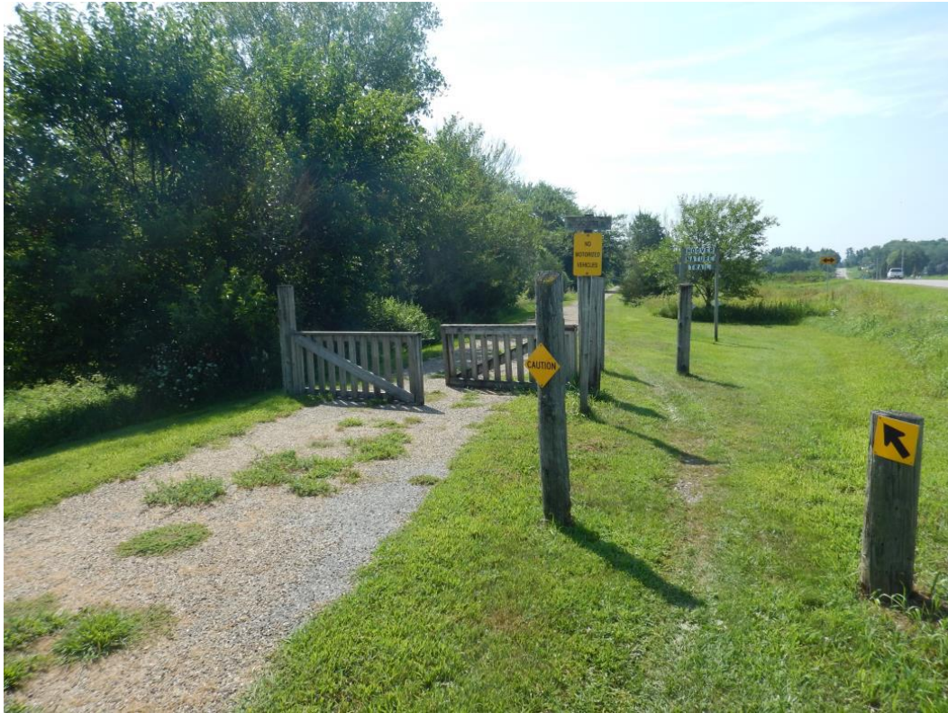
Figure 7. 1286-1 Hoover Nature Trail sign adjacent to the stream.