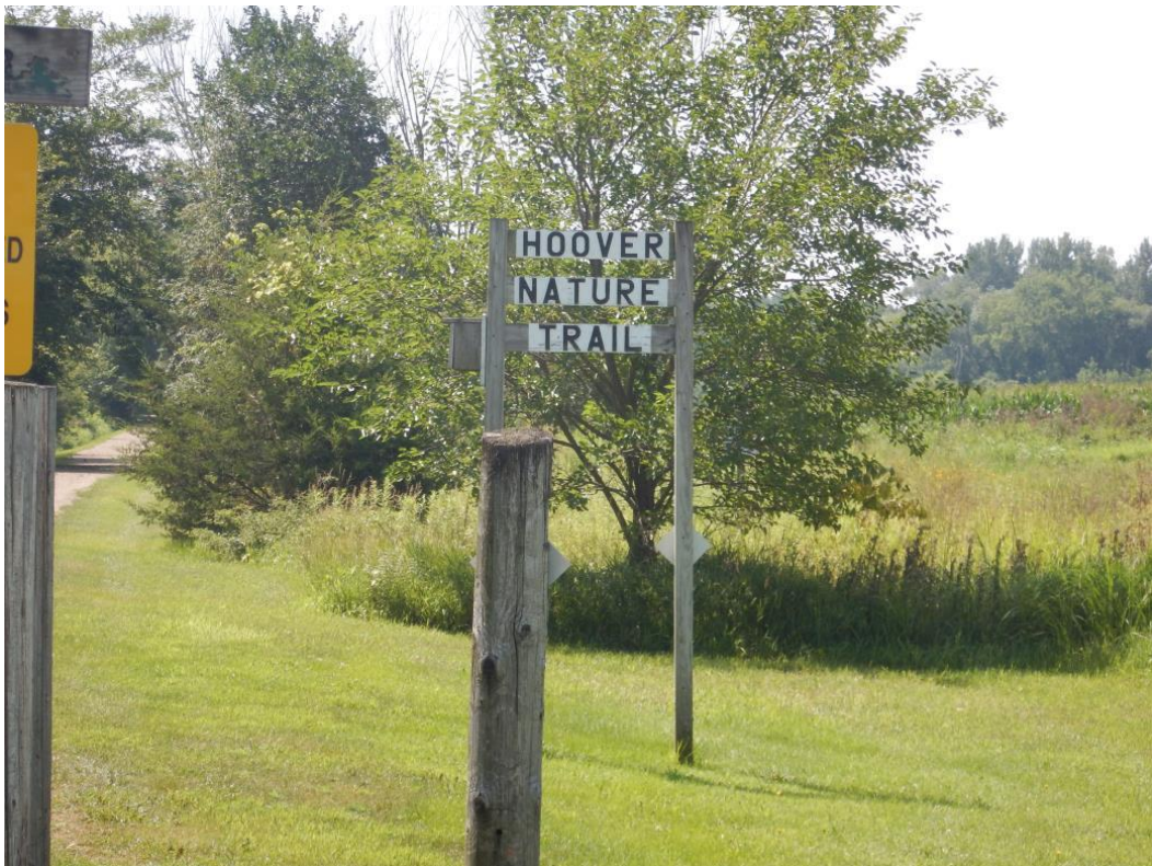
Figure 8. 1286-1 Hoover Nature Trail sign adjacent to the stream.