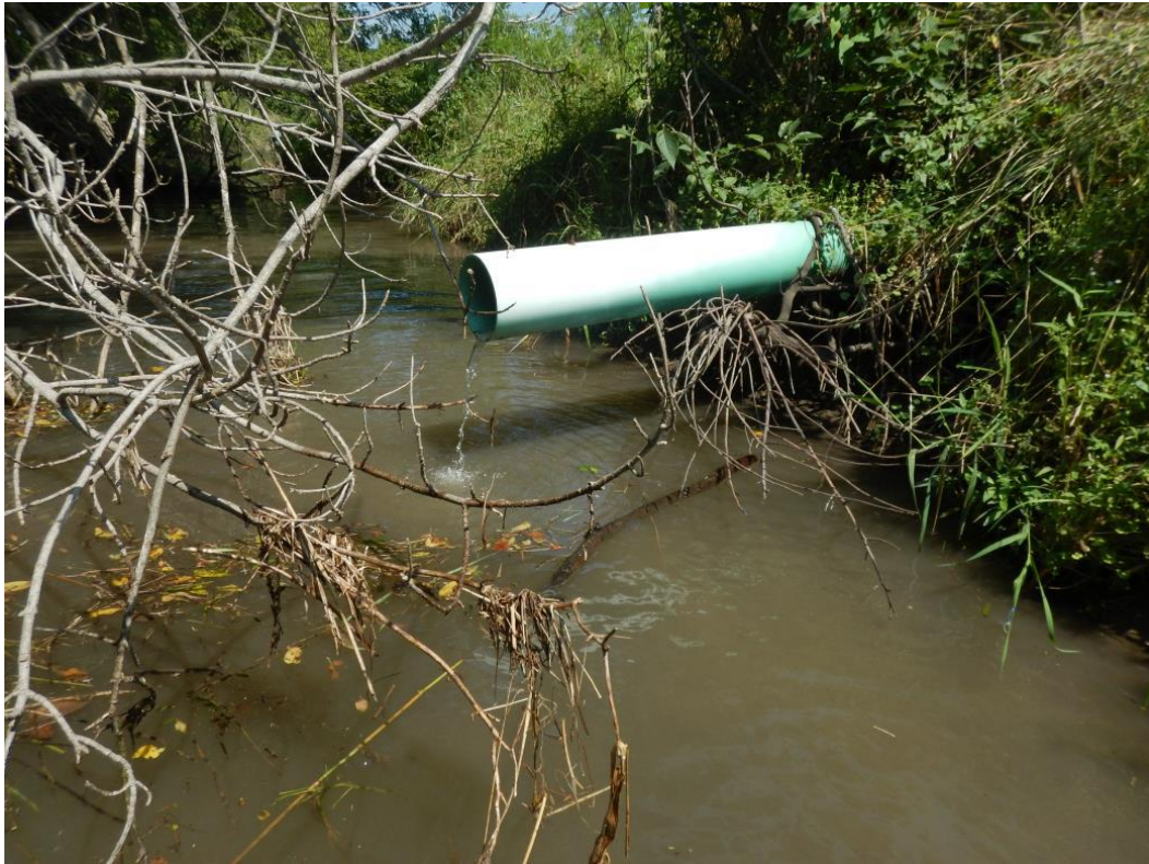
Figure 11. 1286-1 Outfall.