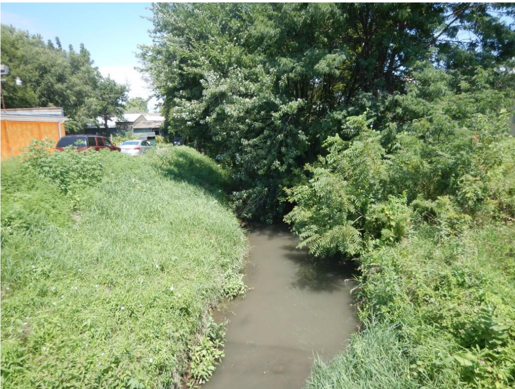
Figure 18. 1286-2 Recreational use assessment midpoint looking upstream.