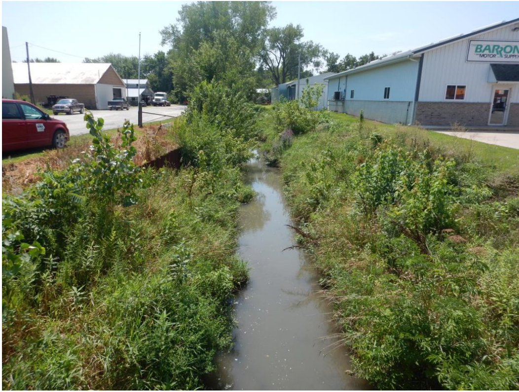
Figure 19. 1286-2 Recreational use assessment midpoint looking downstream.