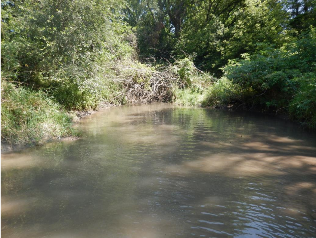
Figure 1. 1286-1 Recreational use assessment upstream looking upstream.