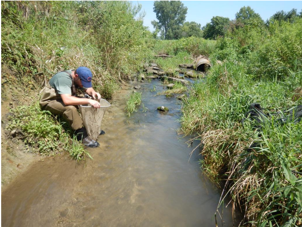
Figure 15. 1286-1 End of aquatic assessment looking downstream.