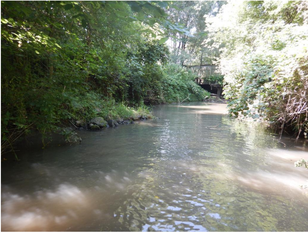
Figure 3. 1286-1 Recreational use assessment downstream looking downstream.