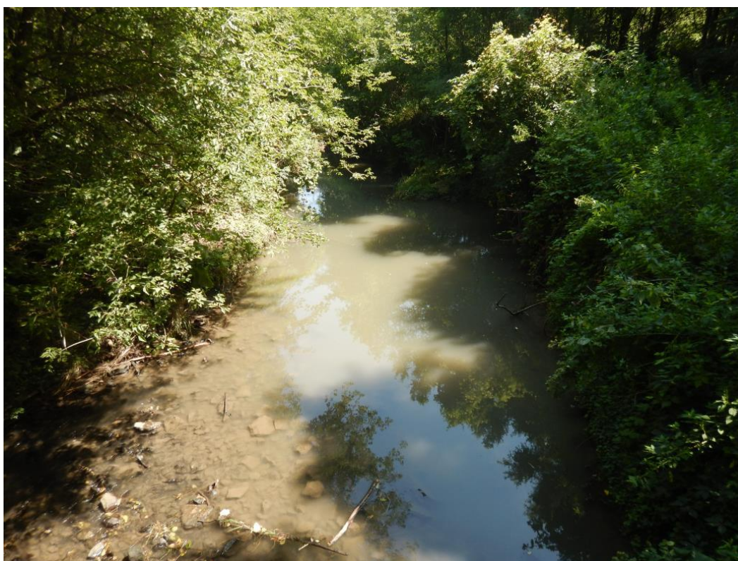
Figure 6. 1286-1 Recreational use assessment midpoint looking downstream.