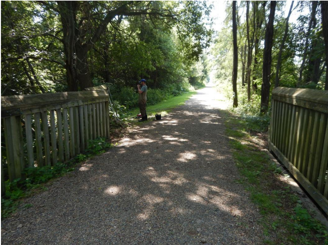
Figure 9. 1286-1 Hoover Nature Trail bridge crossing.