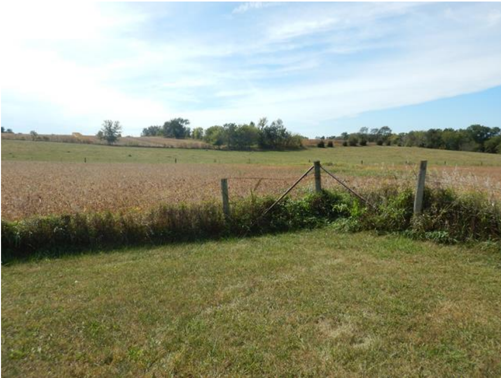
Figure 2. 1281-1 View to south from lagoons.