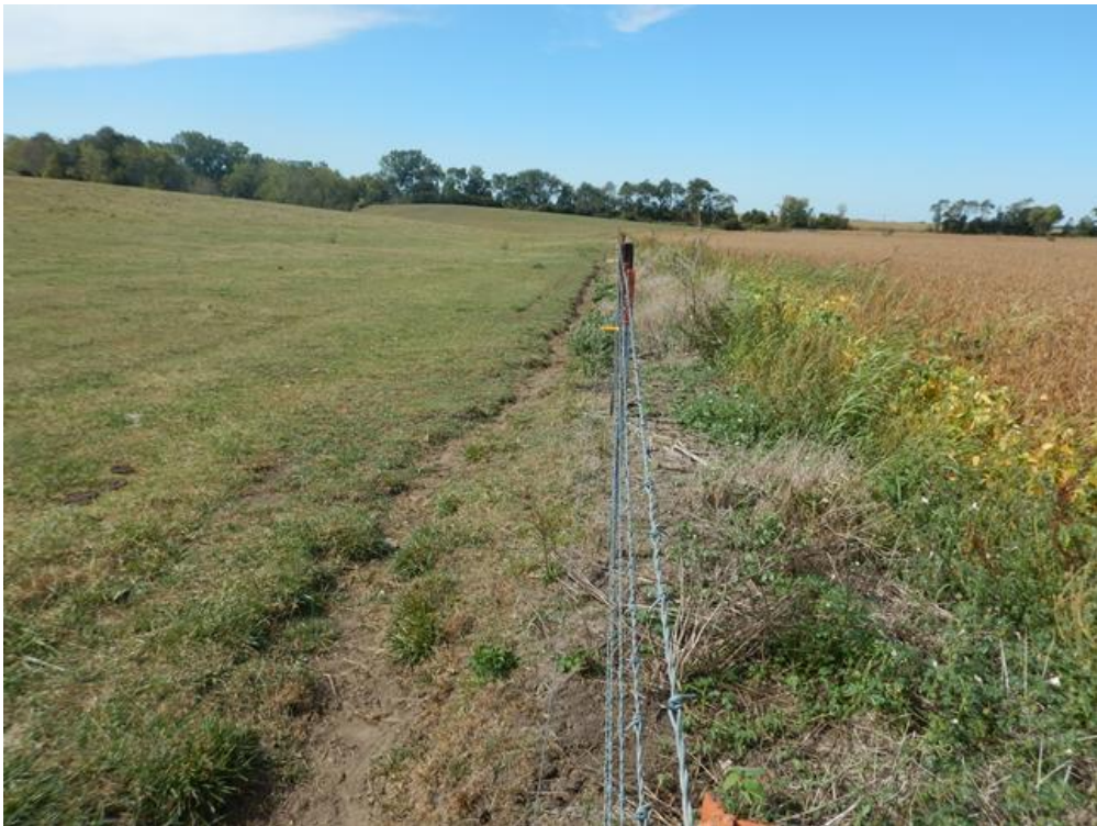
Figure 4. 1281-1 View west along fence line south of lagoons.