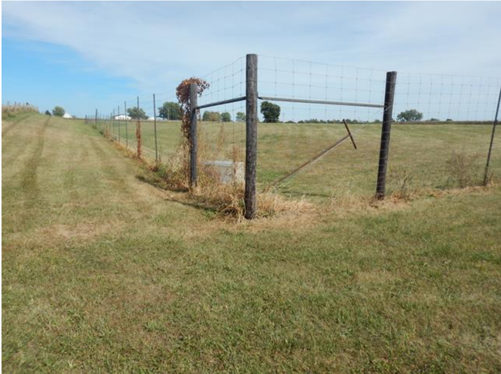
Figure 1. 1281-1 Southwest corner of lagoons looking north.