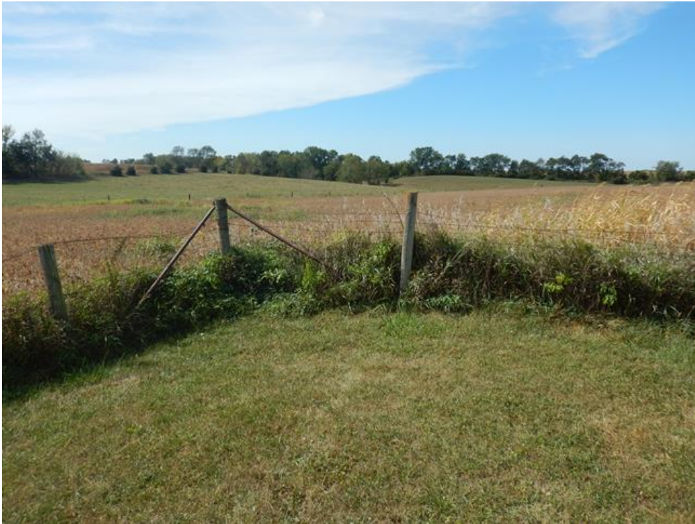
Figure 3. 1281-1 View to southwest from lagoons.