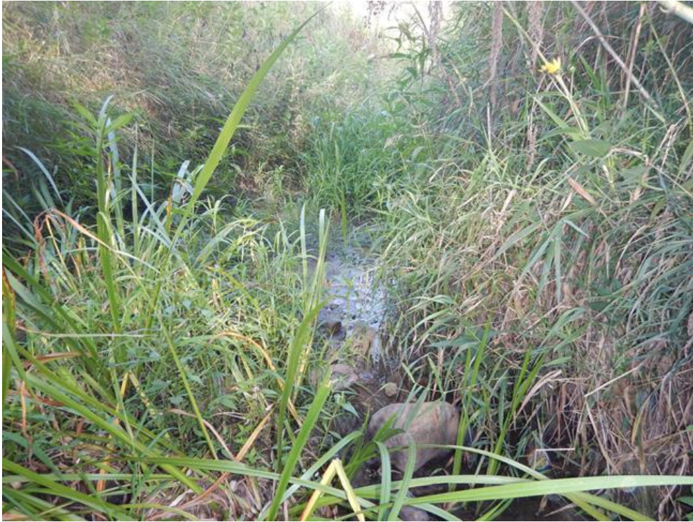
Figure 1. 1322-1 View upstream.