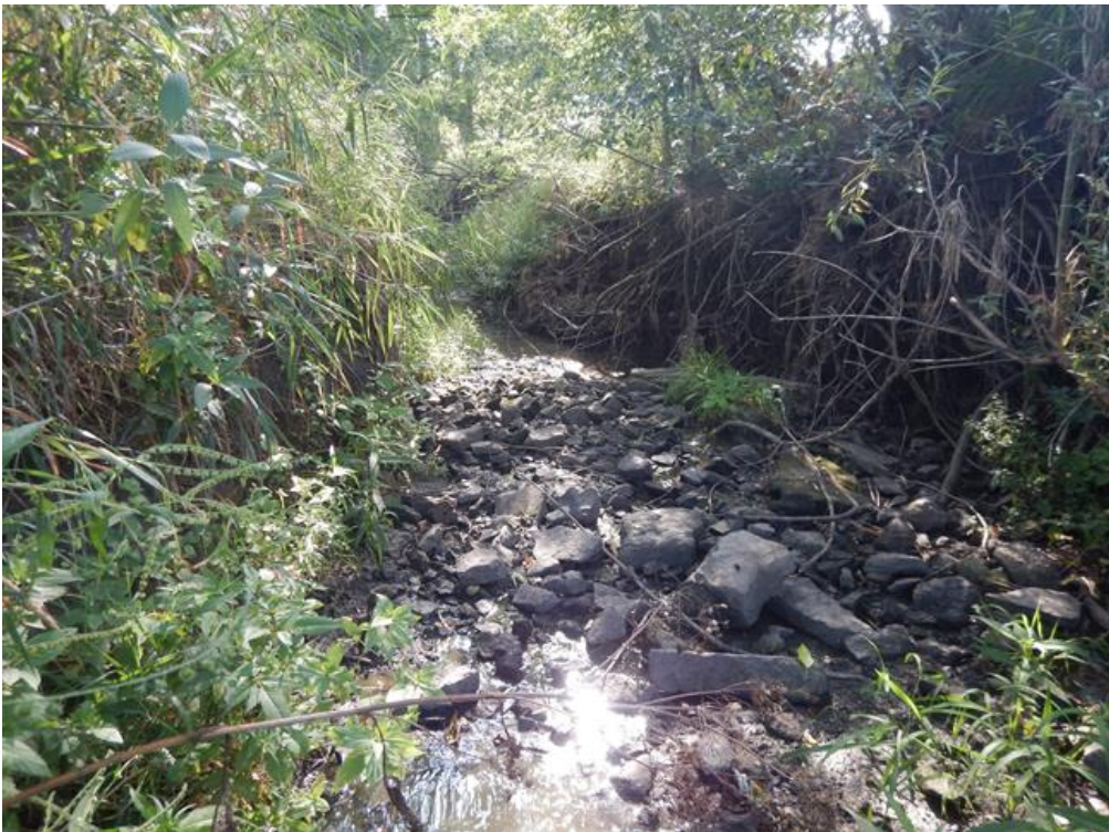
Figure 2. 1322-1 View downstream.