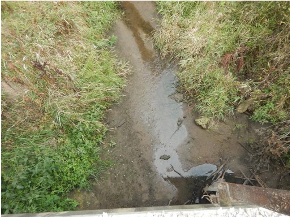
Figure 5. 1322-2 View on upstream side of bridge looking directly down.