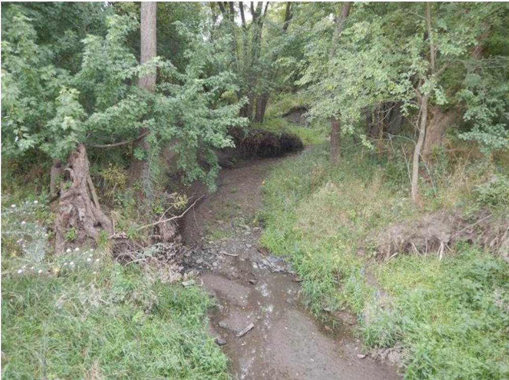
Figure 6. 1322-2 View downstream.