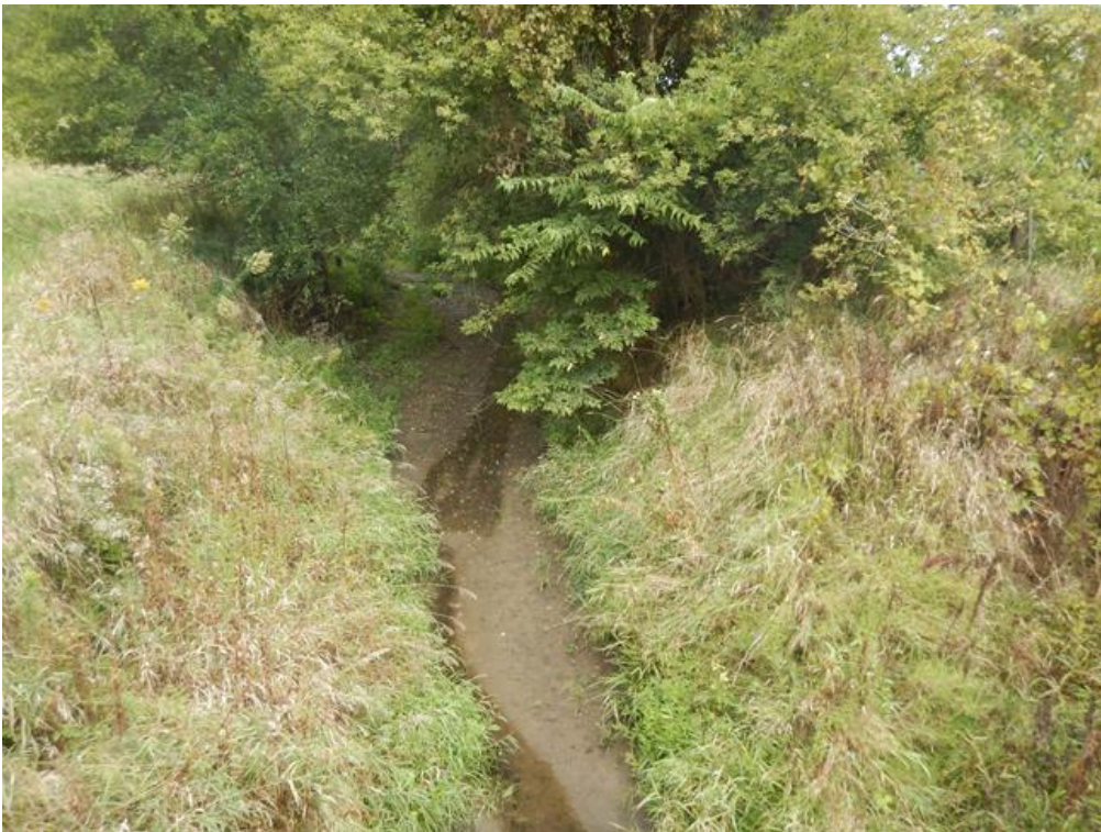
Figure 4. 1322-2 View upstream.