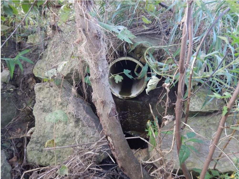
Figure 3. 1322-1 Outfall.