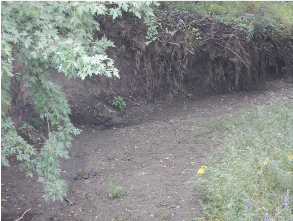
Figure 7. 1322-2 View downstream photo 2.