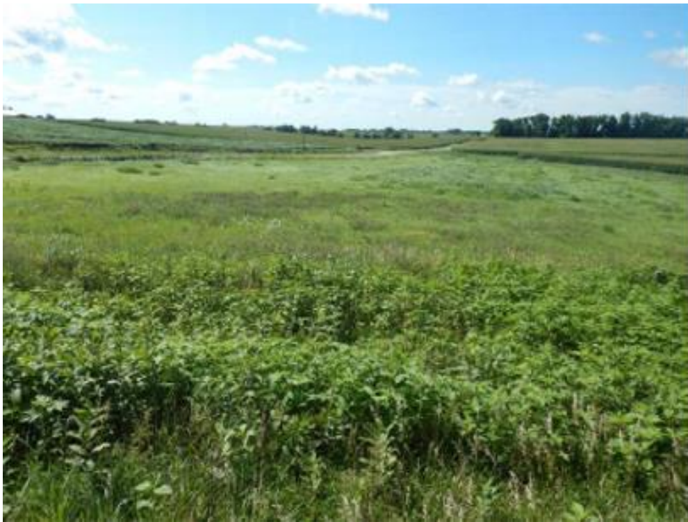
Figure 2. 1371-1 Recreational use assessment looking downstream.