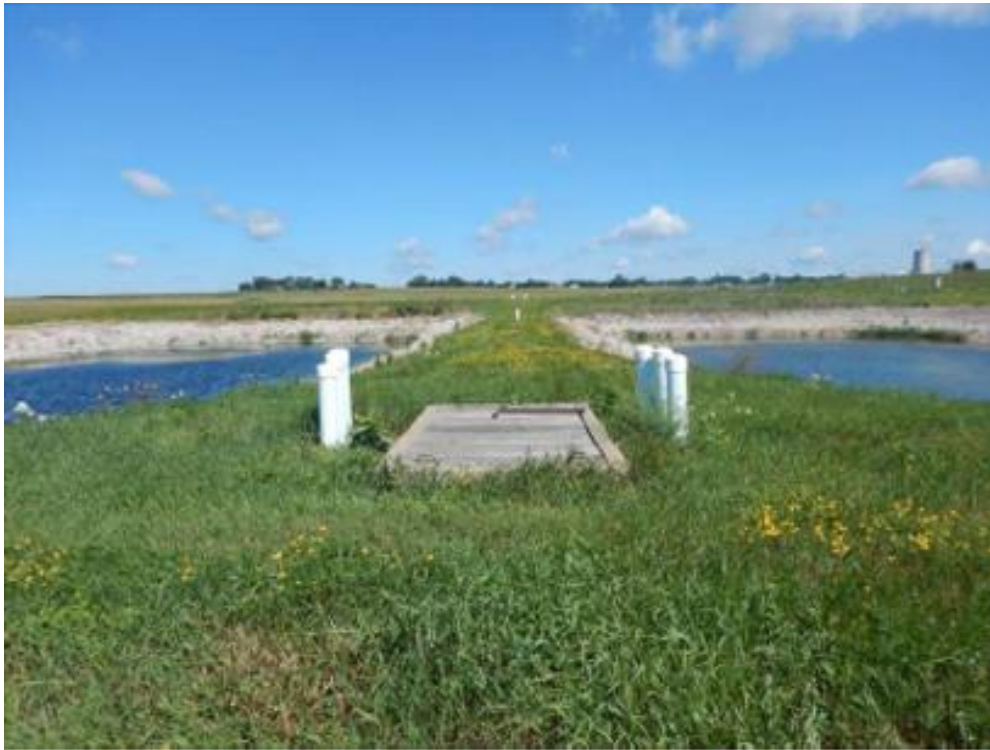
Figure 1. 1371-1 Recreational use assessment looking upstream.