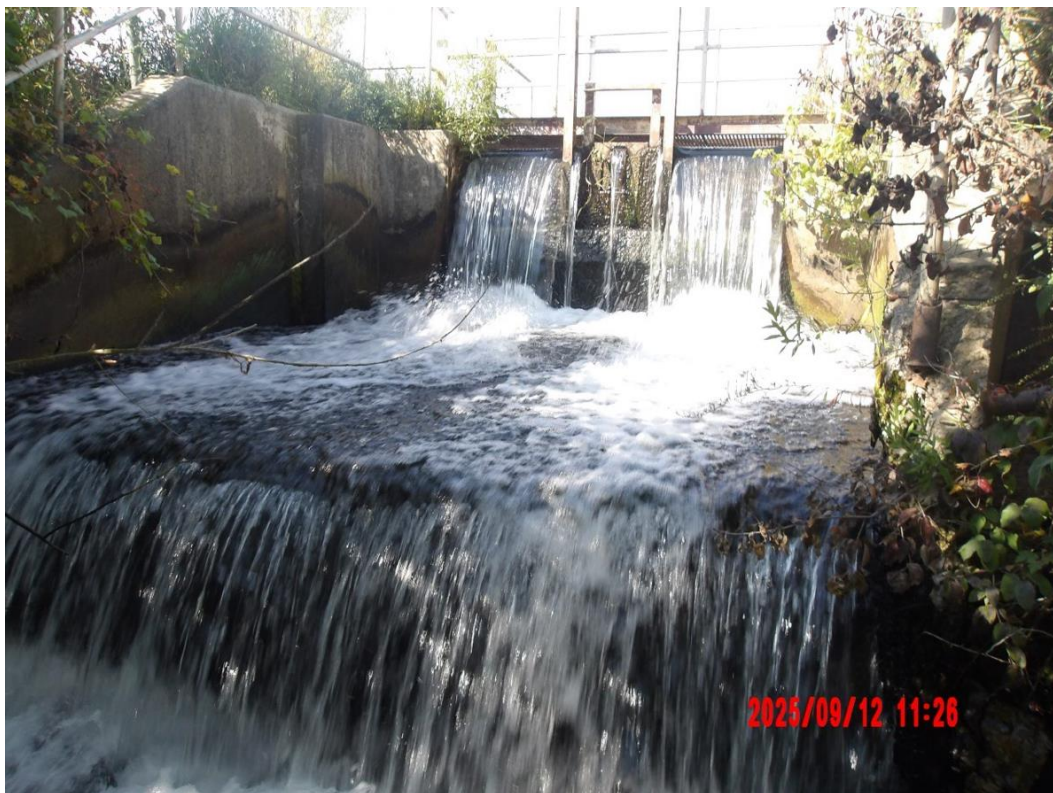
Figure 4. 1609 Fish upstream location looking upstream.