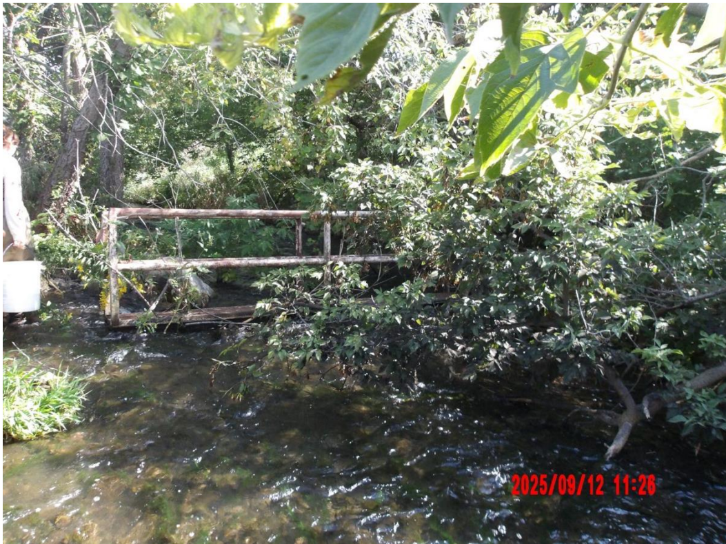
Figure 3. 1609 Fish upstream location looking downstream.