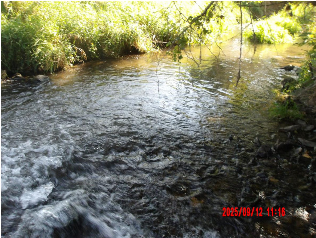
Figure 1. 1609 Fish downstream location looking downstream.