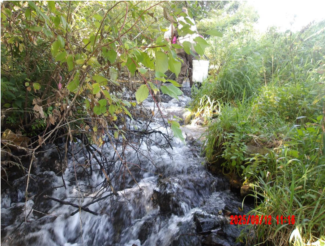
Figure 2. 1609 Fish downstream location looking upstream.