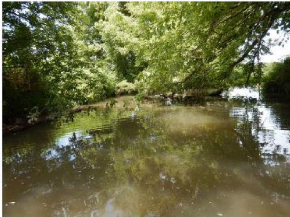
Figure 4. 1368-1 Recreational use assessment downstream looking downstream.