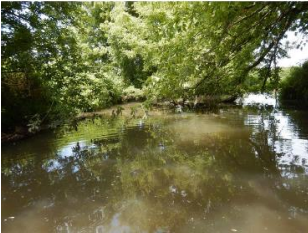
Figure 2. 1368-1 Recreational use assessment upstream looking downstream.