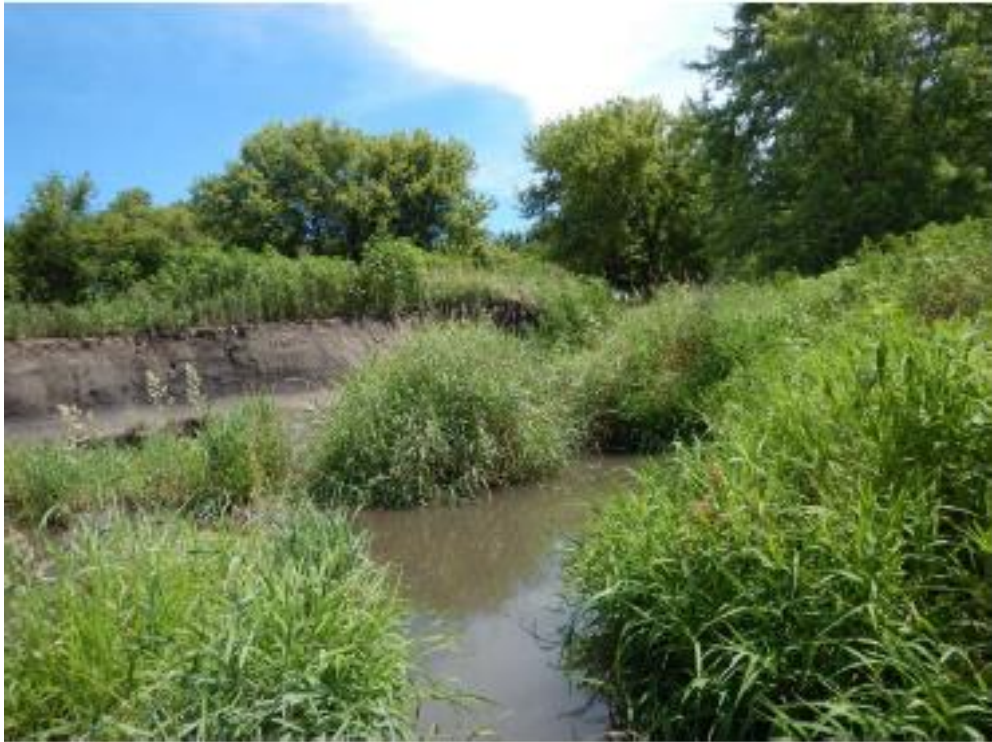
Figure 3. 1368-1 Recreational use assessment downstream looking upstream.