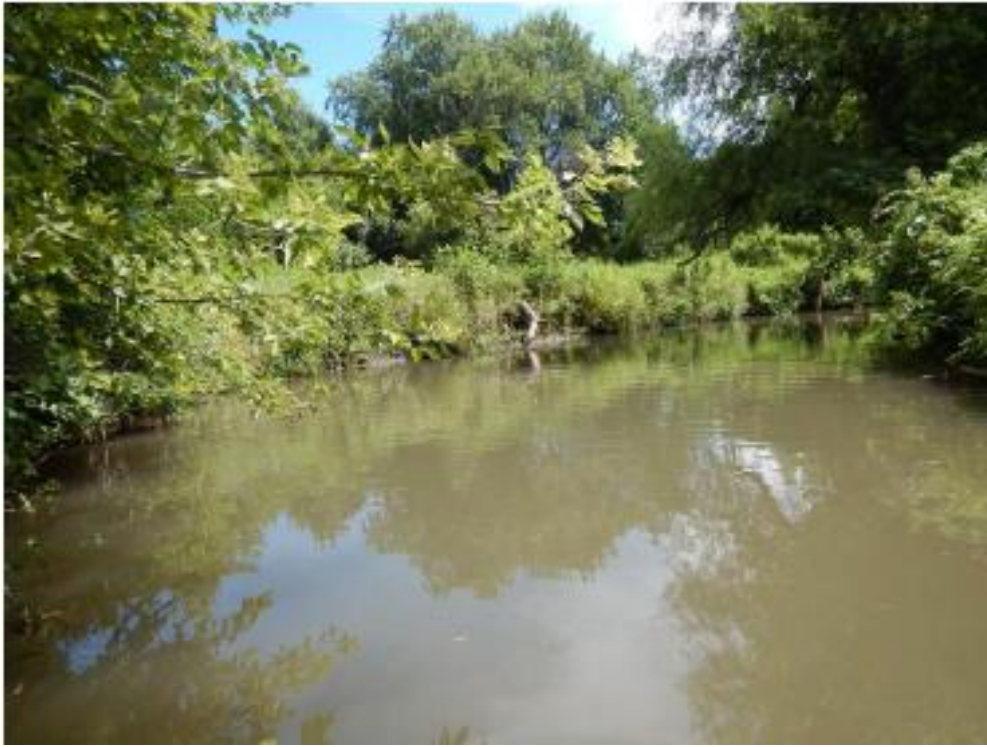
Figure 1. 1368-1 Recreational use assessment upstream looking upstream.