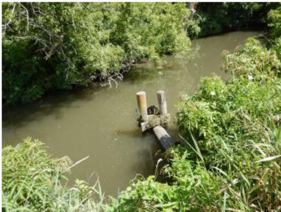
Figure 5. 1368-1 Recreational use assessment outfall.