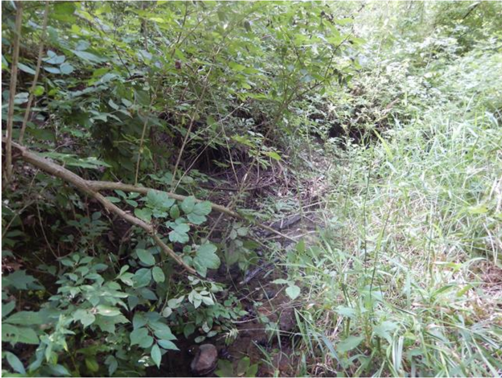
Figure 3. 643-5 View downstream.