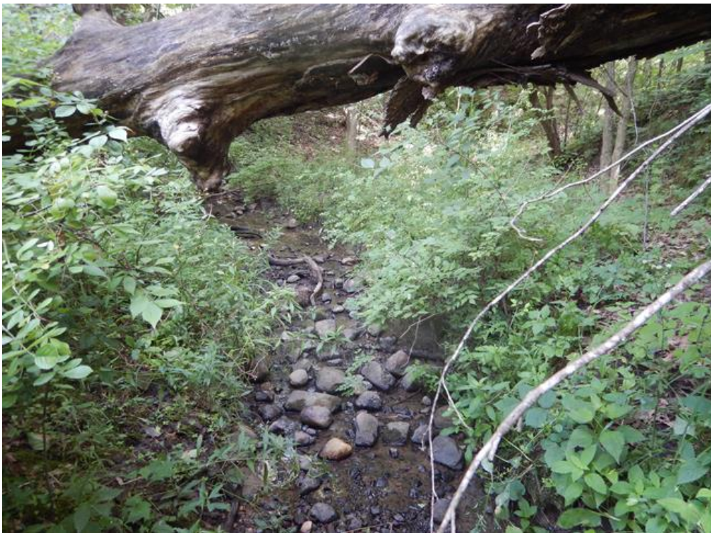
Figure 2. 643-5 View upstream.