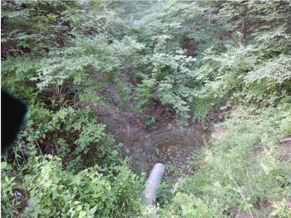
Figure 1. 643-4 Outfall.