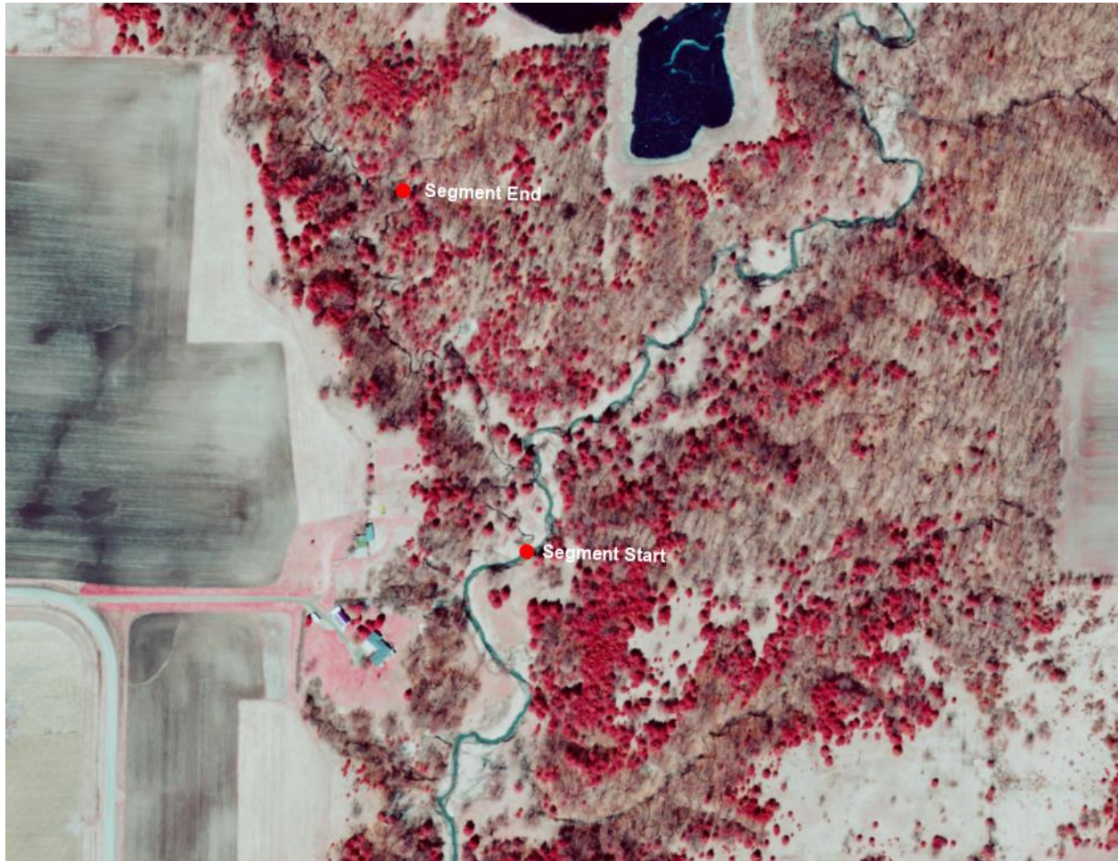
Figure 1. Color infrared imagery of Unnamed Tributary to Peas Creek.