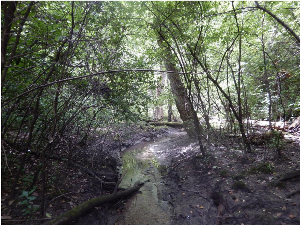
Figure 3. View downstream.