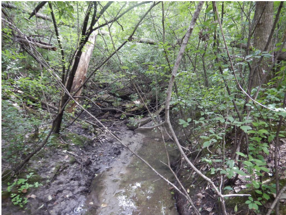
Figure 2. View upstream.