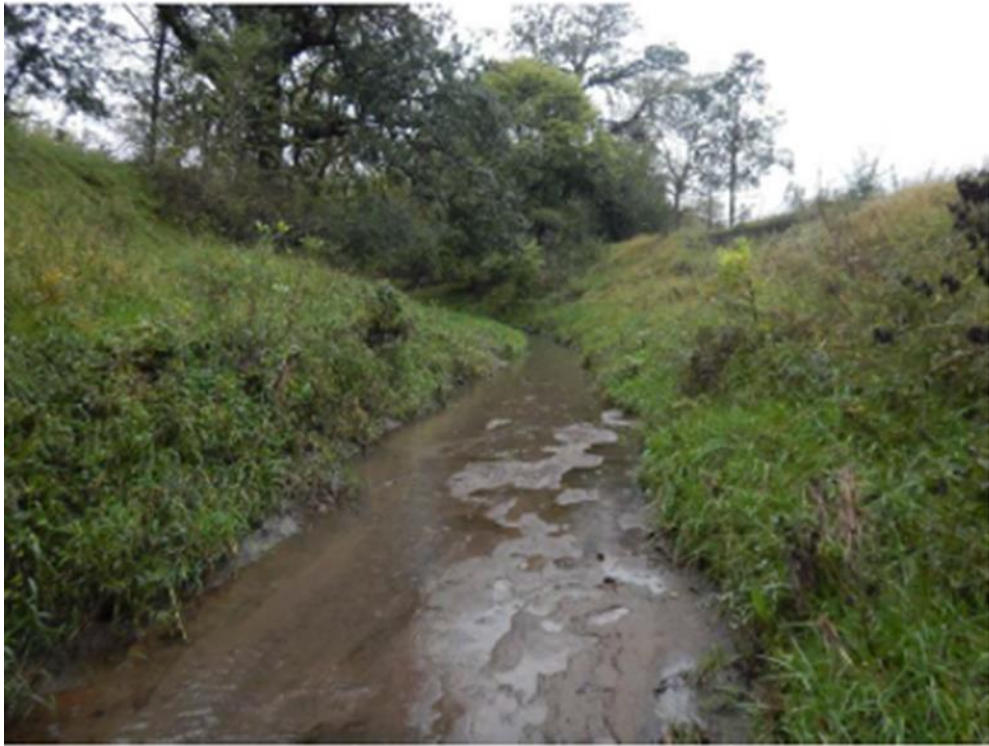
Figure 5. 1393-3 Recreational use assessment upstream looking upstream.