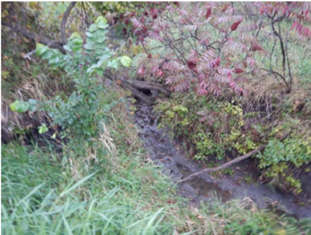
Figure 2. 1393-2 Recreational use assessment looking upstream.