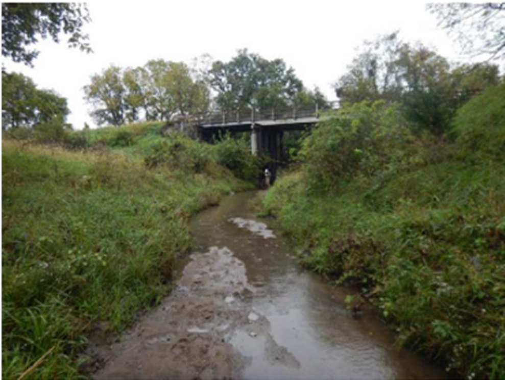
Figure 6. 1393-3 Recreational use assessment upstream looking downstream.