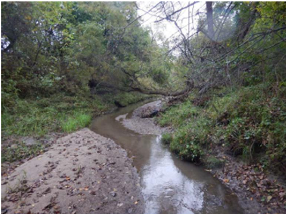
Figure 8. 1393-3 Recreational use assessment downstream looking downstream.