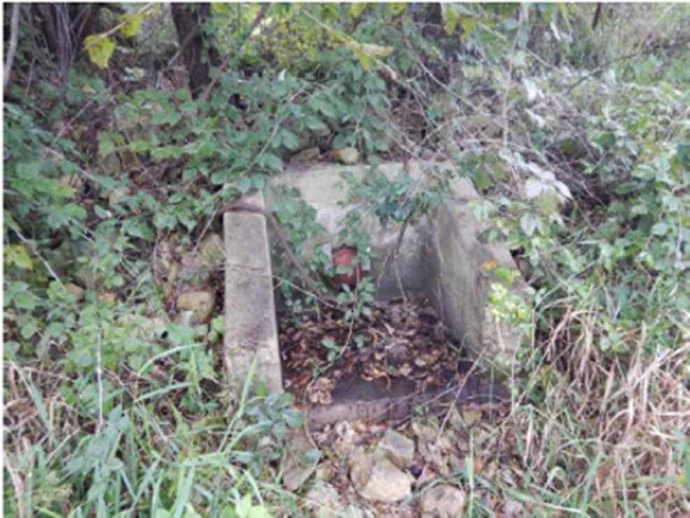
Figure 1. 1393-1 Recreational use assessment showing the outfall.