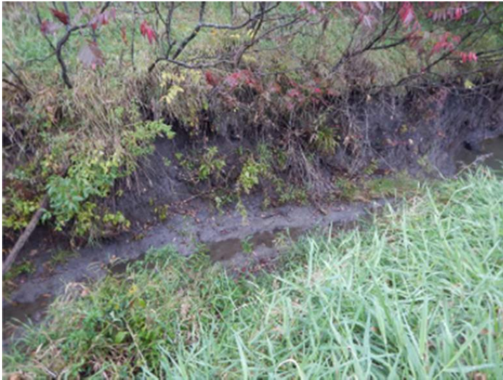
Figure 3. 1393-2 Recreational use assessment looking downstream.