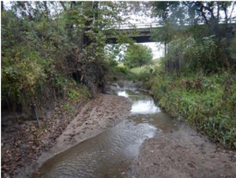
Figure 7. 1393-3 Recreational use assessment downstream looking upstream.