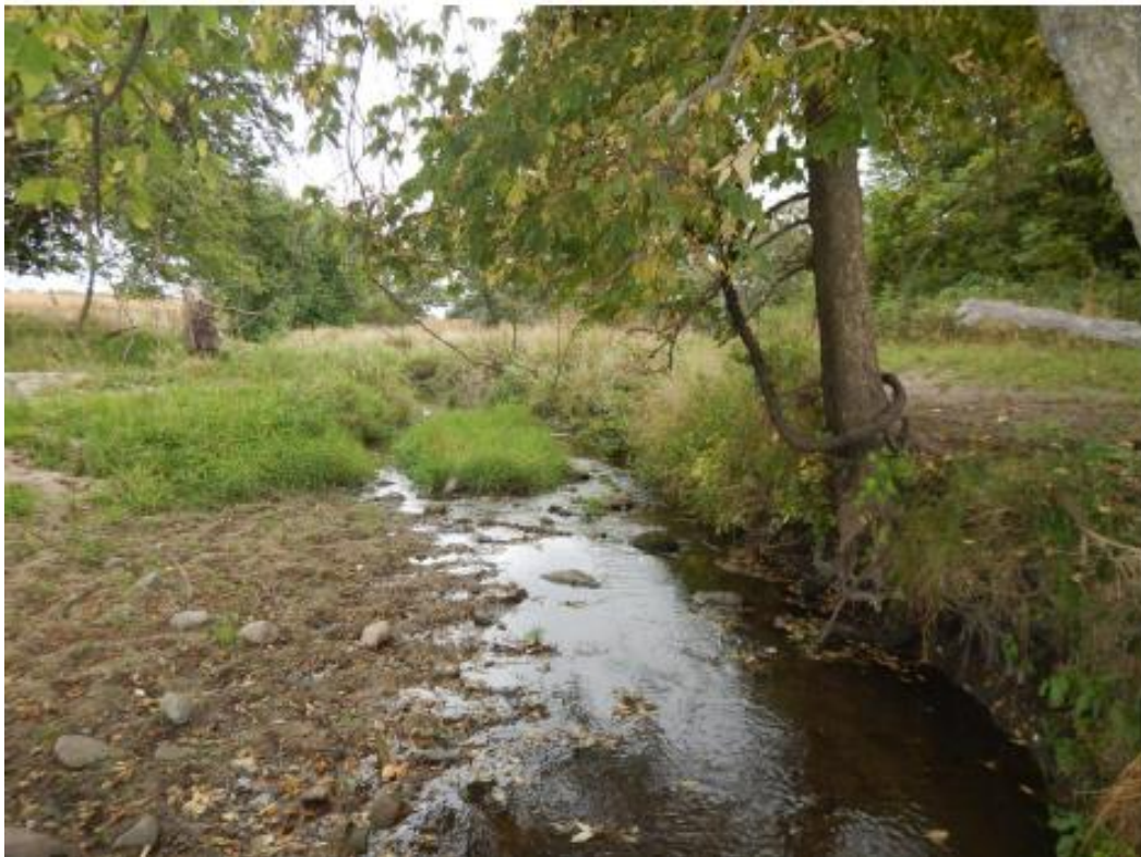
Figure 16. 1343-3 Recreational use assessment downstream looking downstream.