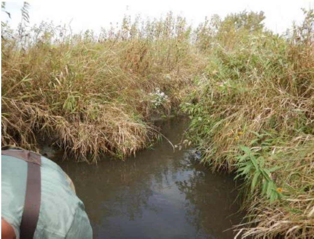
Figure 9. 1343-2 End of aquatic assessment – view upstream.