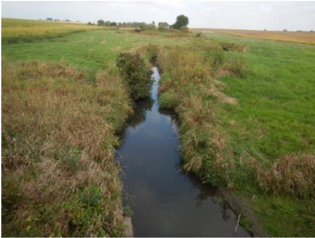
Figure 1. 1343-2 Recreational use assessment midpoint looking upstream.