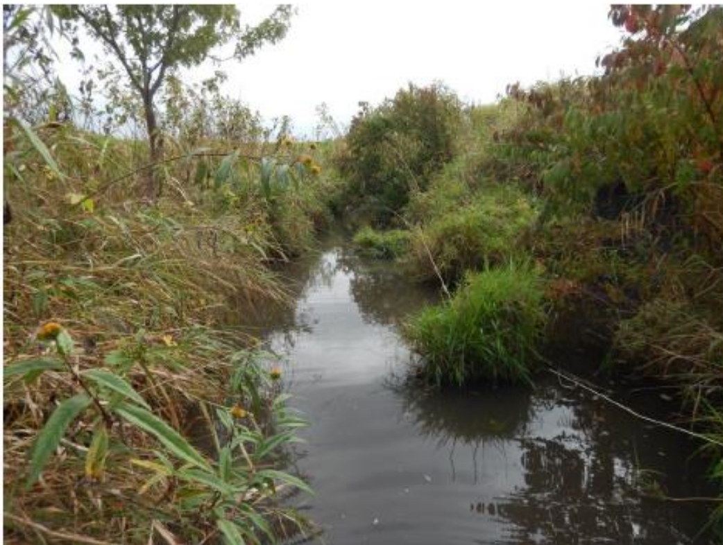
Figure 10. 1343-2 End of aquatic assessment – view downstream.