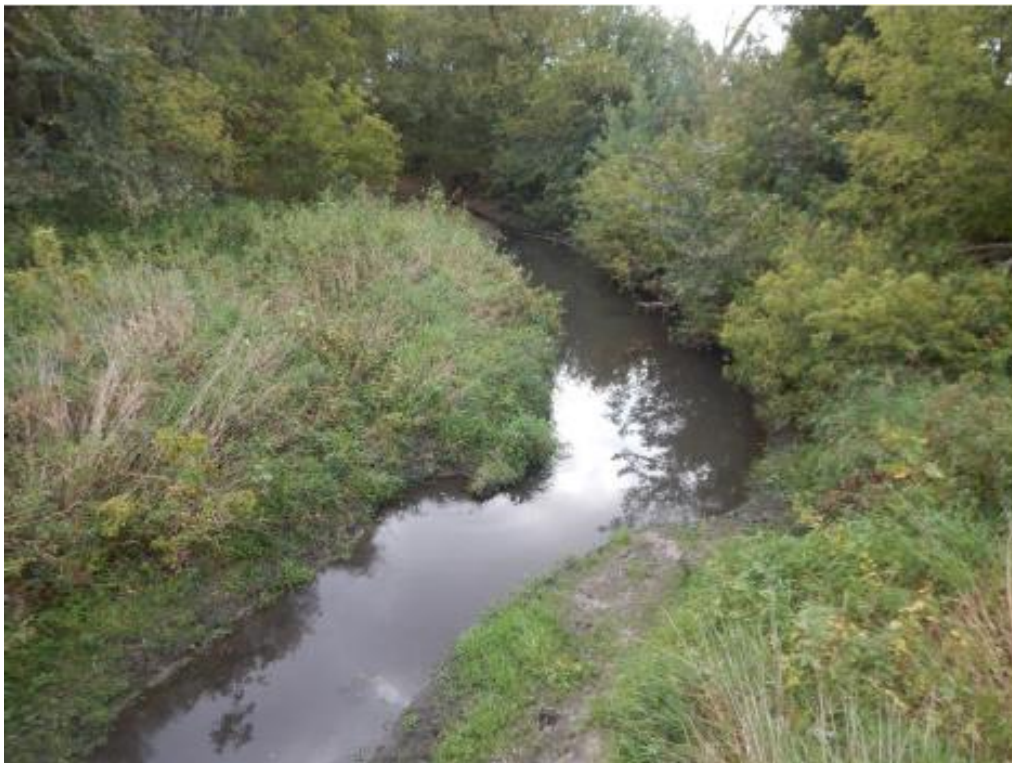
Figure 2. 1343-2 Recreational use assessment midpoint looking downstream.