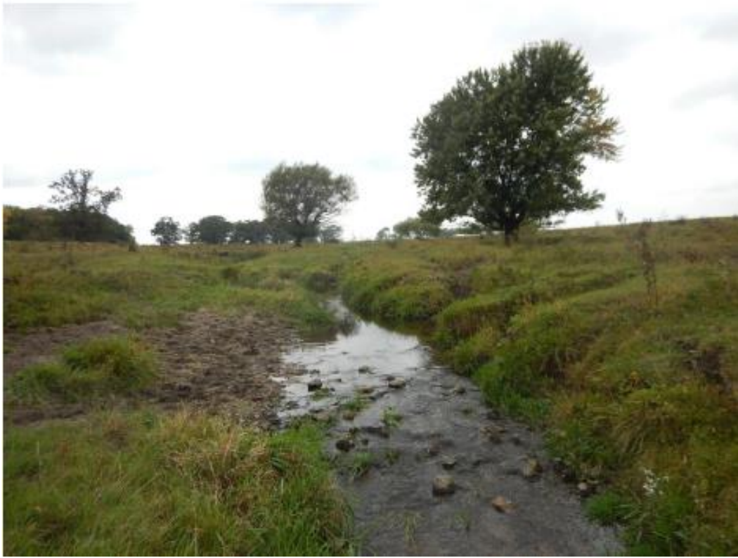
Figure 13. 1343-3 Recreational use assessment upstream looking upstream.