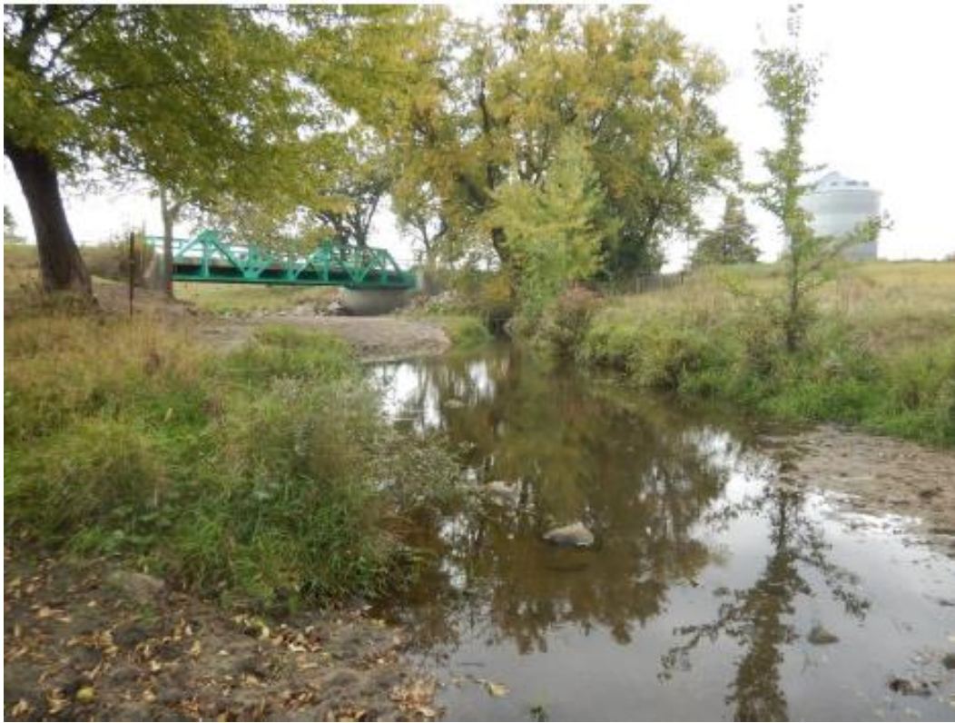
Figure 15. 1343-3 Recreational use assessment downstream looking upstream.