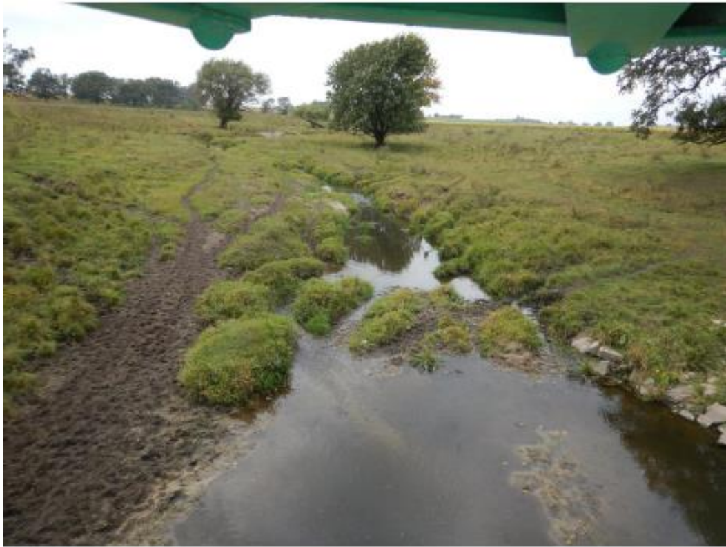
Figure 11. 1343-3 Recreational use assessment midpoint looking upstream.