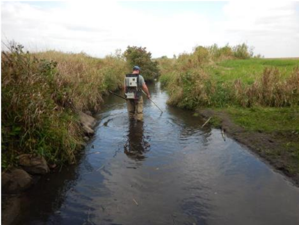
Figure 7. 1343-2 Start of aquatic assessment – view upstream.