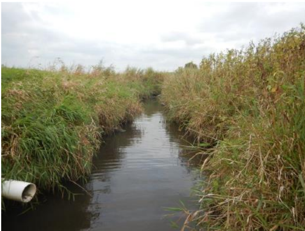
Figure 3. 1343-2 Recreational use assessment upstream looking upstream.