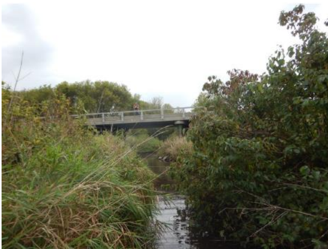
Figure 4. 1343-2 Recreational use assessment upstream looking downstream.