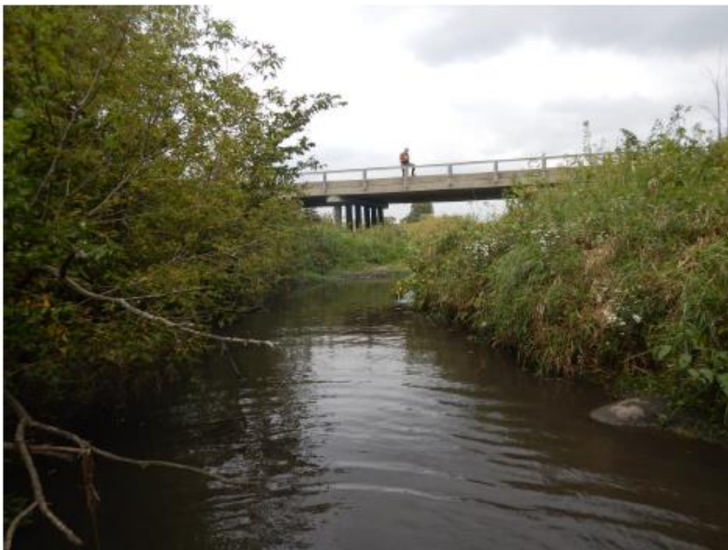
Figure 5. 1343-2 Recreational use assessment downstream looking upstream.