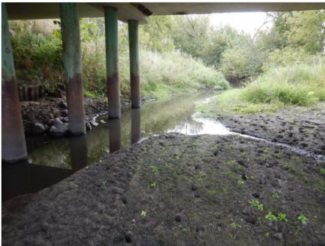
Figure 8. 1343-2 Start of aquatic assessment – view downstream.