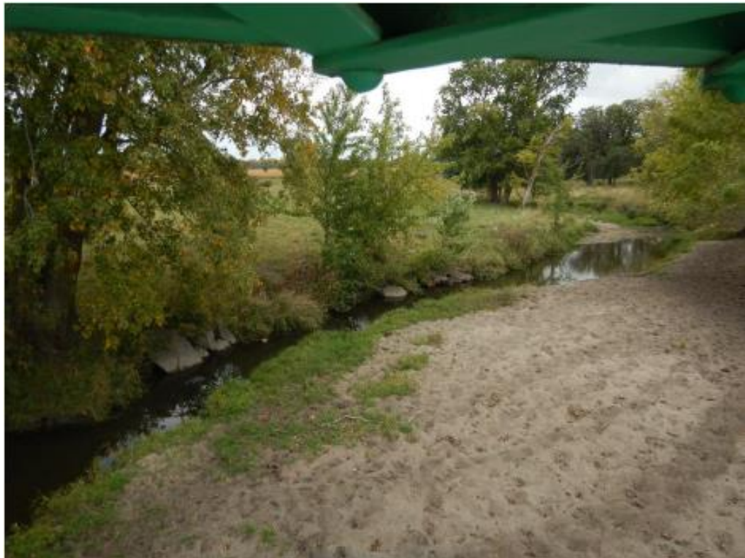
Figure 12. 1343-3 Recreational use assessment midpoint looking downstream.