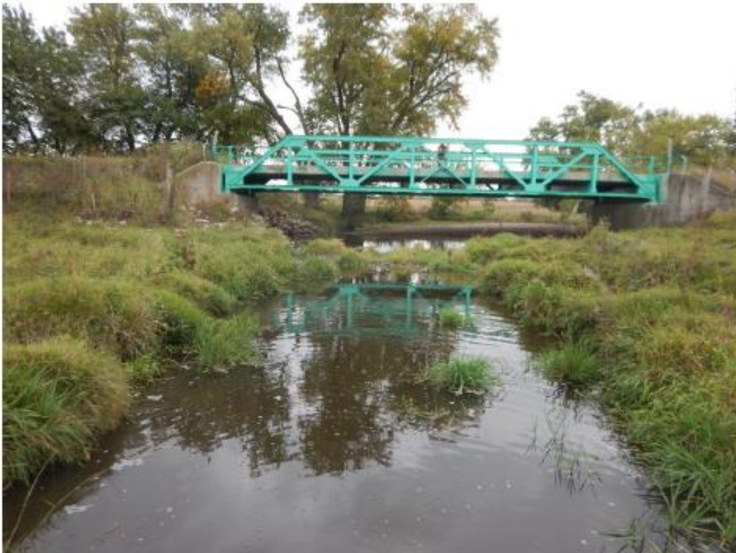
Figure 14. 1343-3 Recreational use assessment upstream looking downstream.