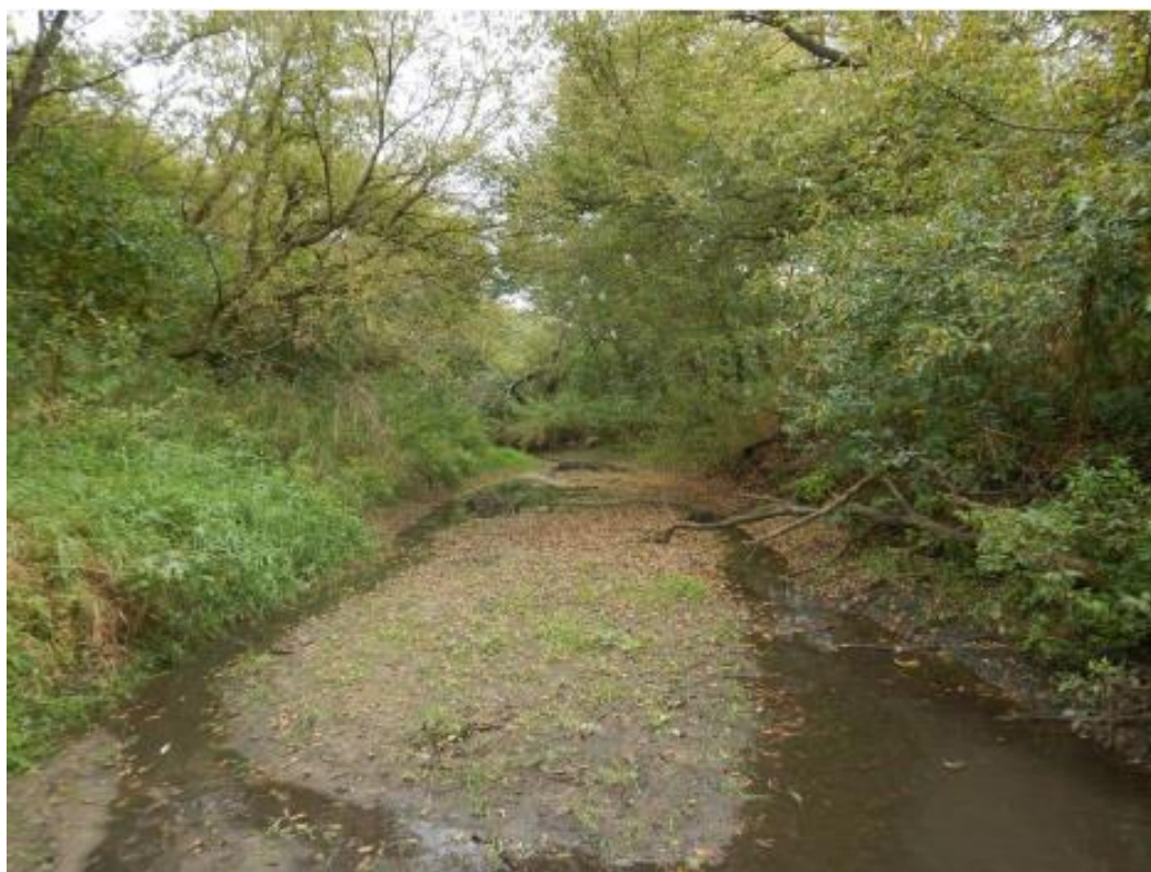
Figure 6. 1343-2 Recreational use assessment downstream looking downstream.