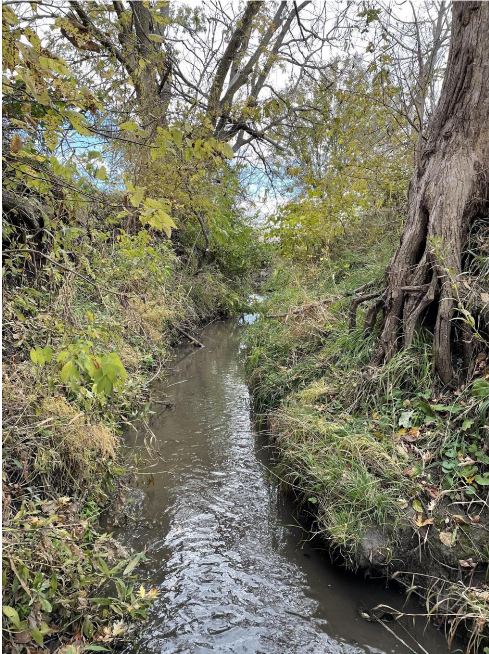
Figure 4. Site #1 - supplemental site downstream.