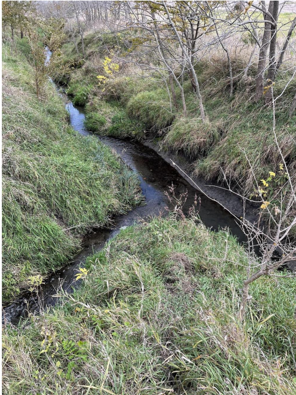
Figure 5. Confluence with Marvel Creek.