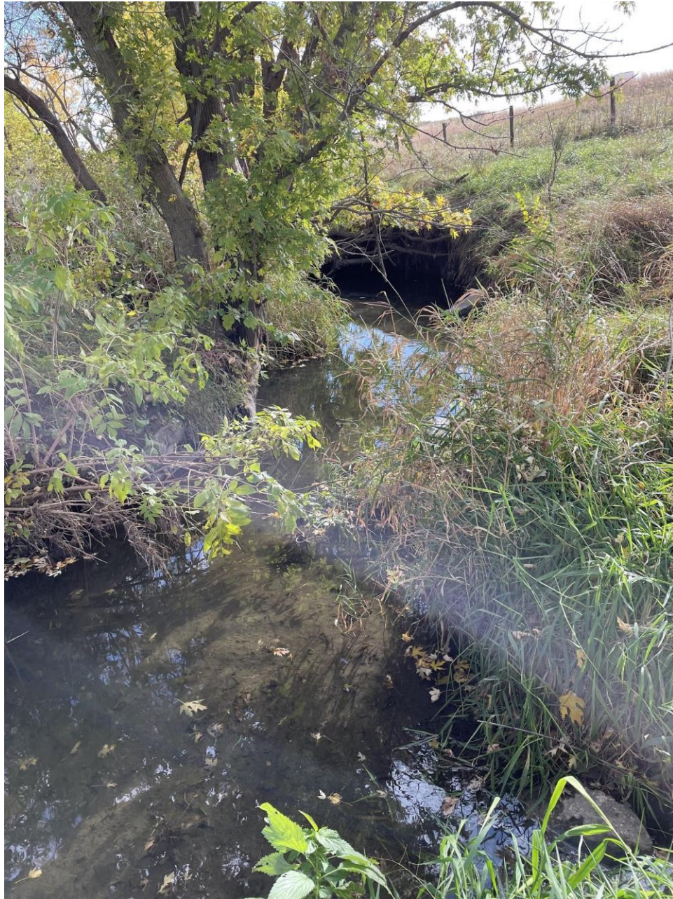
Figure 3. Outfall pool downstream.