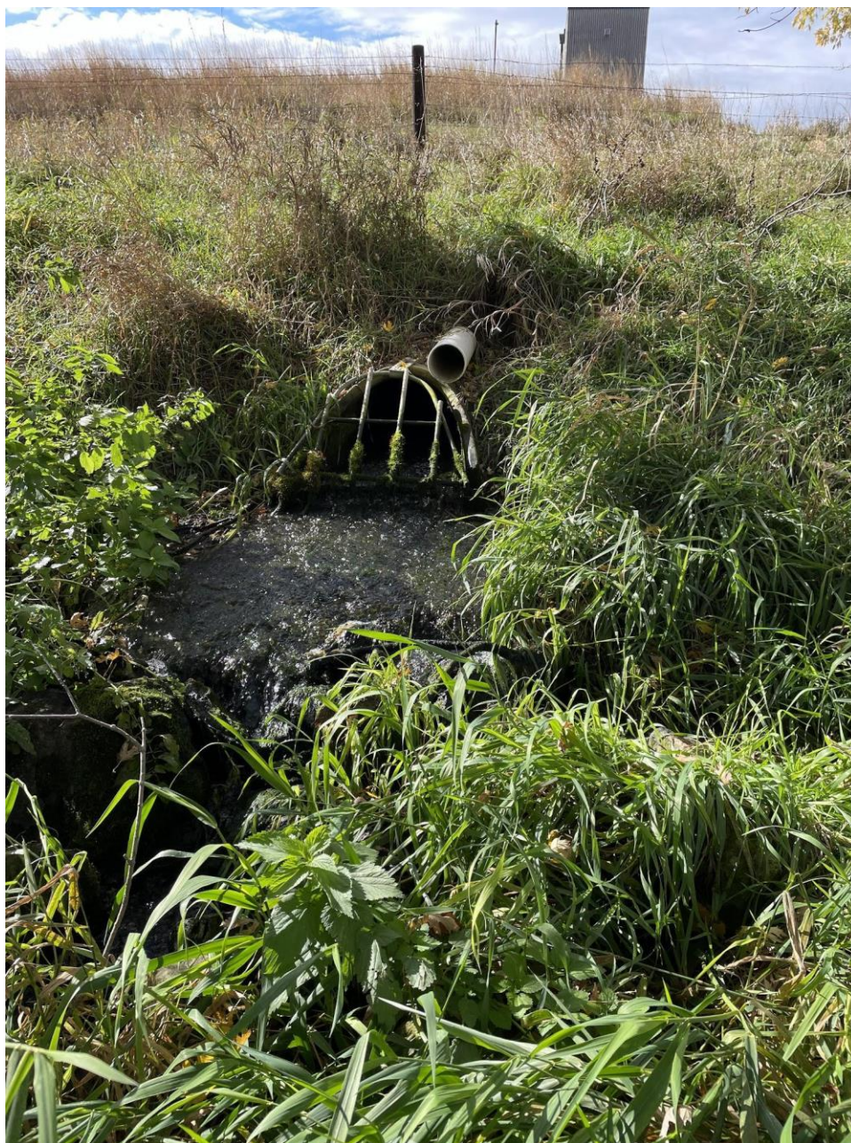
Figure 1. Outfall.