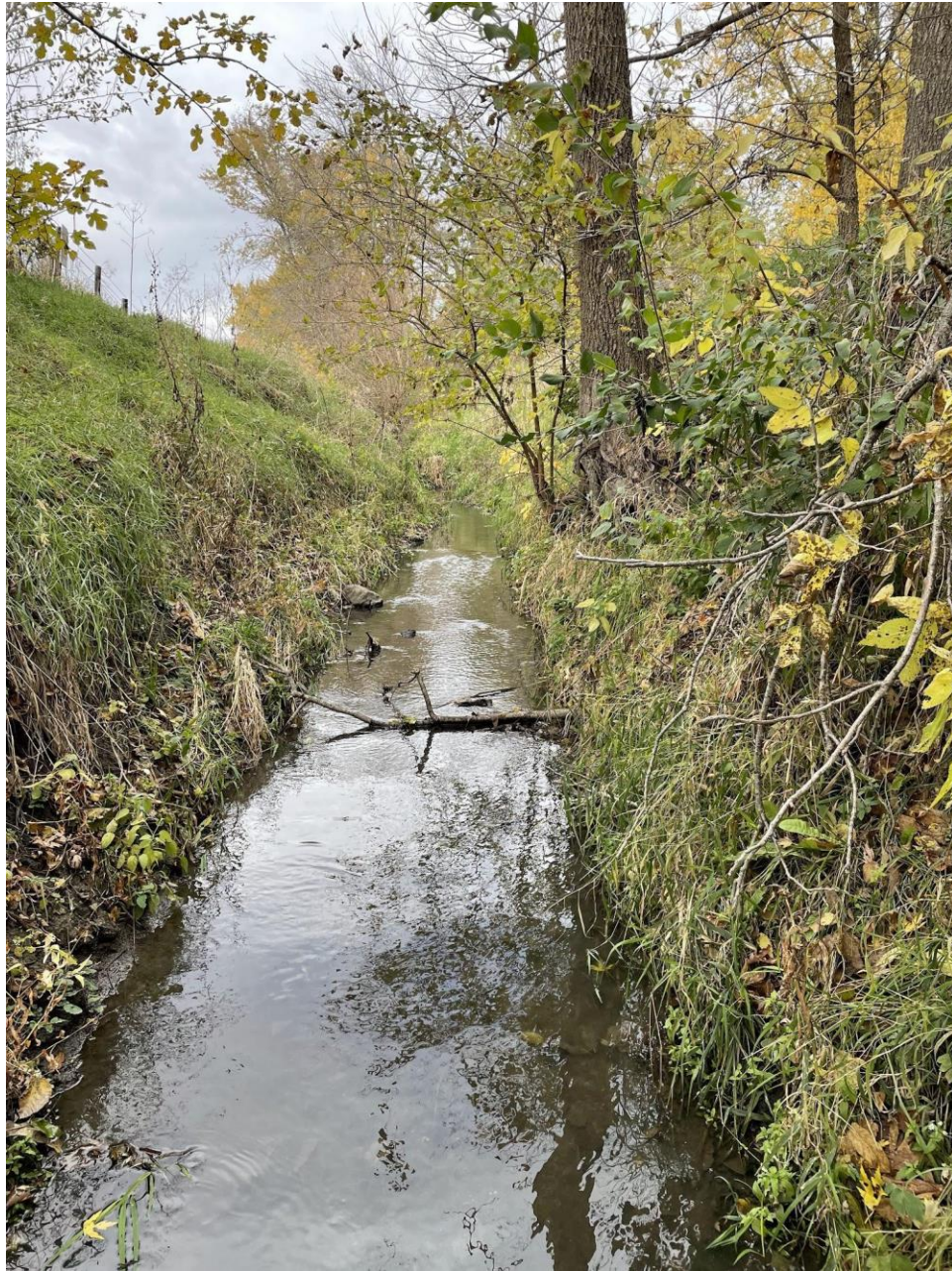
Figure 4. Site #1 - supplemental site upstream.