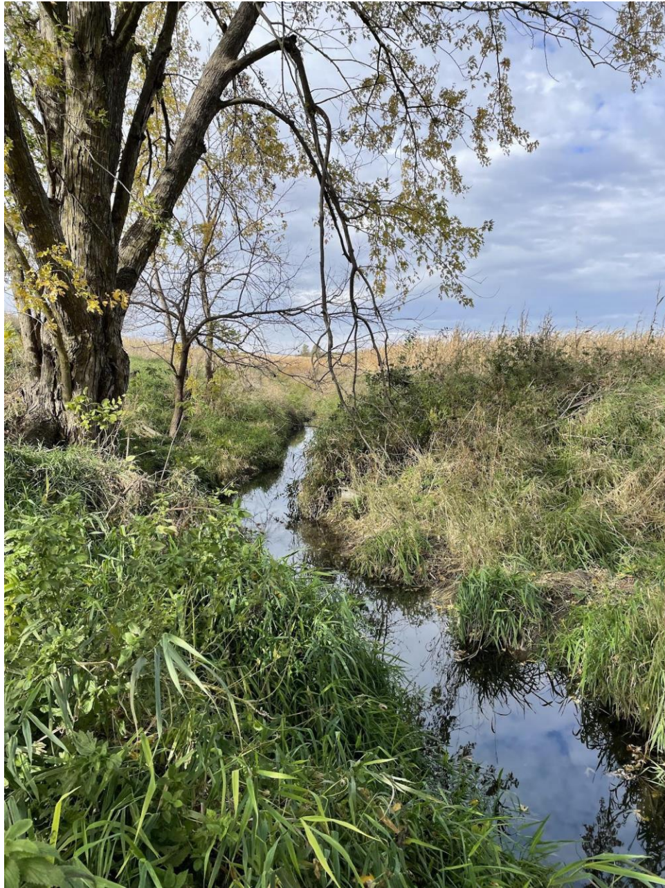
Figure 2. Outfall pool upstream.