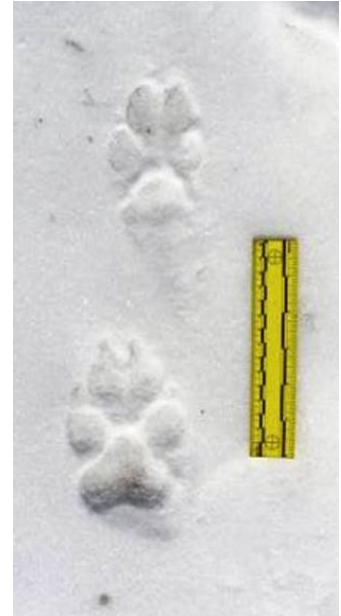
Wolf track in fresh snow