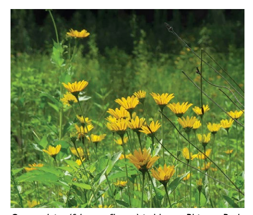
Ox-eye daisy (false sunflower) in bloom, Phinney Park These small sunflower-look-a-like prairie flowers bloom from early summer to mid fall and attract butterflies, bees, and some