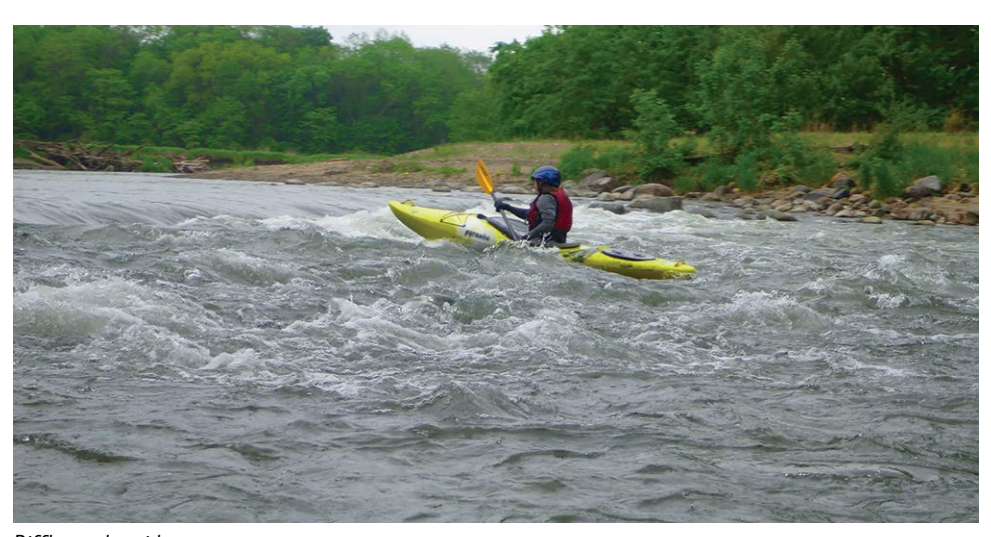
Riffles and rapids

Red oak trees can be found in the upland woodlands at the northern end of the water trail, between Lentsch and Cunningham accesses of the water trail.