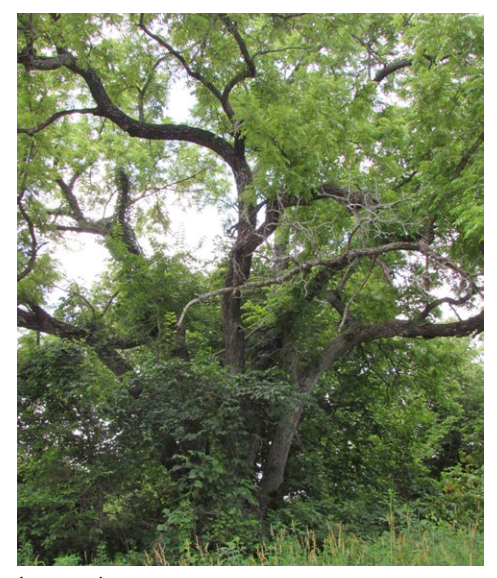
Large walnut tree

Walnut, ash, hackberry, boxelder, and elm trees are common on benches above the creek.