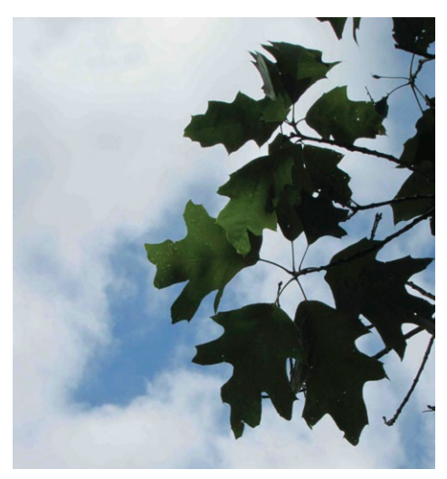
Red oak leaves

Red oak trees can be found in the upland woodlands at the northern end of the water trail, between Lentsch and Cunningham accesses of the water trail.