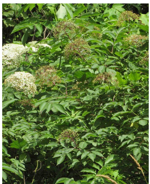
Elderberry blooms and fruits

Walnut, ash, hackberry, boxelder, and elm trees are common on benches above the creek.