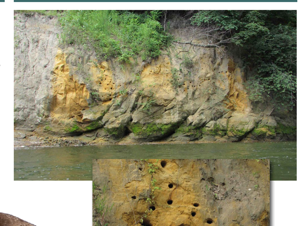
Bank swallows make nests in soft sandstone