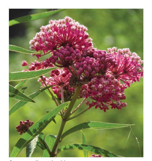
Swamp milkweed in bloom

These flowers attract butterflies and bees and thrive in wet and muddy soils. As a milkweed plant, it is an important food source for the monarch caterpillar.