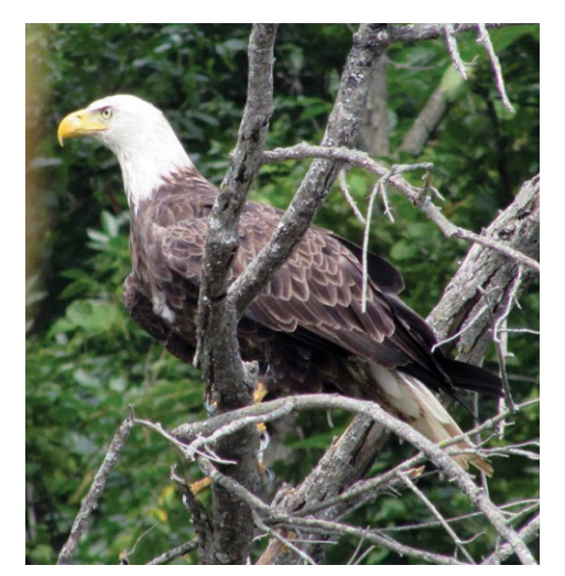
Adult bald eagle

These flowers attract butterflies and bees and thrive in wet and muddy soils. As a milkweed plant, it is an important food source for the monarch caterpillar.