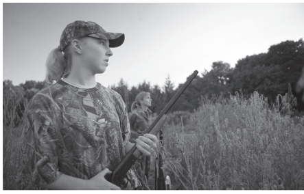
Missouri Department of Conservation