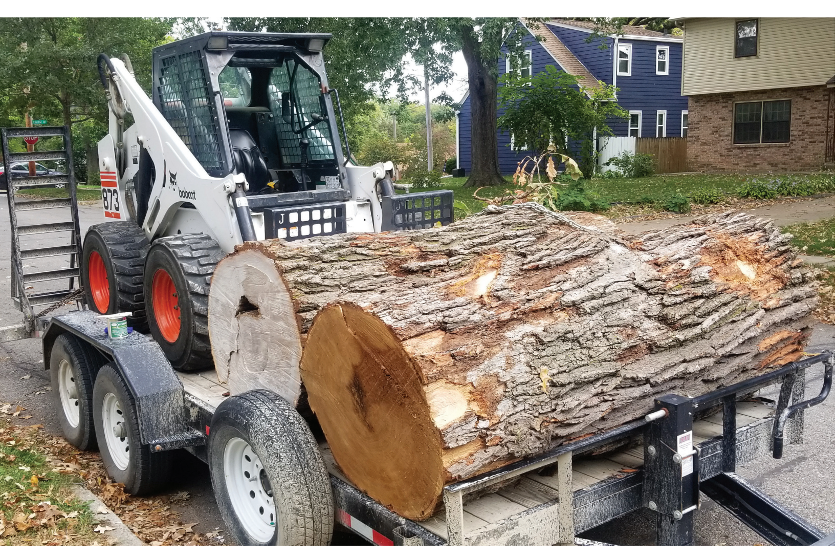
Typically destined for a shredder, neighbors asked the tree service to save these bur oak logs from a residential tree in a Des Moines neighborhood. The logs went to a portable sawmill and the lumber was returned to the same neighbors and air dried in a garage of a hobby woodworker to make keepsake furnishings for neighbors.