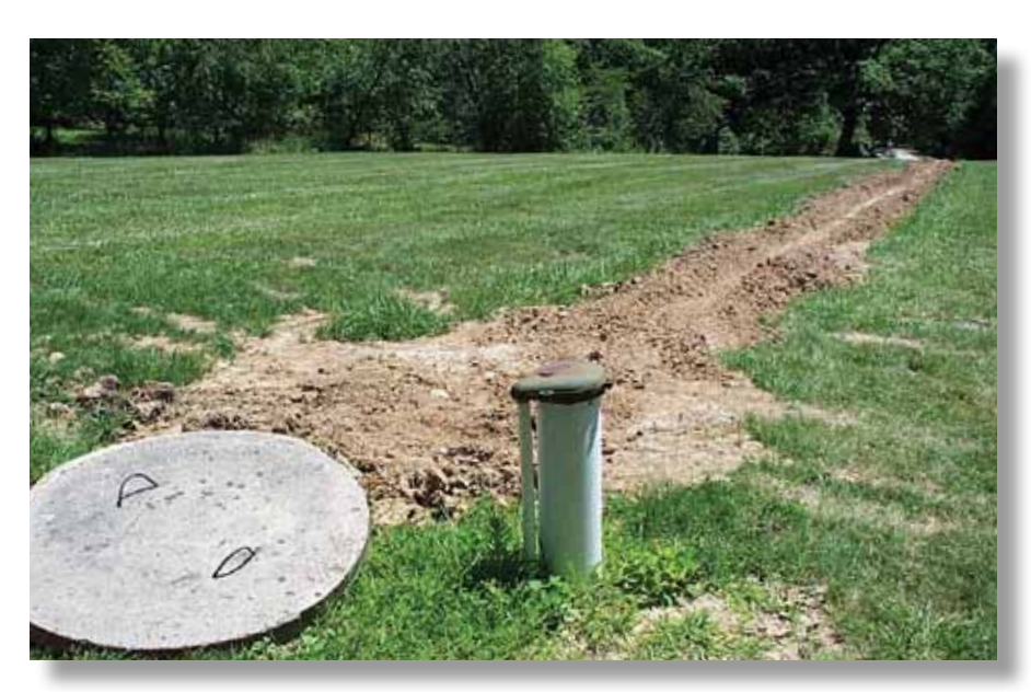
New construction of a wellhead with grass and trees planted in the capture zone.

The Iowa Source Water Agricultural Collaborative has a website at www.cleanwateriowa.org.