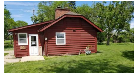
Parks Design Guide Example