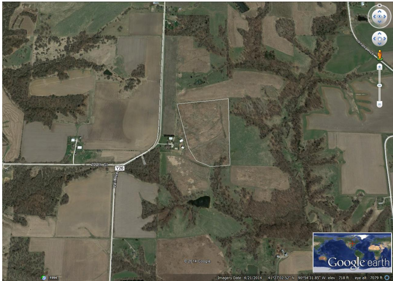
Site Photo 2014