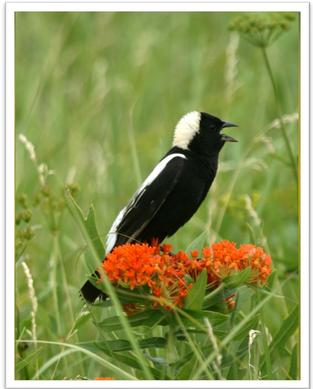
Male Bobolink on stalk of Butterfly Milkweed.

The practice is available most counties near existing protected wildlife habitats. These areas are eligible and have a high priority, because wildlife species benefit most when there are large expanses of grasslands or wetlands. Eligible producers can sign up at their local USDA Farm Service Agency .