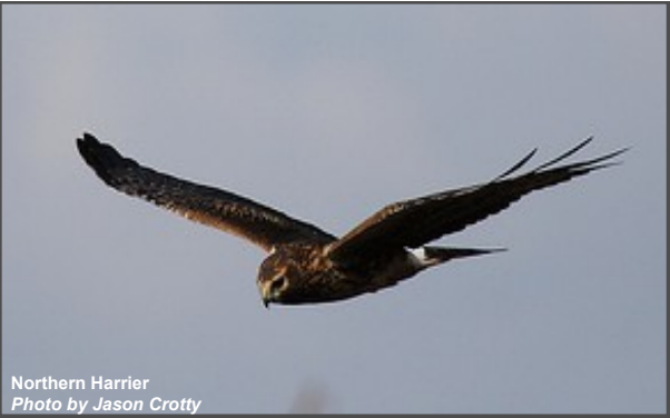
Northern Harrier