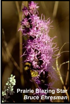
Prairie Blazing Star Bruce Ehresman

Because the Raccoon River Savanna boasts a mixture of grasslands, woodlands, and savanna, a variety of species can be found on even a short excursion. One may encounter Indian Grass, Prairie Blazing Star, Purple Prairie Clover, or Butterfly Milkweed in the prairies. Species such as Little Bluestem, Pennsylvania Sedge, Side-oats Grama, Virginia Wild Rye, and Bur Oak typify the savanna habitat. Oak and hickory species dominate the woodlands, and Solomon’s Seal, Bloodroot, Virginia Waterleaf, Columbine, and Jack-in-the-pulpit blanket the understory in the spring.