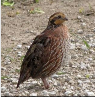
Northern Bobwhite

The Raccoon River Savanna Bird Conservation Area (BCA), dedicated in 2006, was the tenth to be created in the state of Iowa. Totalling 54,361 acres, this large land tract encompasses three core areas in which conservation measures can be targeted: Whiterock Conservancy, Springbrook State Park, and Elk Grove Wildlife Area. This the first Iowa BCA to focus on savanna, often likened to a transition zone between prairie and forest that is crucial for many of Iowa’s birds. As many as one-third of the state’s 200 breeding birds can be found nesting in this increasingly rare habitat. Comprised of both public and private land, this mosaic landscape provides refuge to many grassland, savanna, and woodland birds. At least 29 of Iowa’s 67 Greatest Conservation Need (GCN) breeding bird species were recently documented on Whiterock Conservancy land.