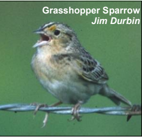
Grasshopper Sparrow Jim Durbin