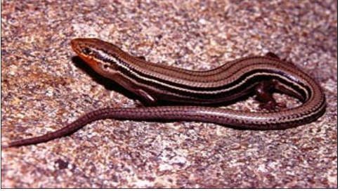
Northern Prairie Skink

dragonfly. The Northern Prairie Skink finds cover in this region’s rocky kames. Wet savanna provides habitat for Cope’s Gray Tree Frog and Northern Leopard Frog. Keep an eye on the ground for a scurrying Meadow Vole, and listen for the chatter of both Fox and Gray Squirrels throughout the wooded portions of this BCA.