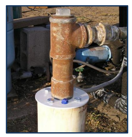
Example of a sanitary seal well cap with access plug.

Unscrew the plug (it should be on the opposite side of the cap from the power outlet) from the cap using a wrench. Set the plug in a sanitary location. The measuring point is the top of the hole in the cap. After you have finished your measurements, return the plug to the cap and tighten it.