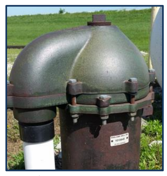
Example of a turtle back well with an access plug.

The access plug is typically on top of the well cap. Use a wrench to remove the plug in this well cap. WD-40 may help if the plug is rusted shut. If it still cannot be removed, the entire cap can be removed (see the next section). Once the plug is removed, set it in a sanitary location. The top of the hole in the cap is the measuring point. Once you are finished measuring, return the plug to the cap and tighten it.