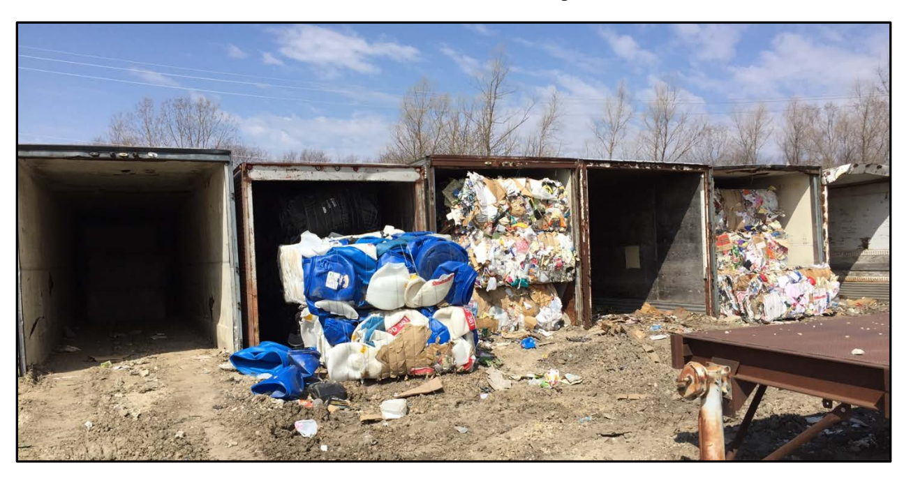
Exhibit 13. Jendro Sanitation Storage Solution

Jendro sells a truck load of cardboard to market each week. They do not currently have an issue filling a truck of material to sell to market for high volume materials, such as cardboard. Greater storage space for lower volume materials, such as plastics, would allow them to store enough material to fill a truck load and therefore receive highest market value for the material. Jendro has established a creative storage solution for the recovered recyclables, using old semi-trailers, as shown in Exhibit 13 . The materials are stored temporarily in the storage trailers and then reloaded onto the buyers' trailers when the trailer is full.