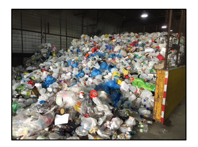
Exhibit 12. (Clockwise from top left): Carroll County Pre-Sorted Containers, Sort Line, and Fiber Baler