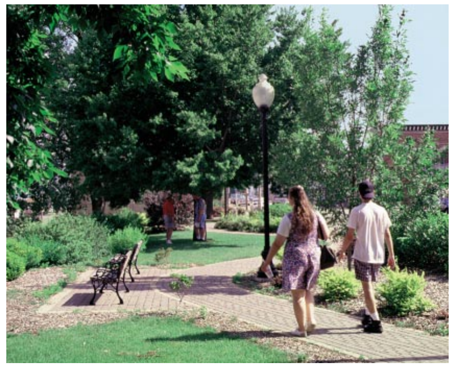
Figure 1. Trees humanize harsh city landscapes.

Trees modify the urban climate by slowing wind movement, by reducing irritating noise levels, controlling glare and reflection from buildings, cooling city streets in summer, and purifying air as they filter out pollutants and add oxygen to the immediate environment. Properly placed trees can reduce residential heating and cooling costs by an estimated 20 to 50 percent. Trees also have real estate value. According to the U.S. Forest Service, trees increase property values by 10 to 15 percent (figure 2).