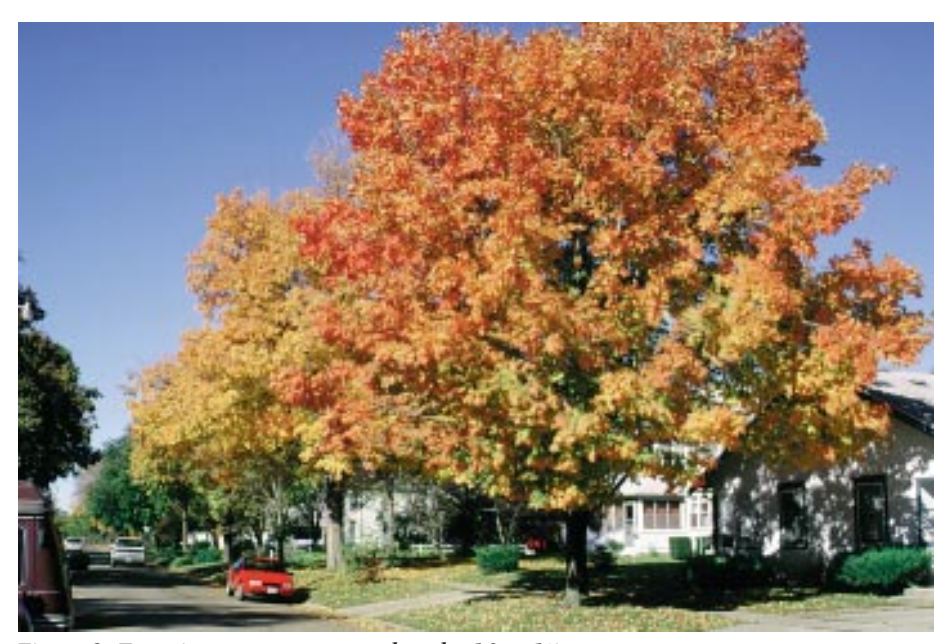
Figure 2. Trees increase property values by 10 to 15 percent.