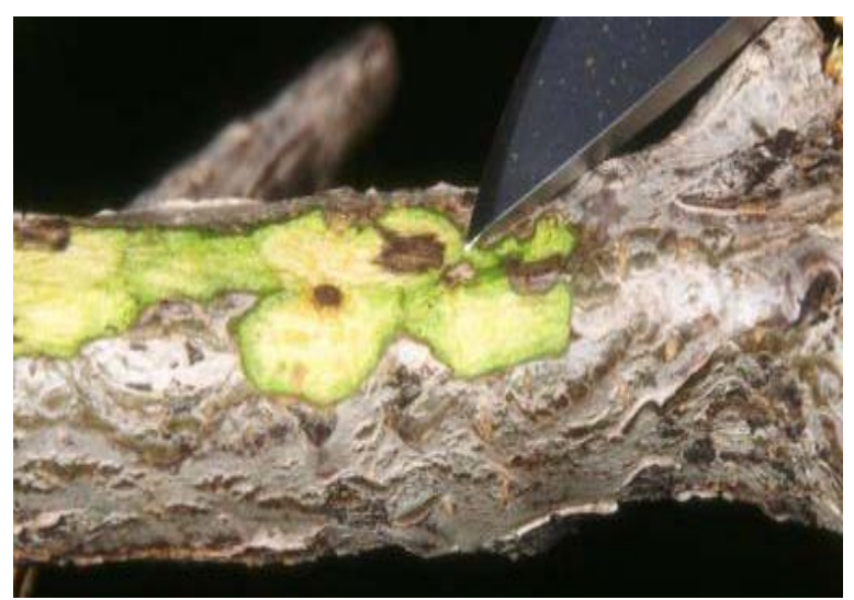
Geosmithia canker on black walnut twig