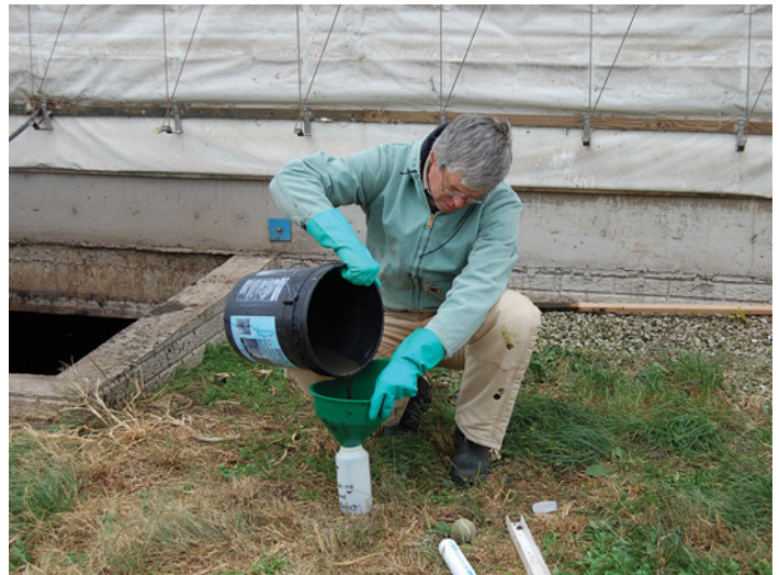
Figure 1. Collecting a liquid manure sample.