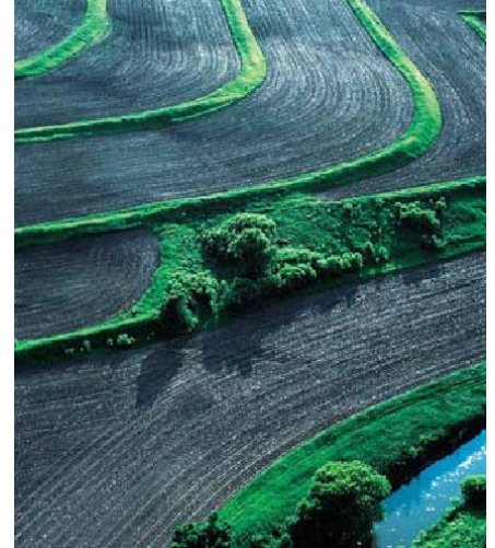
Producers who plan ahead can influence their P index results by controlling erosion.

Since the P index is based on several factors including the erodibility of the soil, the soil test results and the distance from a stream, many producers will find that they will be able to use nitrogen-based application rates. Others may be able to adjust their land management practices, such as increasing residue cover, and still use a nitrogen-based application rate.