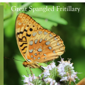
Great Spangled Fritillary