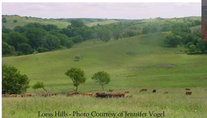
Loess Hills - Photo Courtesy of Jennifer Vogel