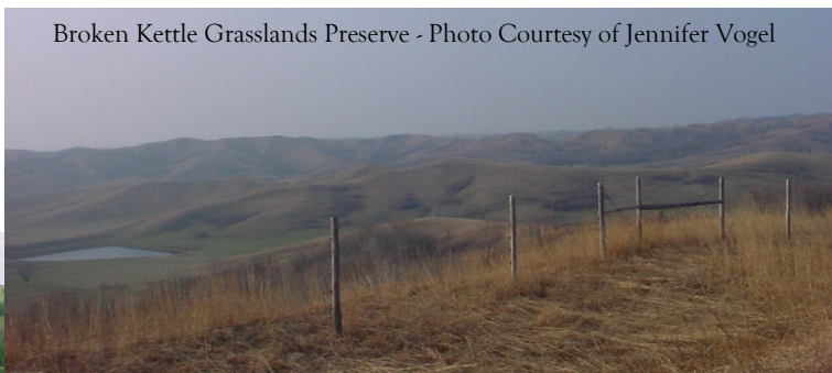
Broken Kettle Grasslands Preserve - Photo Courtesy of Jennifer Vogel