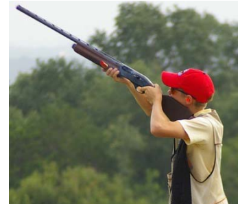
Certified volunteer coaches are key for the growth of the Scholastic Clay Target Program

A training curriculum is being developed primarily for Scholastic Clay Target Program and High School Clay Shooting coaches with the first training courses being offered this fall. Courses will be one day, low-cost courses specific to trap, skeet or sporting clays and will be part classroom and part hands-on with live fire. The course is being designed to meet the needs of teacher/coaches as well as volunteer instructors. Courses will contain information on safety/risk management, fundamentals, season logistics, school-based programs, and rules. Tentative trapshooting dates are September 15 at Harlan and October 6 at Ames. Course size will be limited to 10 participants at each course for this fall.