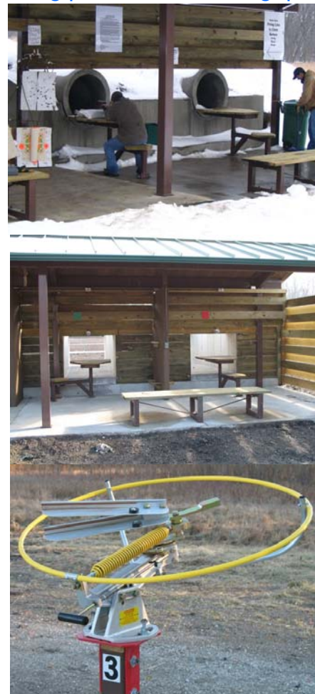
Top to Bottom: Improvements at Banner Shooting Range include removal of the old concrete 'shooting tubes' and installation of new clay target traps. 5-stand sporting clays is also available periodically

Hawkeye range is frequented by shooters from around the Iowa City Area. Tentative plans for Hawkeye include additions of targets/stands and fencing on the rifle/handgun range, installation of a new archery range and improved range signage.