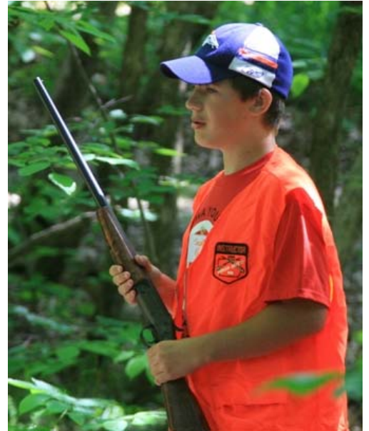
A YHEC participant works his way through the Hunter Safety Trail, one of eight events at the Iowa Youth Hunter Education Challenge

Iowa YHEC (Youth Hunter Education Challenge) is a weekend-long event that takes place each June at the 4-H Education and Natural Resources Center in Madrid, Iowa. Youth from all over Iowa come to compete in eight events, learn about the outdoors, and have fun with other youth and adults that have similar interests. The events include four shooting events: archery, muzzleloading rifle, shotgun, and small-bore rifle. There are also four non-shooting events: wildlife identification, orienteering, hunter safety trail, and written exam. There are two age categories to compete in, Junior (ages 12-14) and Senior (15-18). Most youth compete as part of a team of five from their area, but youth can register as individuals as well. All participants must compete in all eight events. To get a copy of the event rules and registration materials, please contact the Iowa DNR Recreational Safety Officer (RSO) in your area. Additional information and results from the 2007 event are available online at http://www.iowadnr.com/law/yhec/index.html . Next year's event will take place on June 6-8.