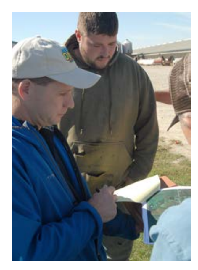
Inspecting, explaining complex rules or responding to a complaint—all in a day's work—as DNR environmental specialists help people meet state regulations.