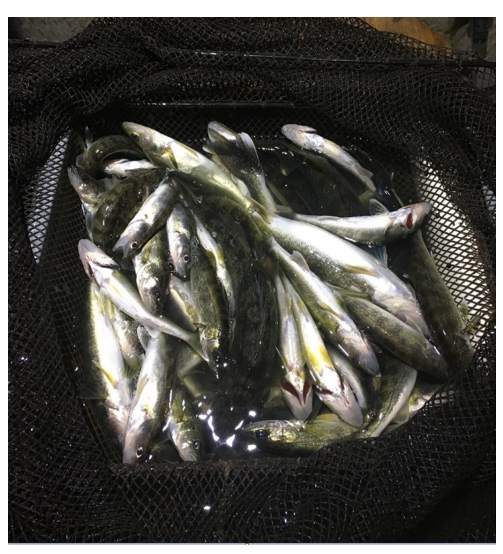
Talk about a net full of Walleyes! This was taken after one short electrofishing survey at Three-Mile Lake in Fall 2019. In addition to the good numbers of Walleye, notice the many different sizes of Walleye available to anglers. Add Three-Mile Lake to your list to fish in 2019, especially if you like Walleye fishing.

Little River Lake: This lake continues to produce some phenomenal fishing. Many anglers took advantage of the 9+ inch Bluegills available last year. Crappies are harder to find, but are mostly 9-10 inches with some over 12 inches. Excellent numbers of 14-16 inch long Largemouth Bass, with Bass up to 20 inches. Walleye, 12-22 inches long, and bonus large catfish (over 30 inches) are also available.