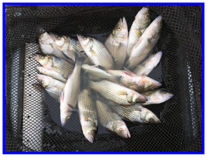
Hybrid Striped Bass (aka Wipers) like these from RAPP Park can put up a big fight for anglers.

If you're lucky enough to win the battle with a Wiper and want to harvest the fish, remember these considerations. First, put your catch on ice as soon as possible to keep the fish fresh. Wipers are often caught mid-summer when the air and water temperatures are warm. When you fillet the fish, you will see a red stripe down the center of the fillet. This is red muscle the fish uses for burst swimming and is filled with blood. Cut out that red strip of muscle before you soak your fillet in your favorite fish batter and introduce it to the cooking oil. The red muscle can give the fish an off-flavor that some people do not find pleasing.