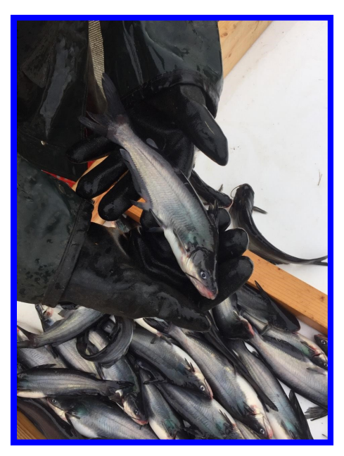
Blue Catfish raised at the Mount Ayr Fish Hatchery in 2018.