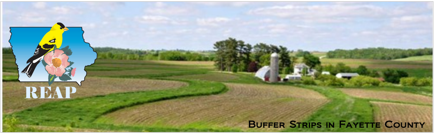
BUFFER STRIPS IN FAYETTE COUNTY